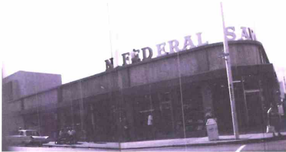
1260 Washington Avenue, 1963 photograph

The applicant is proposing the total demolition of this building in order to construct a new 6-story mixed use structure. As outlined above, a number of modifications have taken place over time including the removal of nearly all significant architectural features and original materials. Consequently, staff is not opposed to the proposed demolition and replacement with a new building that is consistent with the scale and character of the surrounding historic district.