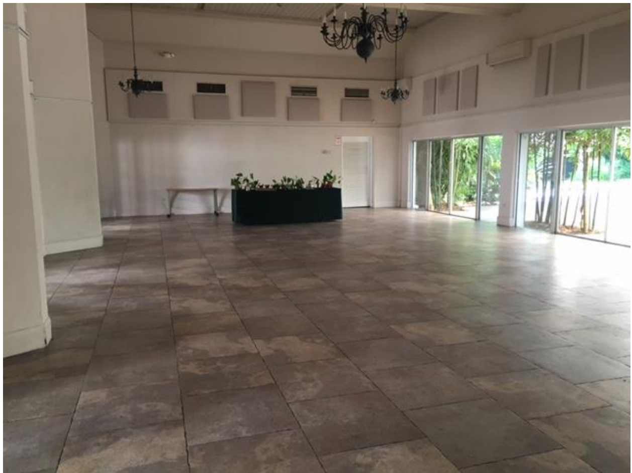
10. Banyan Ball Room South Wall