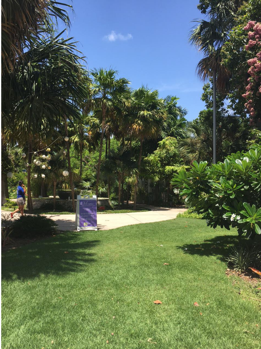
11. Eastern View