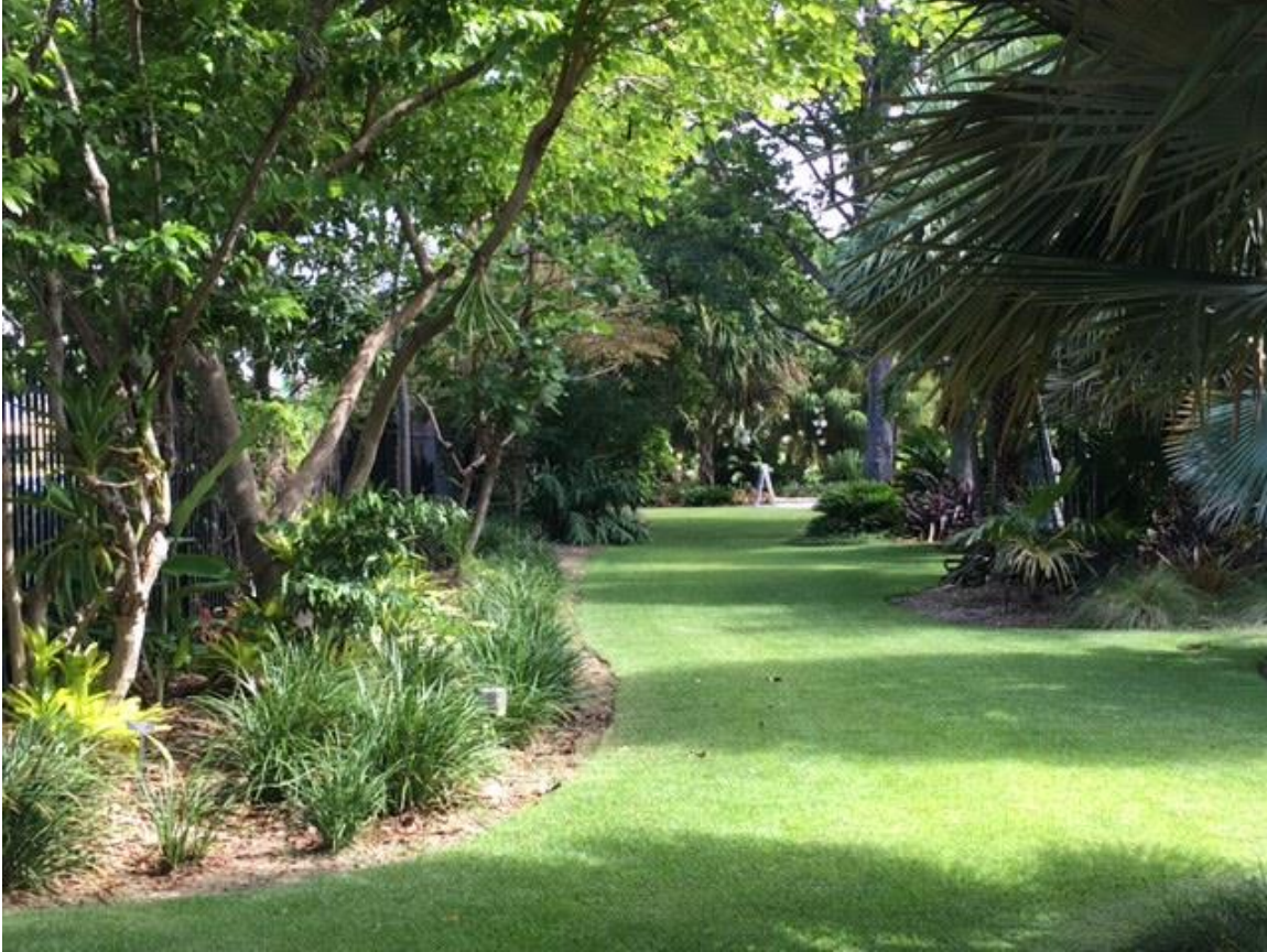
6. East Swale South