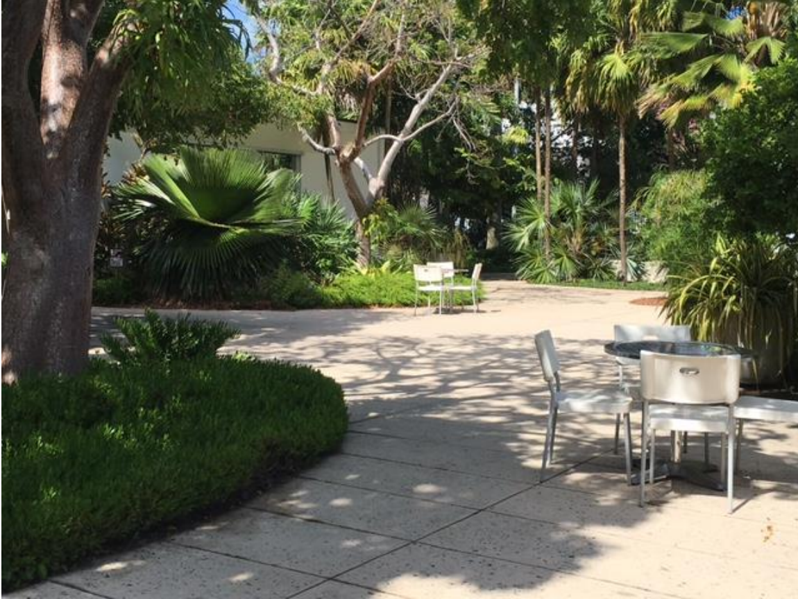
7. Patio East