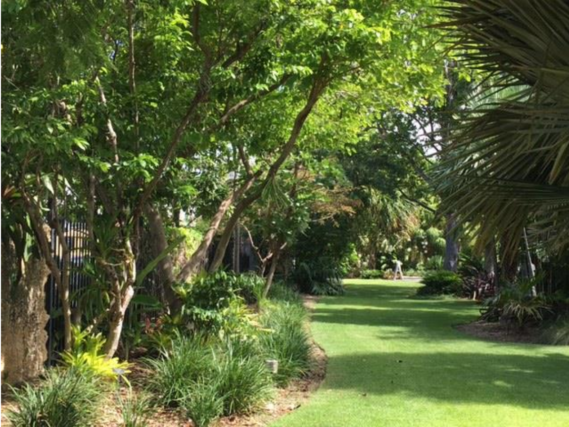
9. East Side Fence South