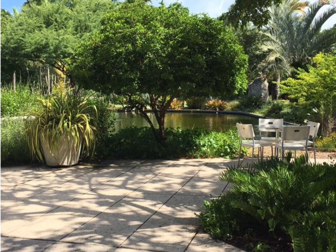
8. Patio South