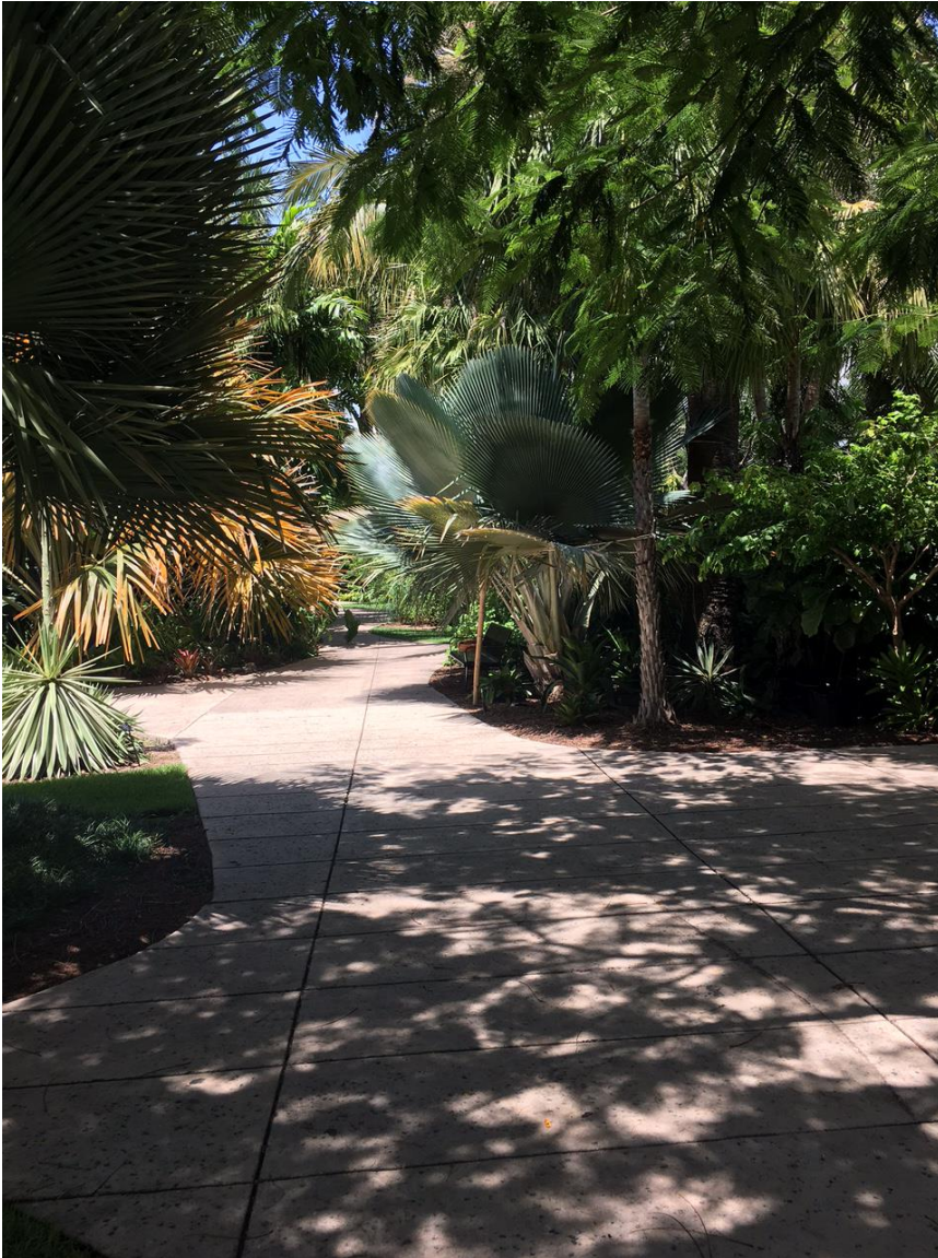
12. East from Northgate