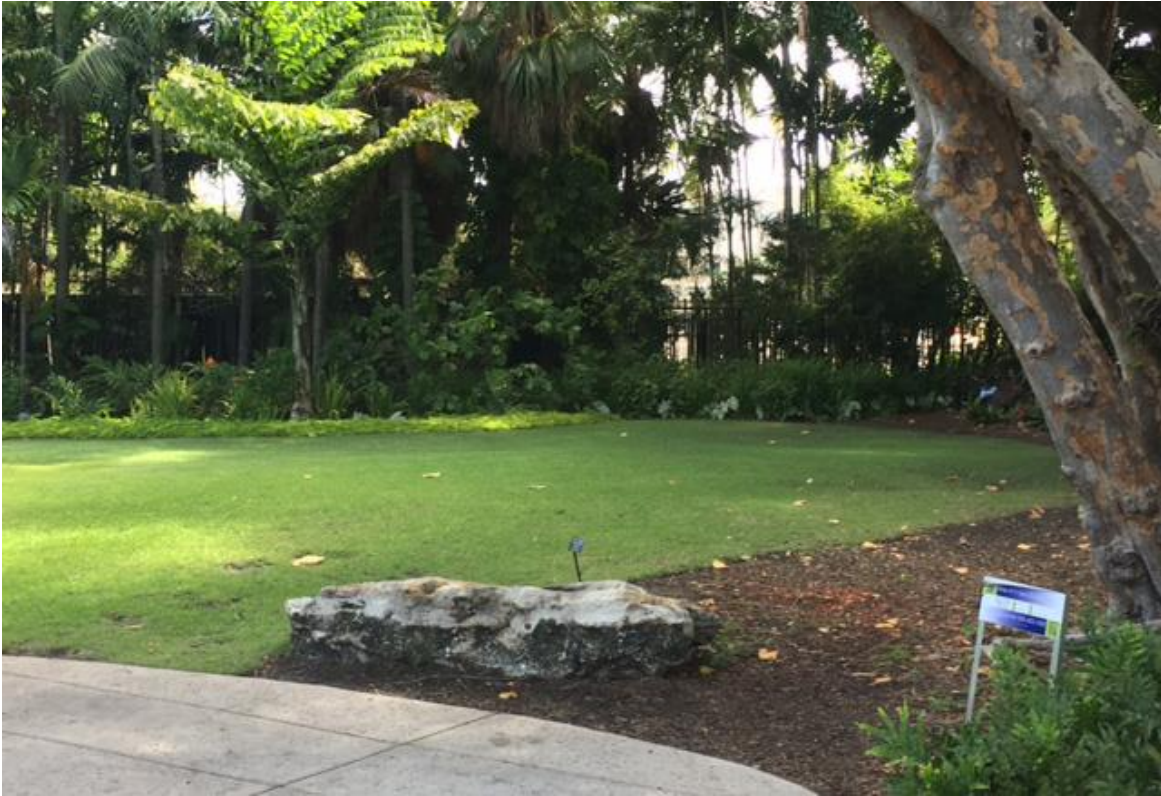
3. Banyan Lawn – West