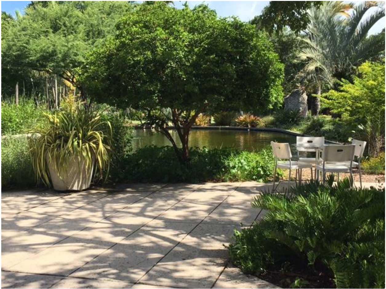
1. Patio South