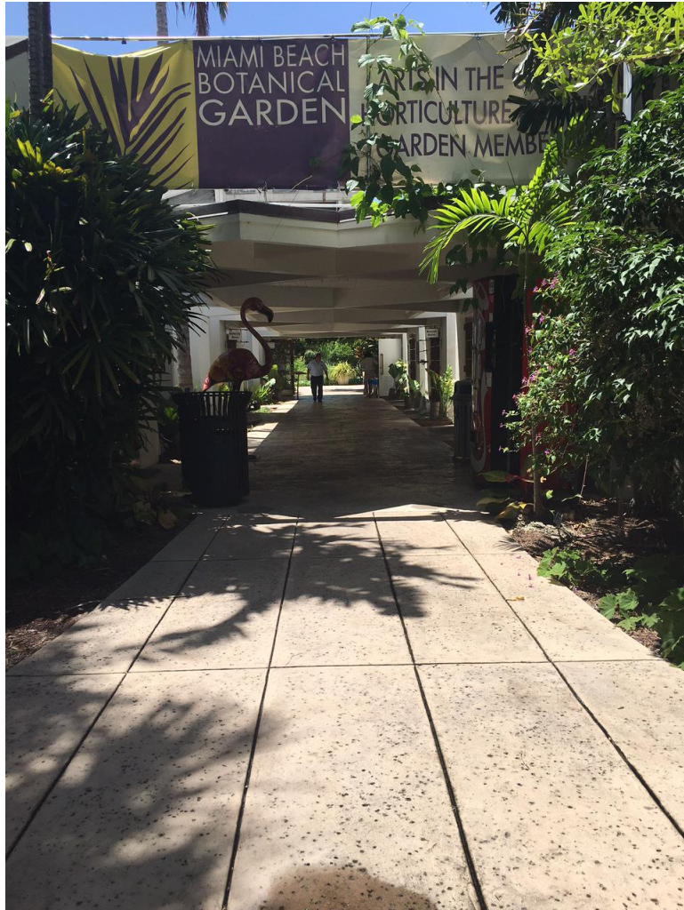
13. South through the loggia