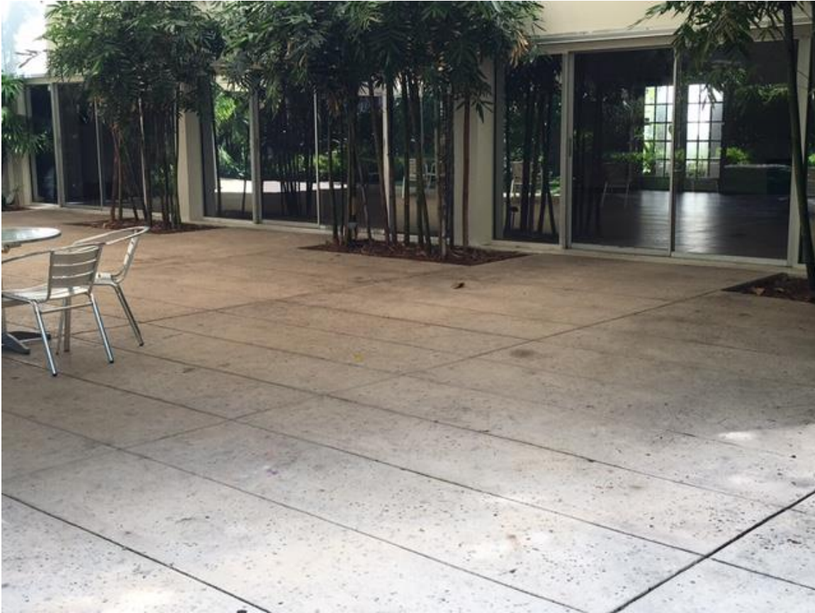
4. Banyan Room Ballroom Northwest