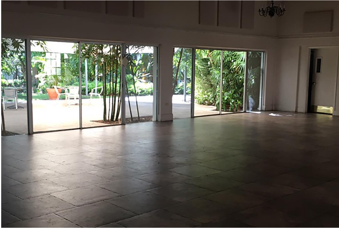
2. Banyan Room Ballroom Northwest