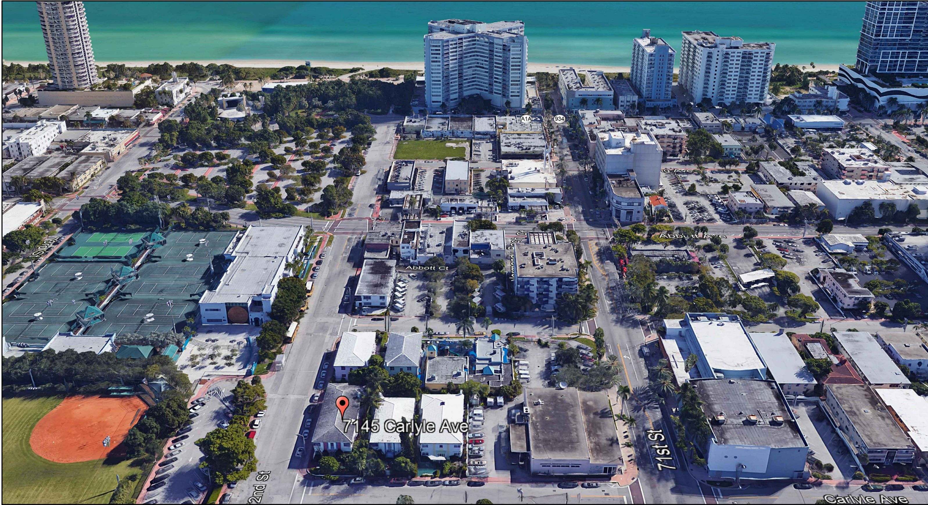
VIEW TOWARDS EAST