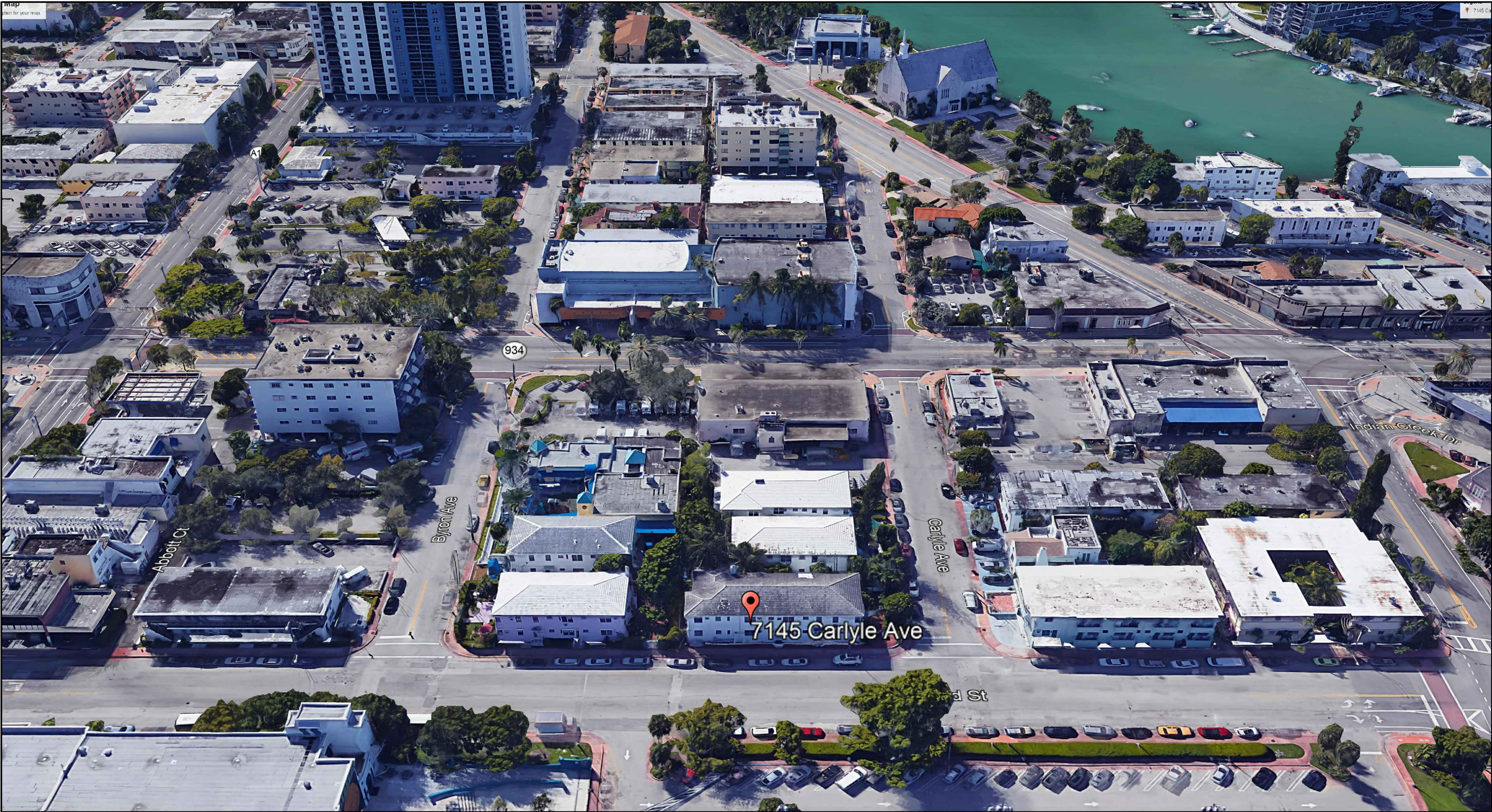
VIEW TOWARDS SOUTH