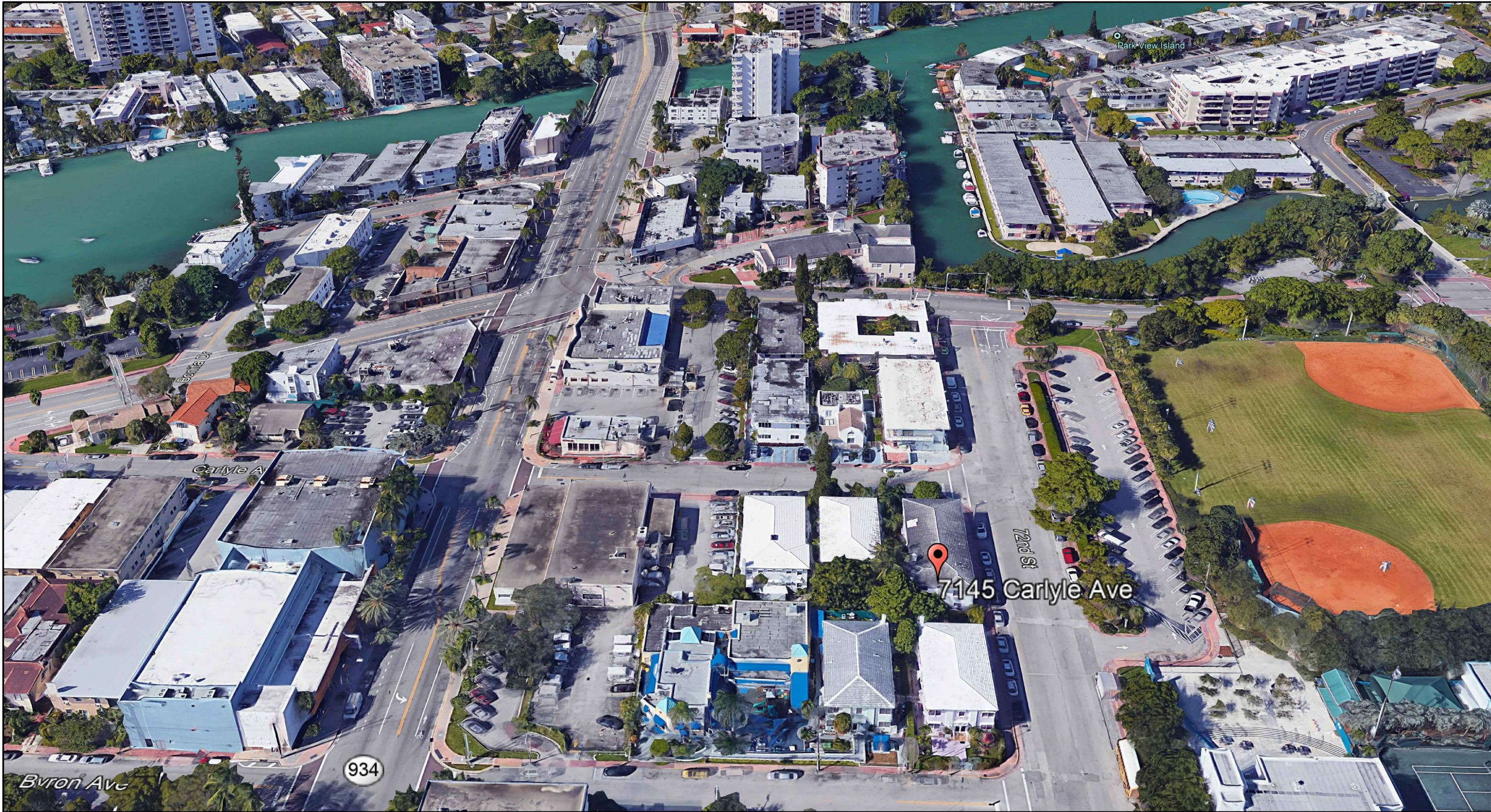
VIEW TOWARDS WEST