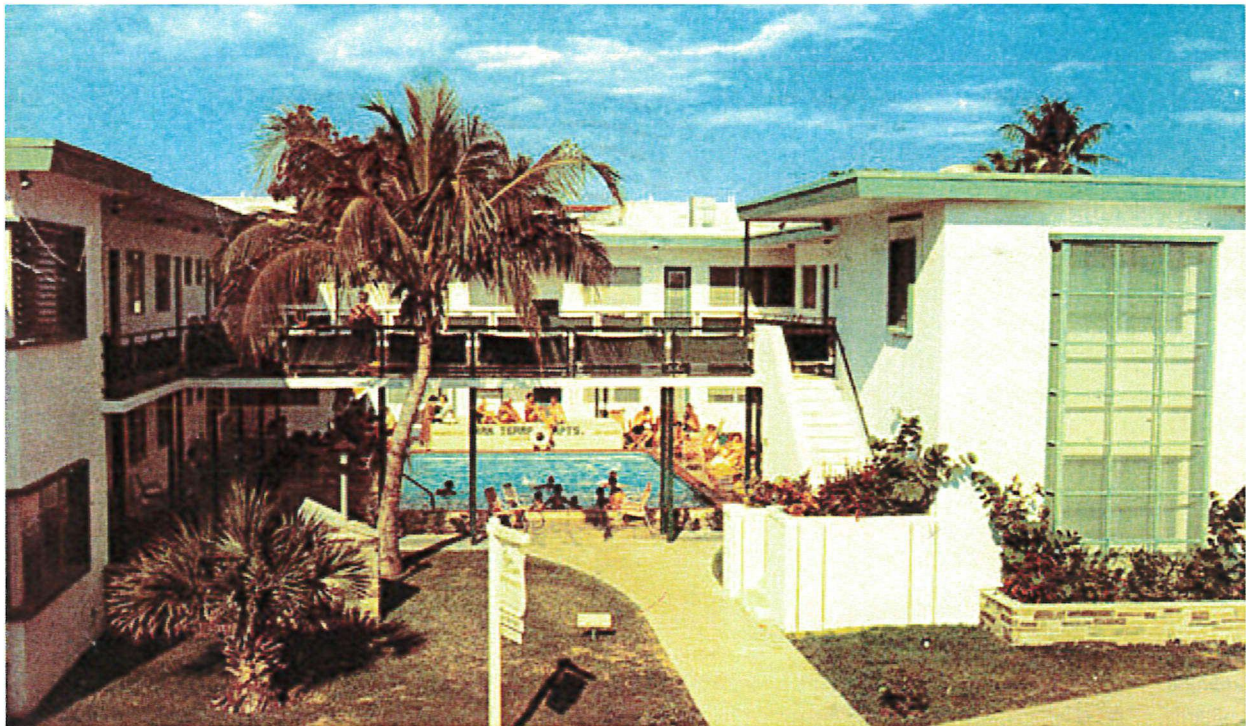
Postcard of the Park Terrace Apartments, postmarked November 2, 1957, catobear.com

Collectively, these modifications result in a design that achieves a greater level of compatibility with the surrounding historic district. However, staff continues to recommend that the elevator structures be relocated from within the courtyard and placed within the new addition in order to reduce the perceived mass of the building. Further, staff continues to recommend that all exterior architectural features located on the Contributing portions of the building be fully restored and/or reintroduced in a manner consistent with available historical documentation, including the original screen features.