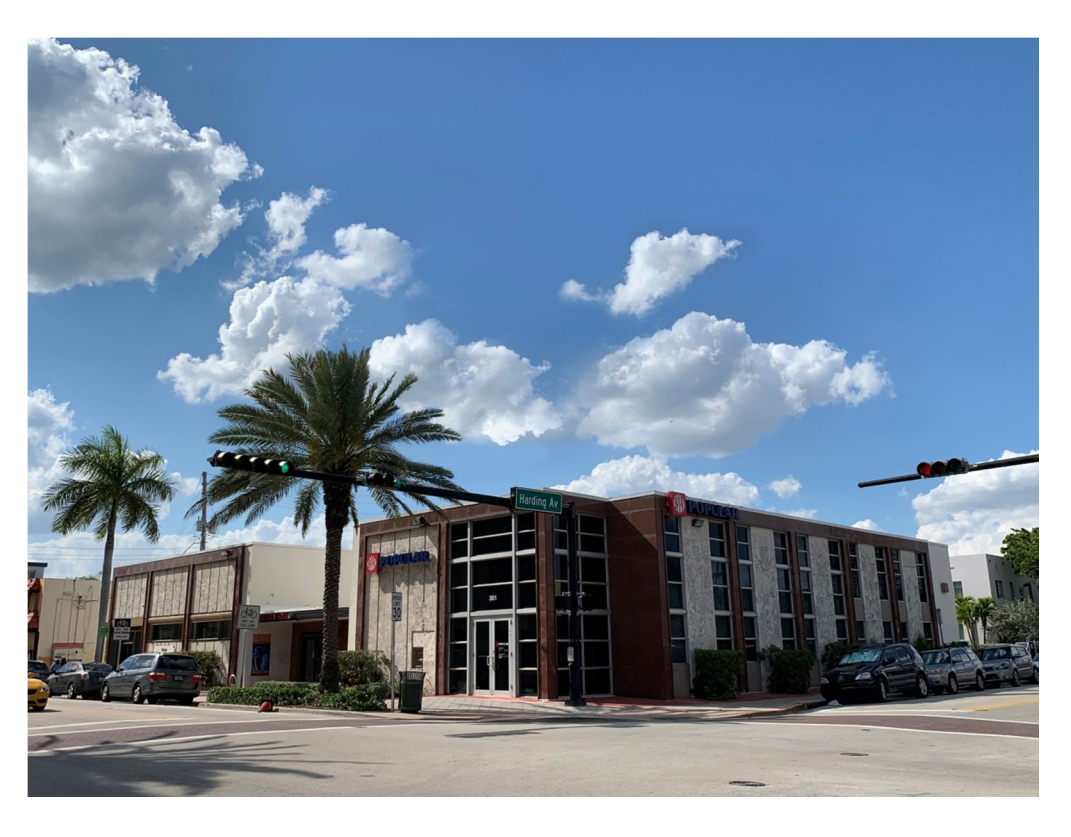
AFTER PYLON DEMOLITION