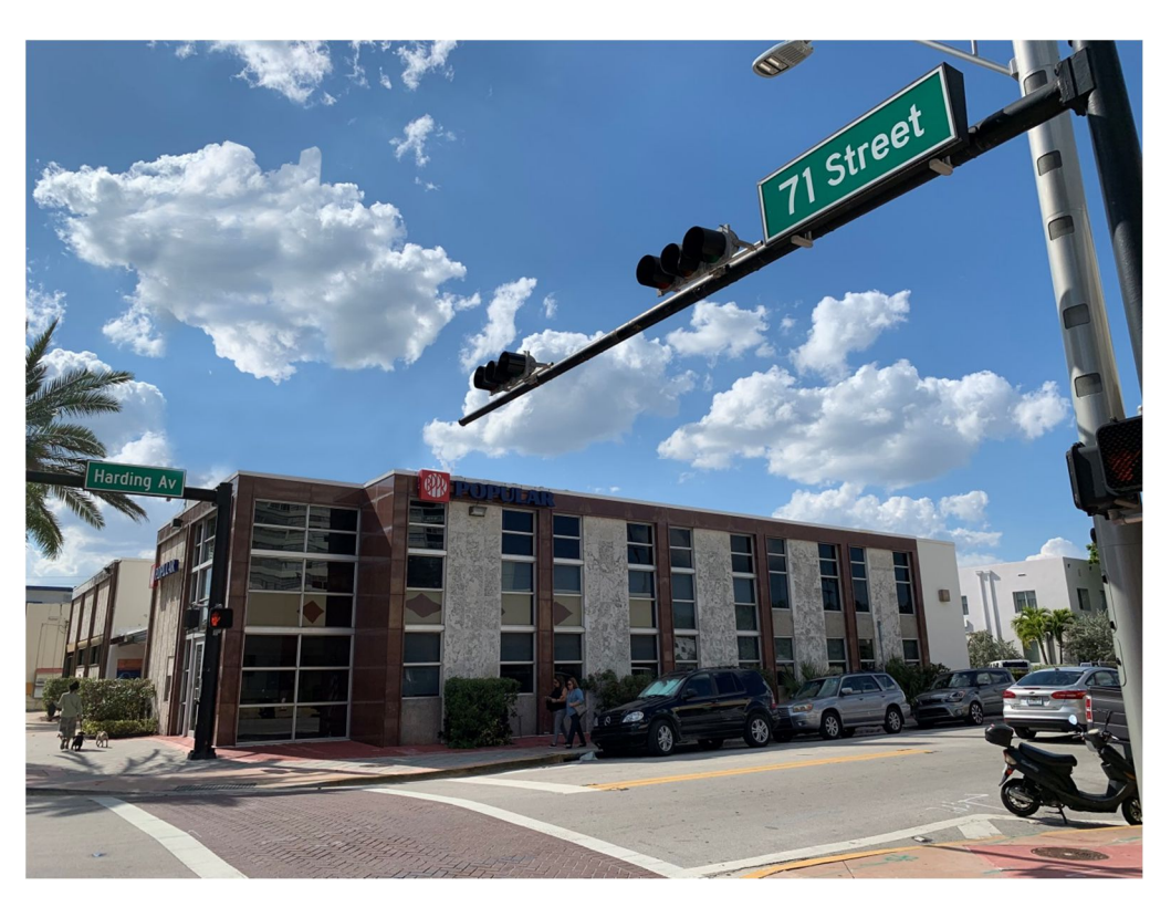
AFTER PYLON DEMOLITION