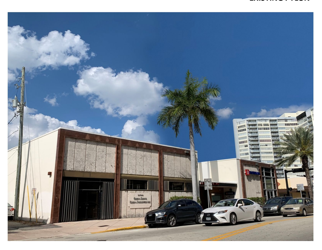
AFTER PYLON DEMOLITION