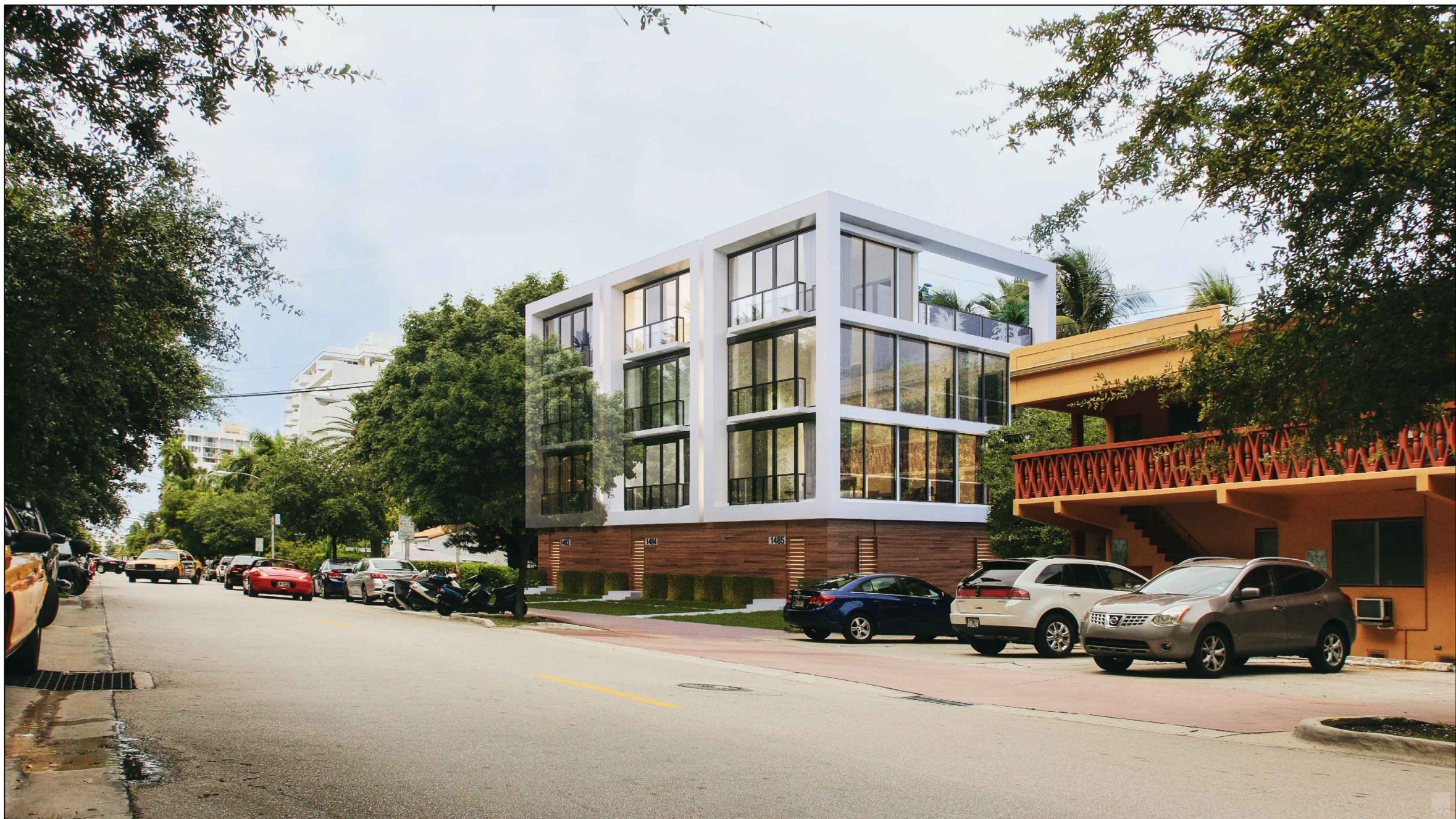
Project Rendering - View From Southwest