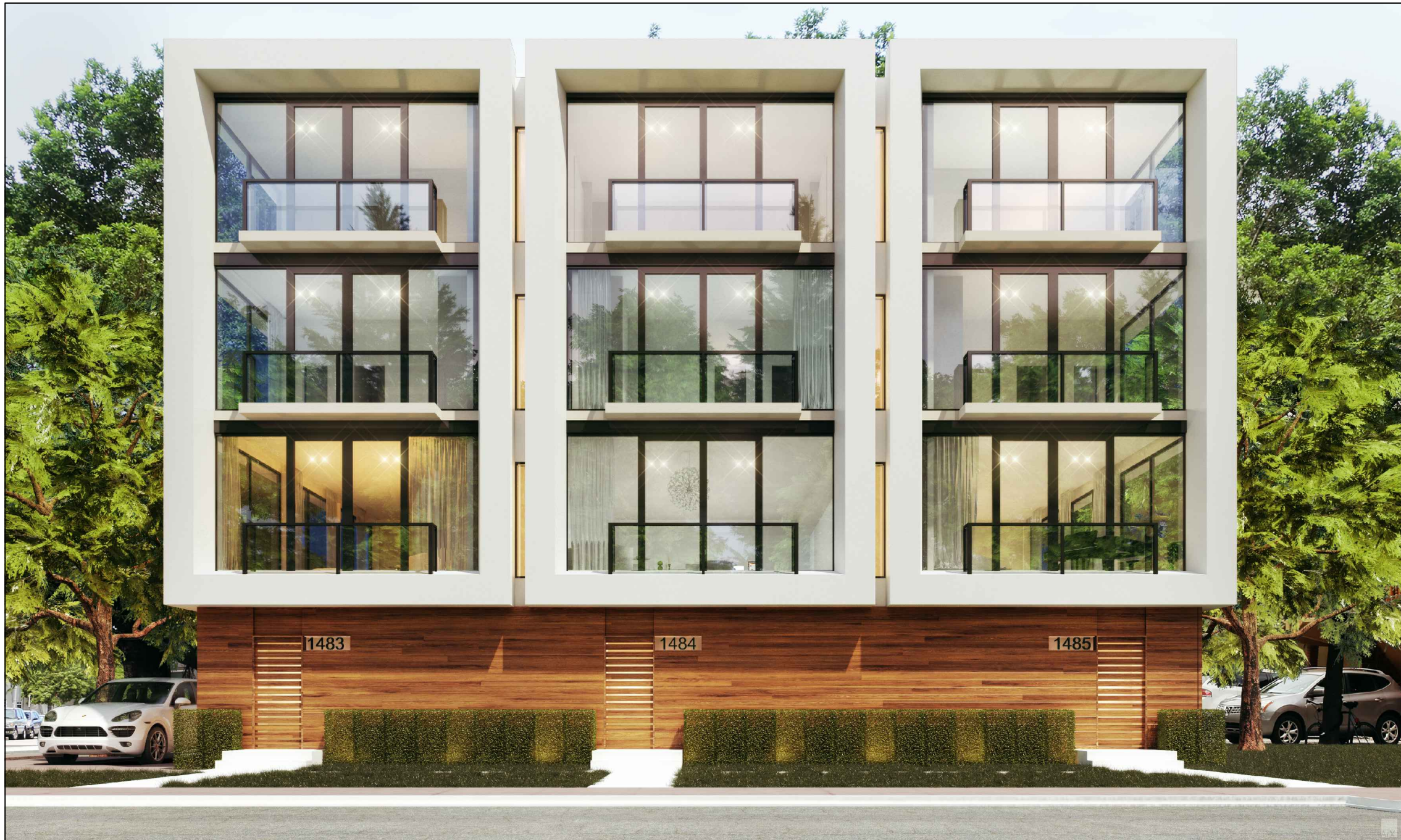
Project Rendering - View From Southwest