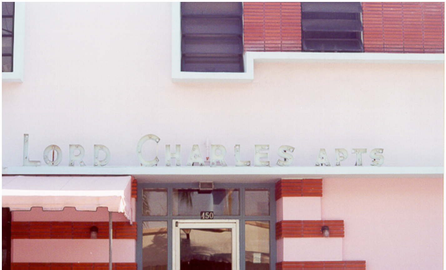
LORD CHARLES: SIGNAGE 1999