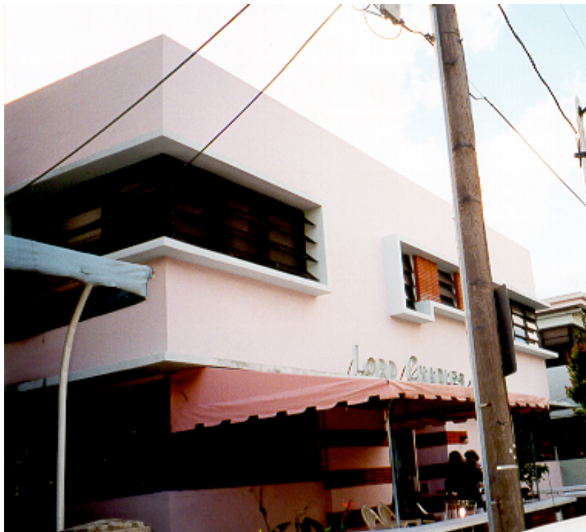
LORD CHARLES 1999