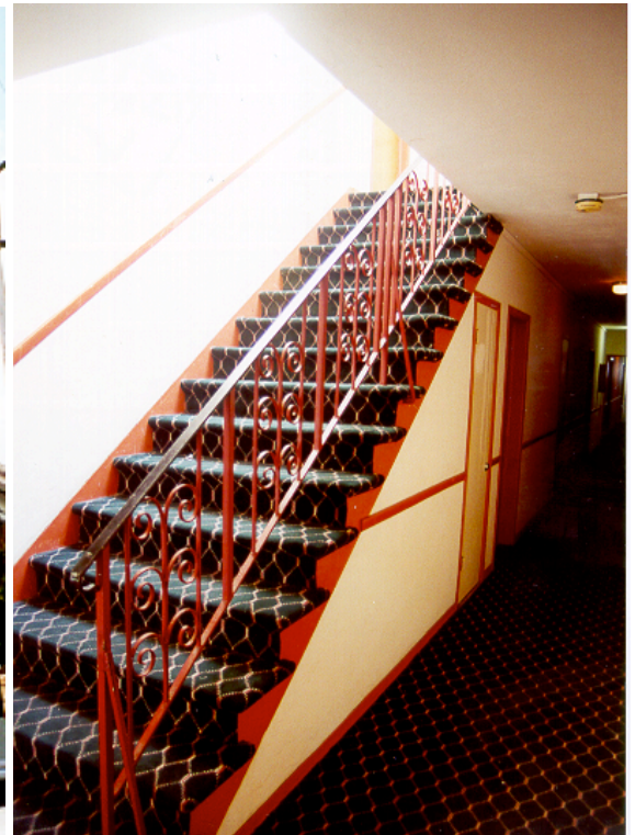
INTERIOR STAIR 1999 Existing original interior stair which is not code compliant.