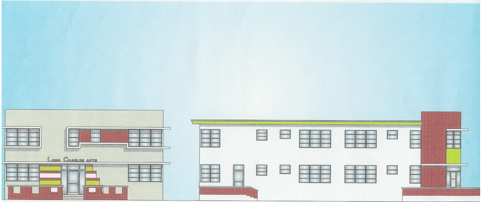
COLORED RENDERING BY: SWANKE HAYDEN CONNELL ARCHITECT 2002