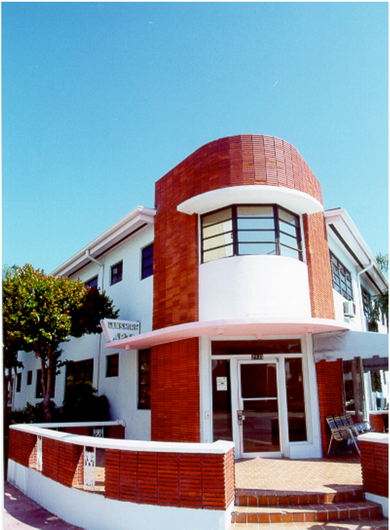
GAMSHIRE: HISTORY 1999