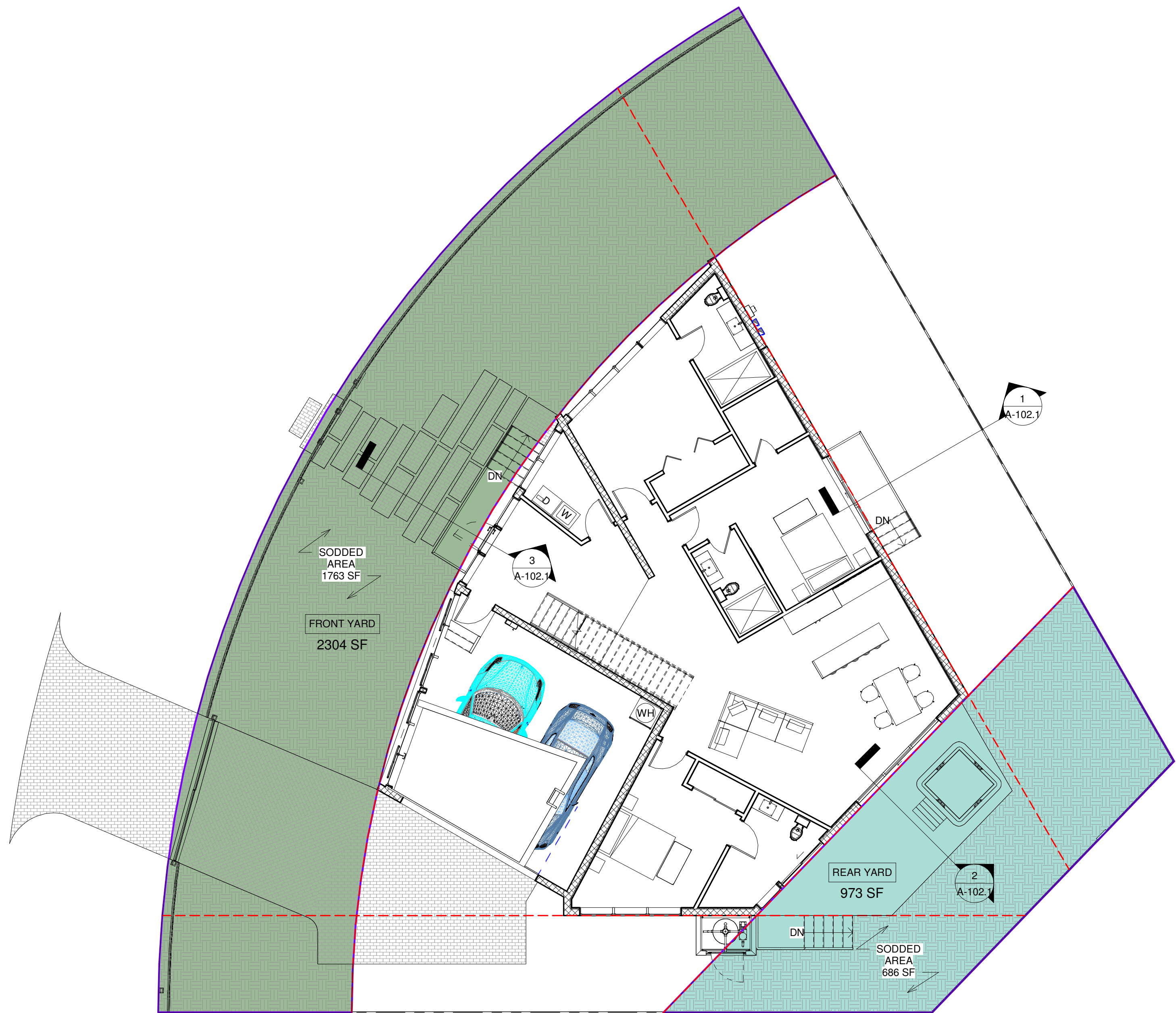
2 YARD DIAGRAM 1/8" = 1'-0"