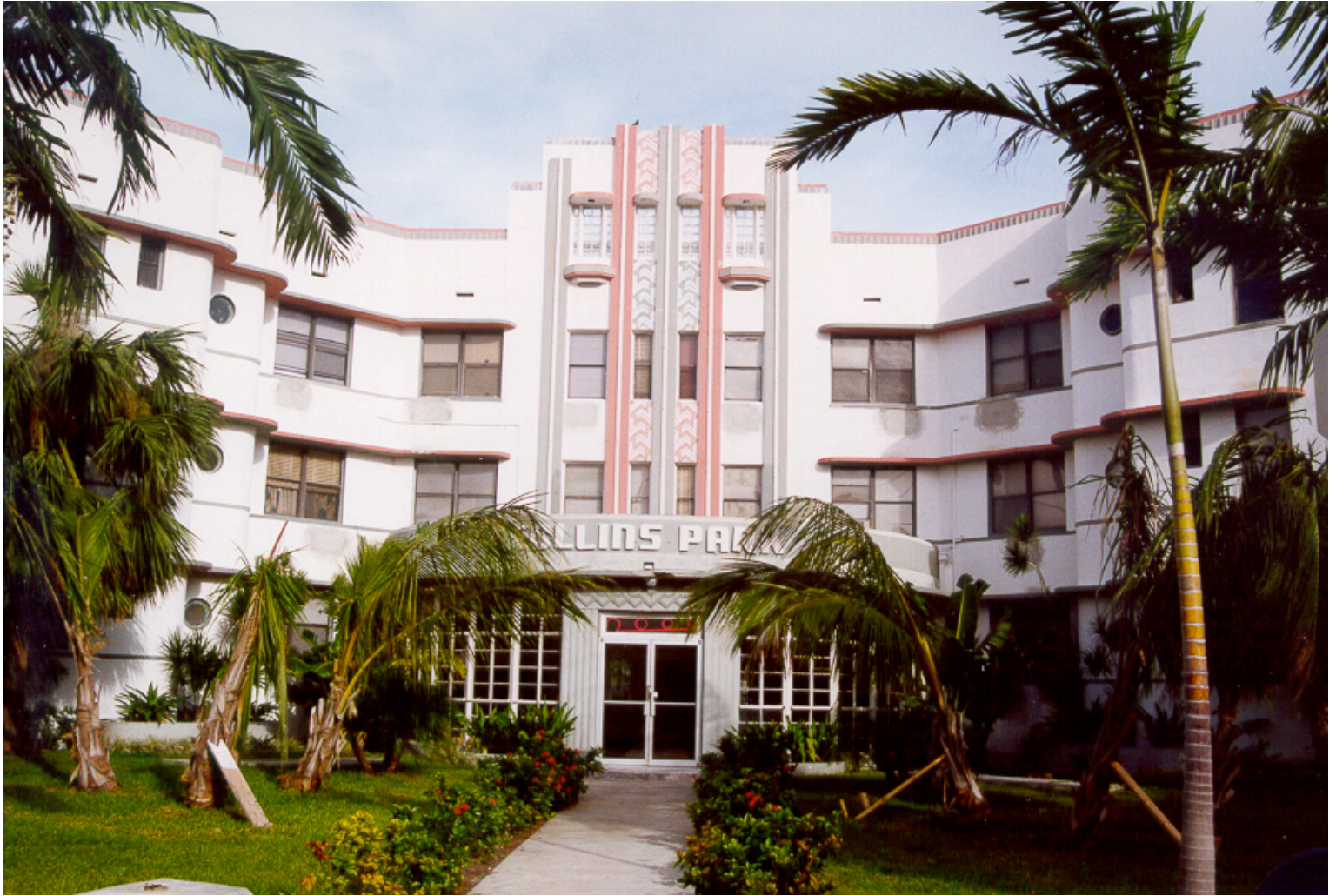
PHOTOGRAPH CIRCA 1999

Although the radio waves at the door panels are not in this photograph they were existing at the time of this photo.