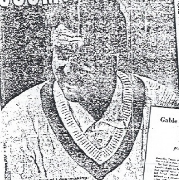
A Generation of Love-making