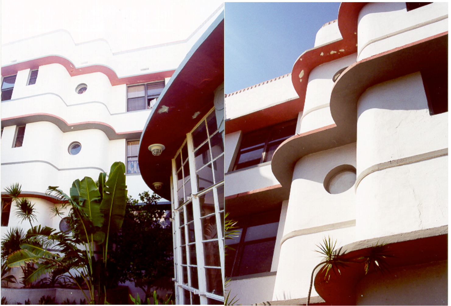
COLLINS PARK: EXTERIOR FRONT ELEVATION VIEWS 1999