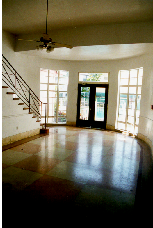
TYLER: INTERIOR at COURTYARD LOBBY 1999