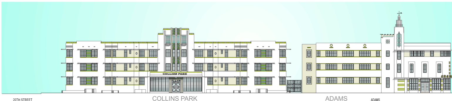
VIEW FROM PARK AVENUE

COLORED RENDERING BELOW by SWANKE HAYDEN CONNELL ARCHITECTS 2002