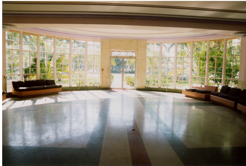
COLLINS PARK : INTERIOR LOBBY AT MAIN ENTRANCE 1999