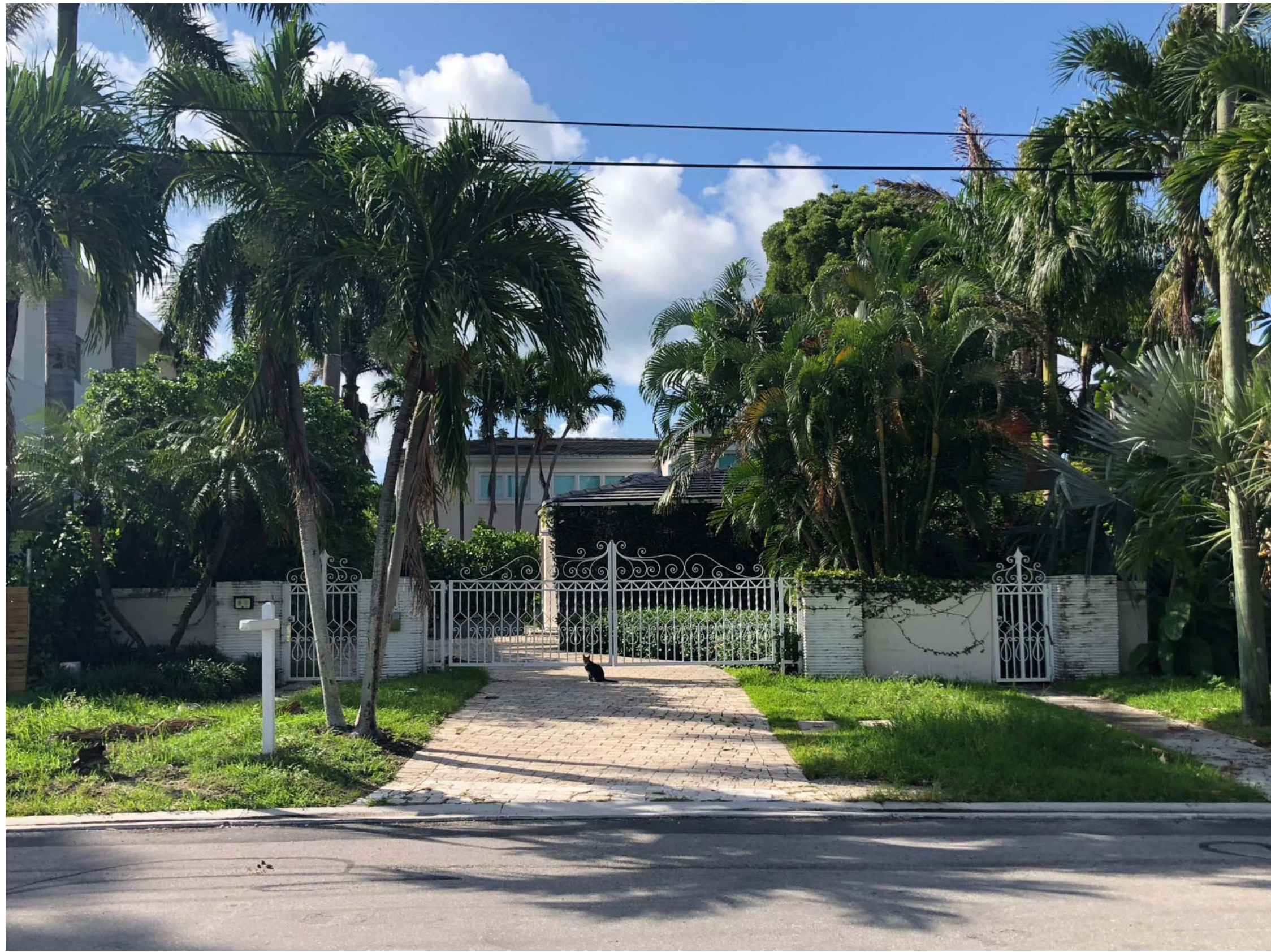
1 EXISTING HOUSE Scale: N.T.S.