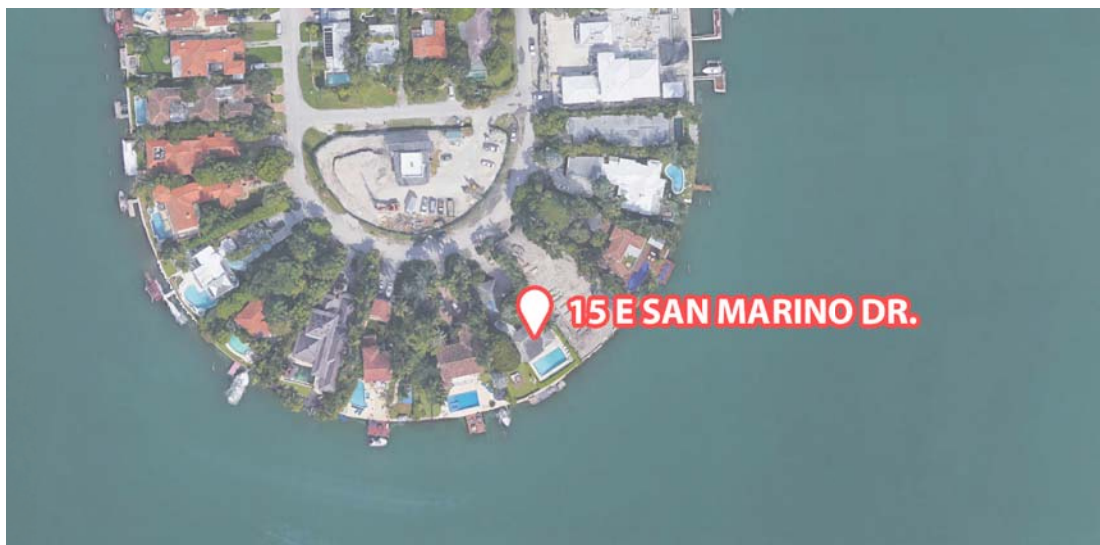
B NEIGHBORHOOD CONTEXT Scale: N.T.S.