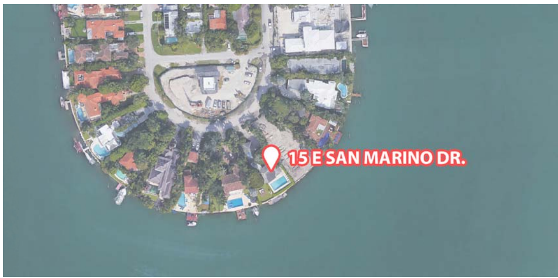
B NEIGHBORHOOD CONTEXT Scale: N.T.S.