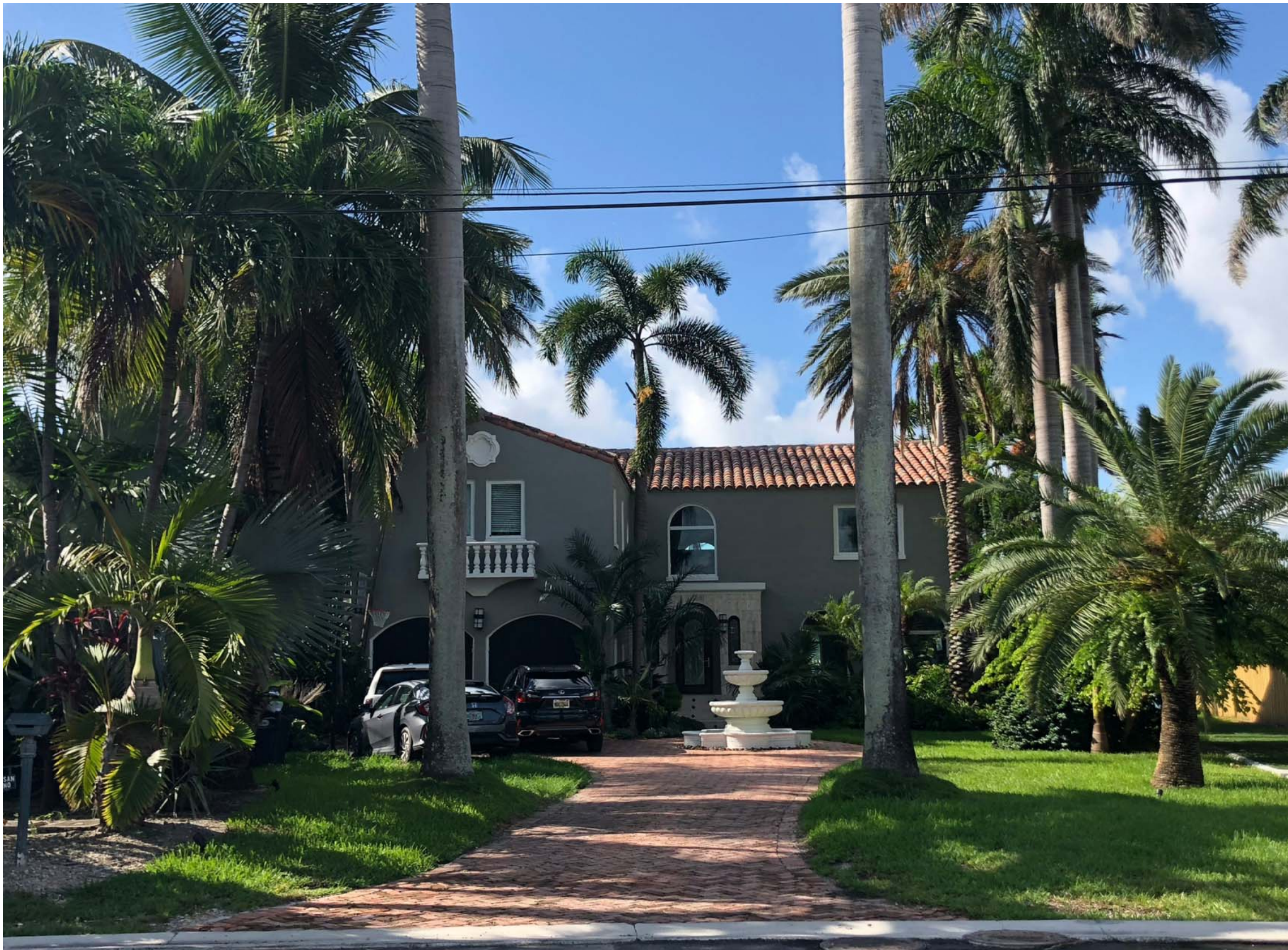
3 WEST NEIGHBOR 1 Scale: N.T.S.