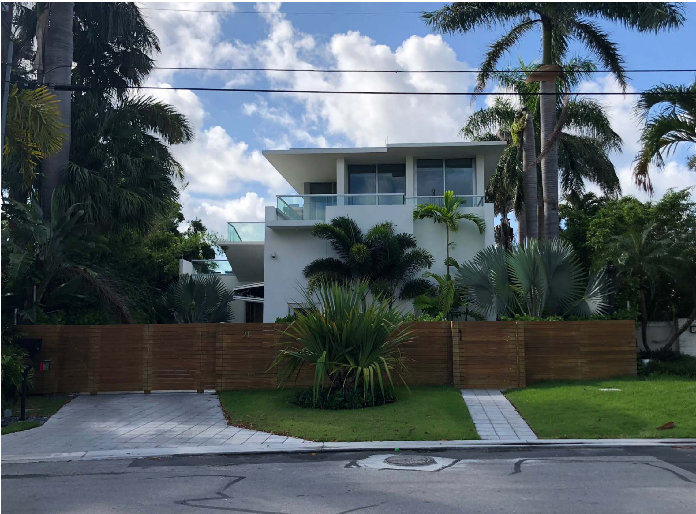
2 EAST NEIGHBOR 2 Scale: N.T.S.