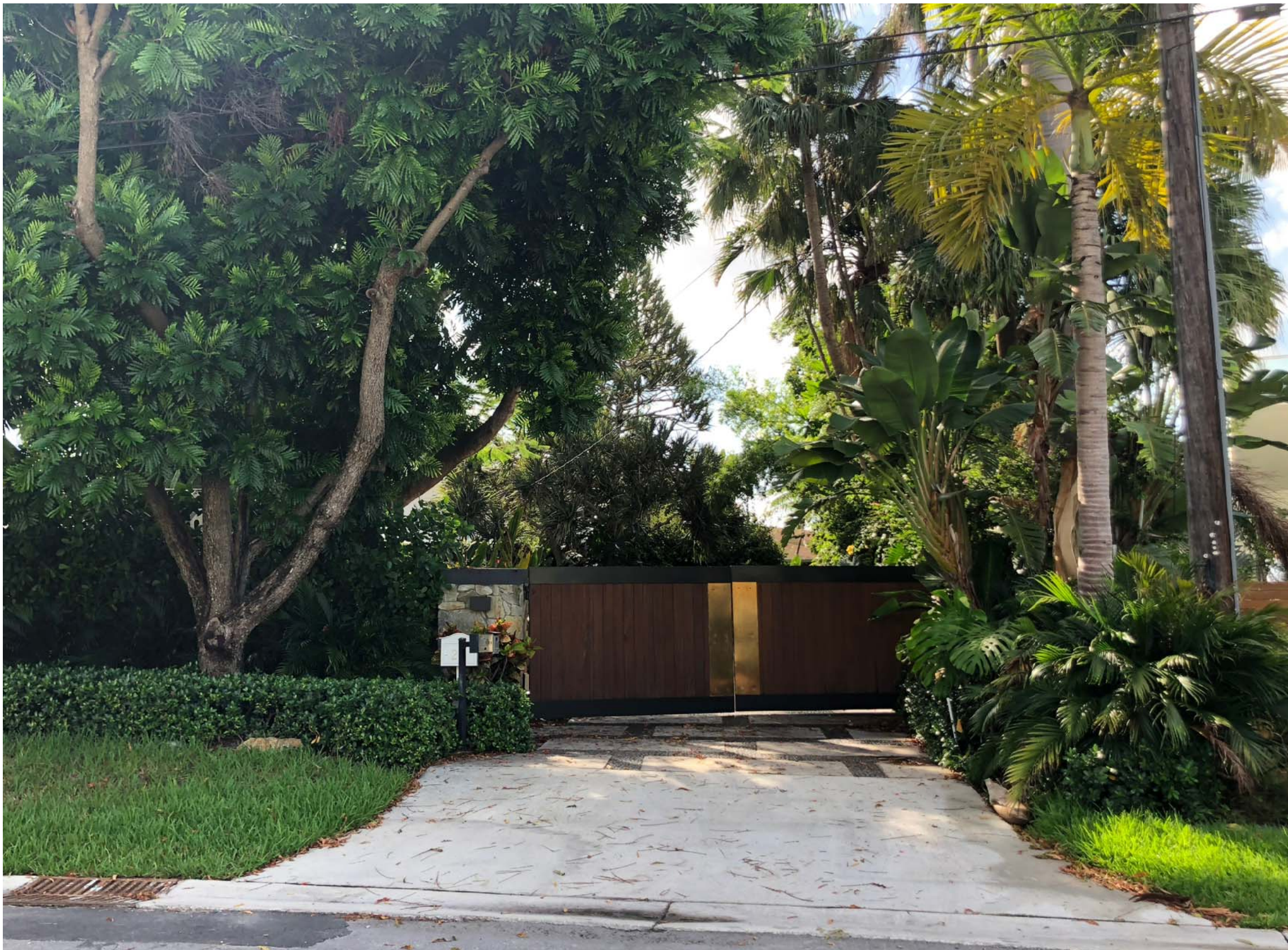
1 EAST NEIGHBOR 1 Scale: N.T.S.