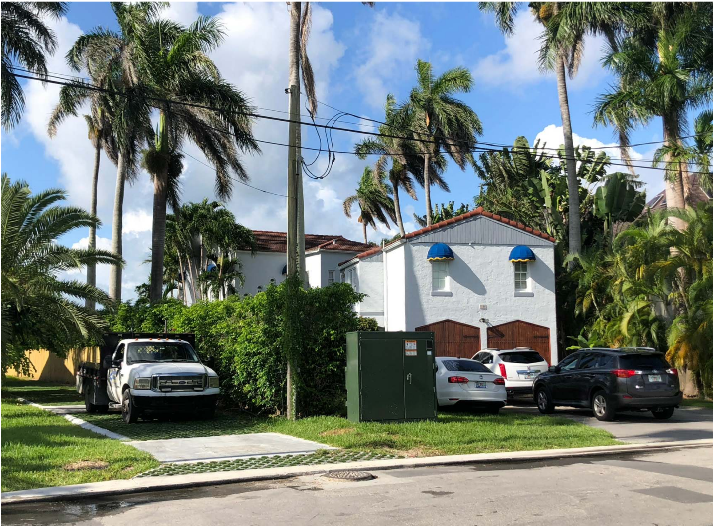
4 WEST NEIGHBOR 2 Scale: N.T.S.