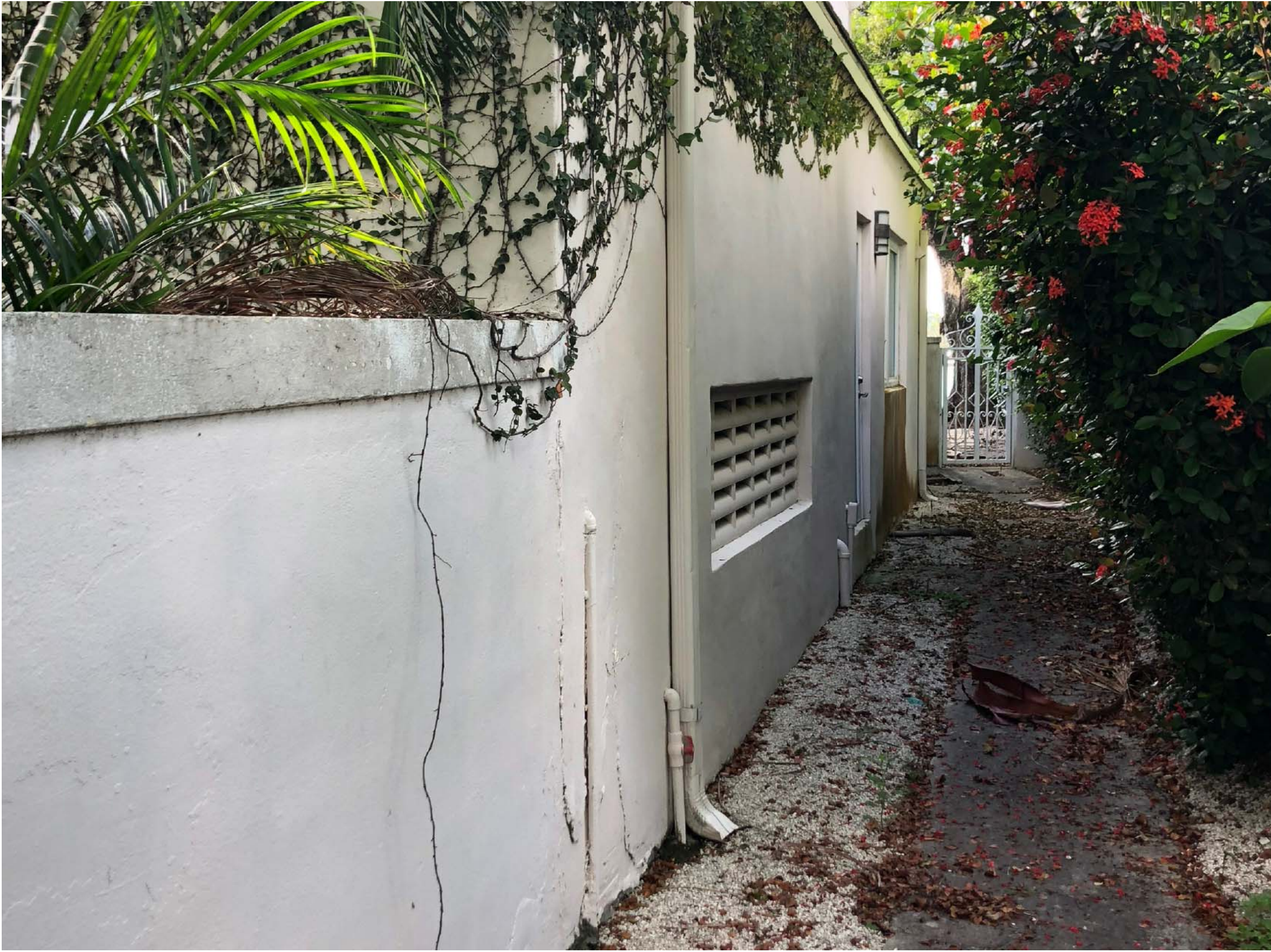
7 EXISTING HOUSE Scale: N.T.S.