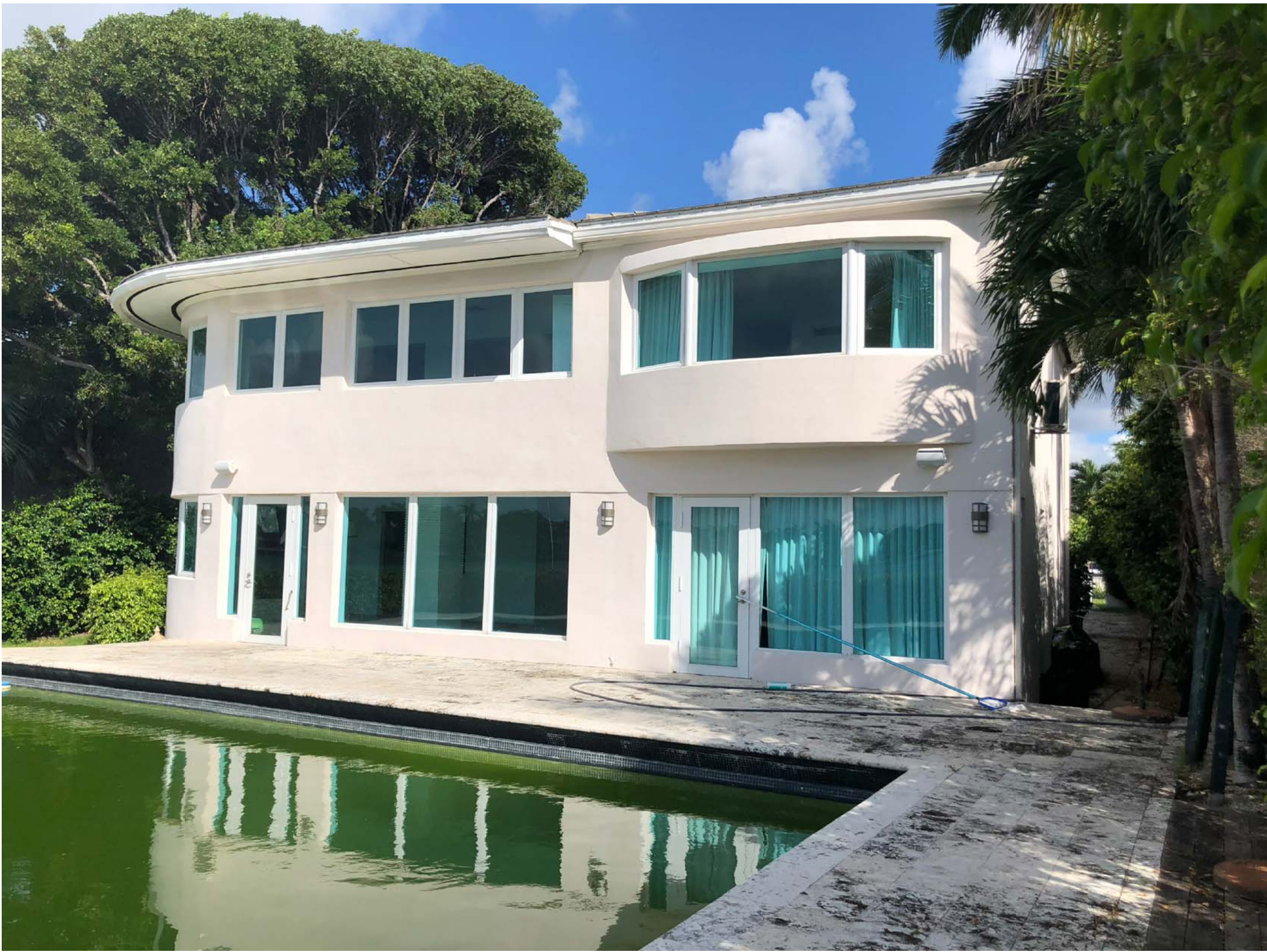
6 EXISTING HOUSE Scale: N.T.S.