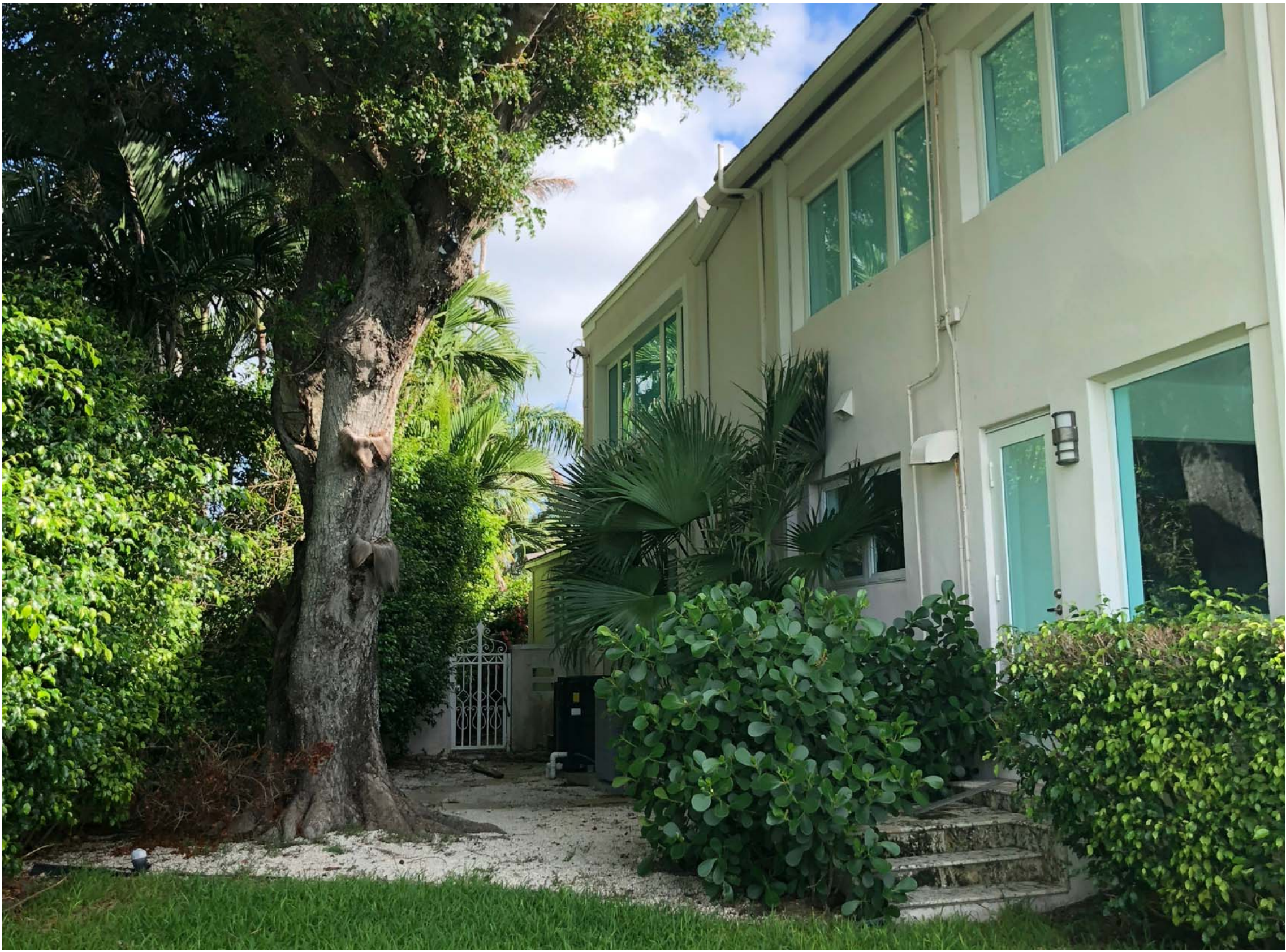
4 EXISTING HOUSE Scale: N.T.S.