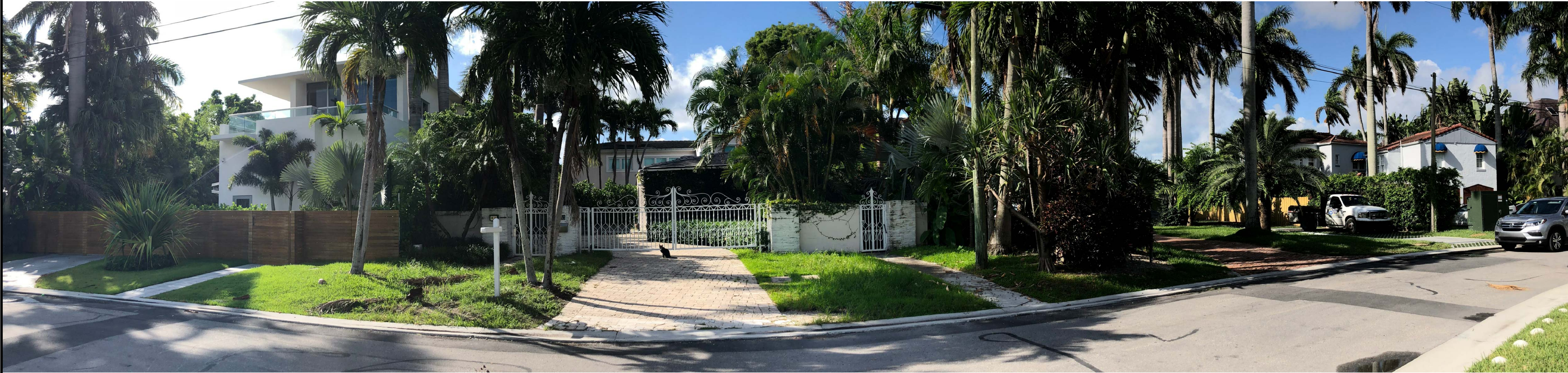
1 EXISTING Scale: N.T.S.