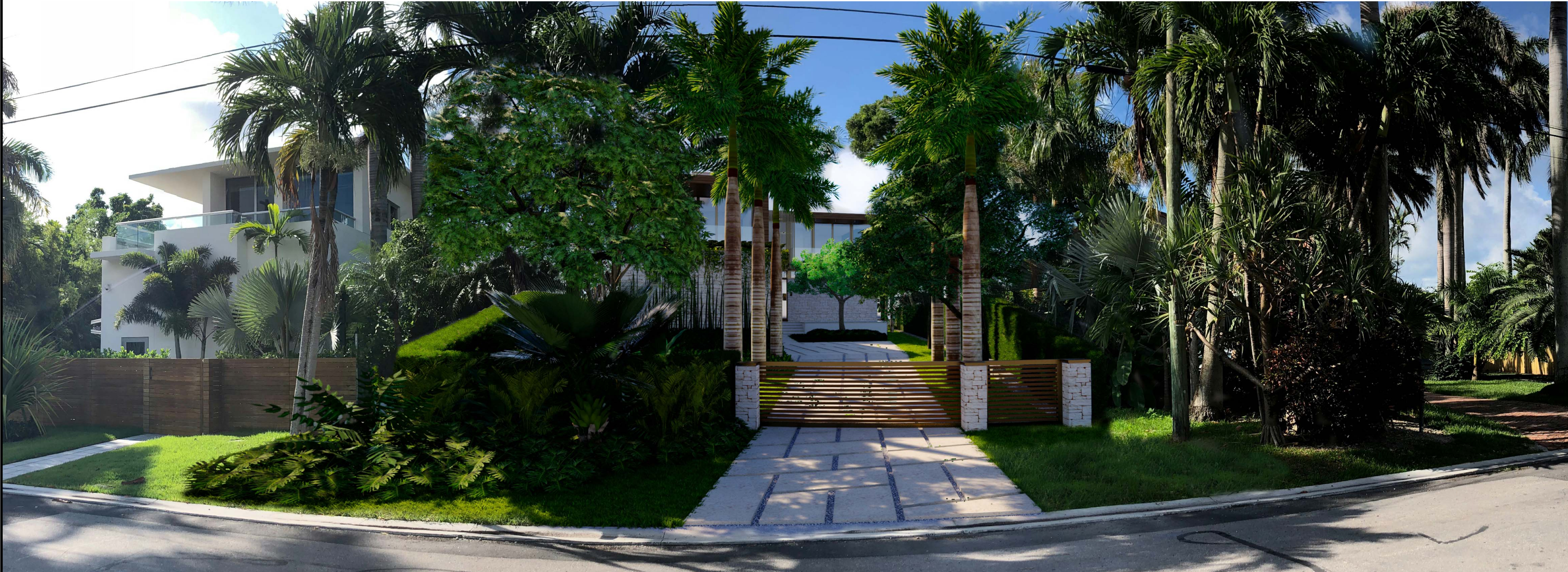
2 PROPOSED Scale: N.T.S.