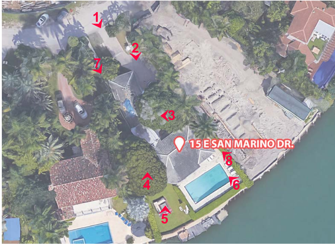
C LOT AERIAL Scale: N.T.S.