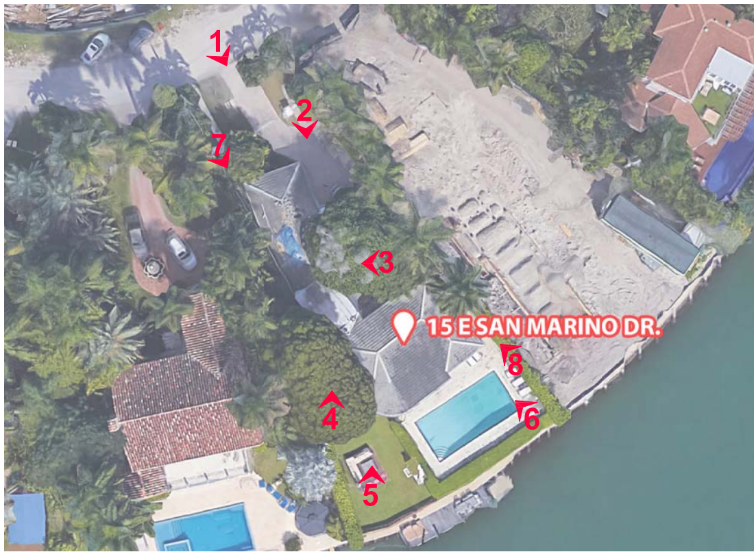
C LOT AERIAL Scale: N.T.S.