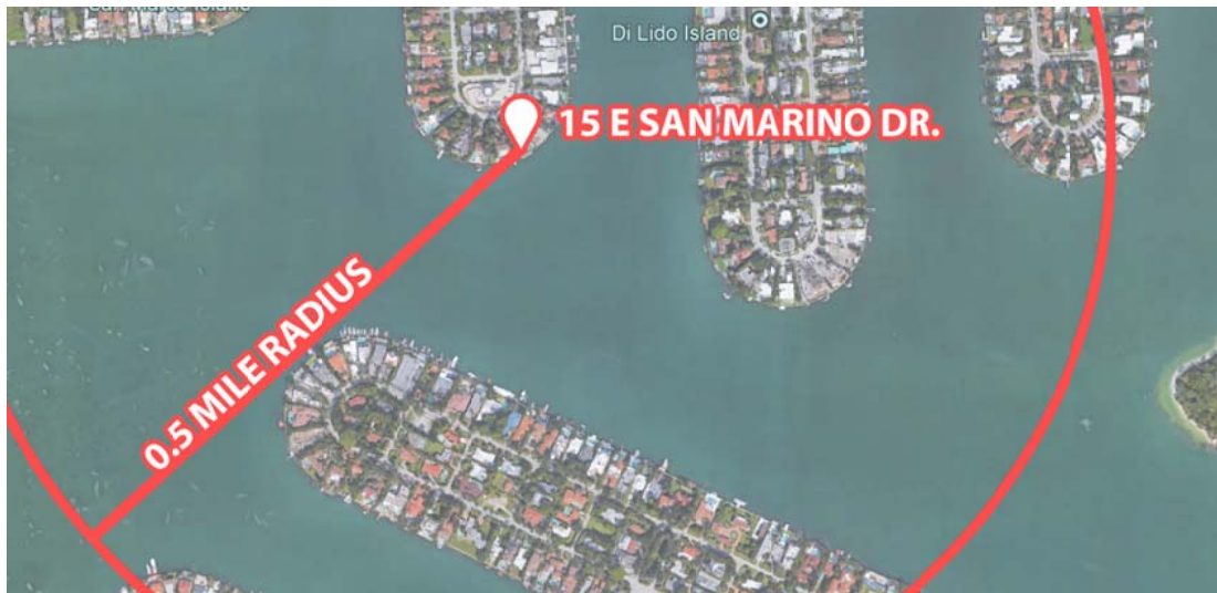
A MACRO CONTEXT Scale: N.T.S.