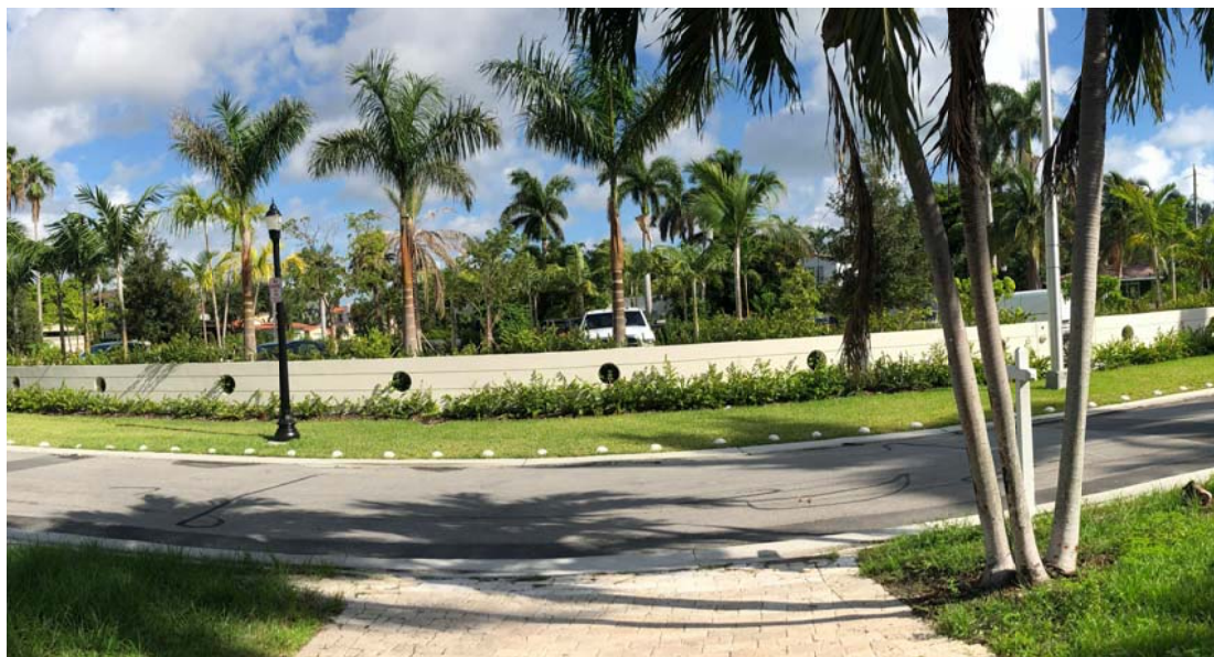
5 NORTH LOT (PARKING) Scale: N.T.S.