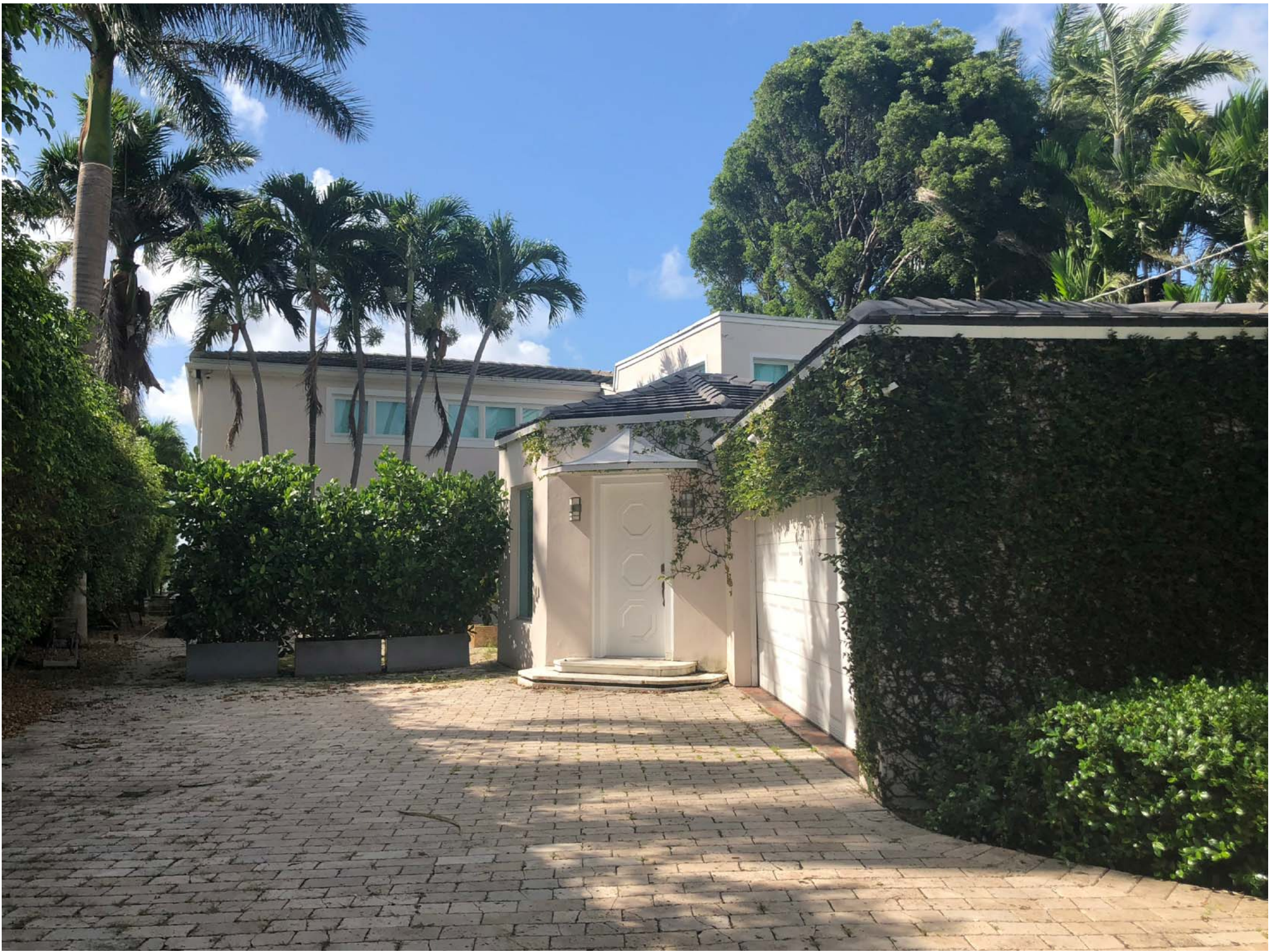
2 EXISTING HOUSE Scale: N.T.S.