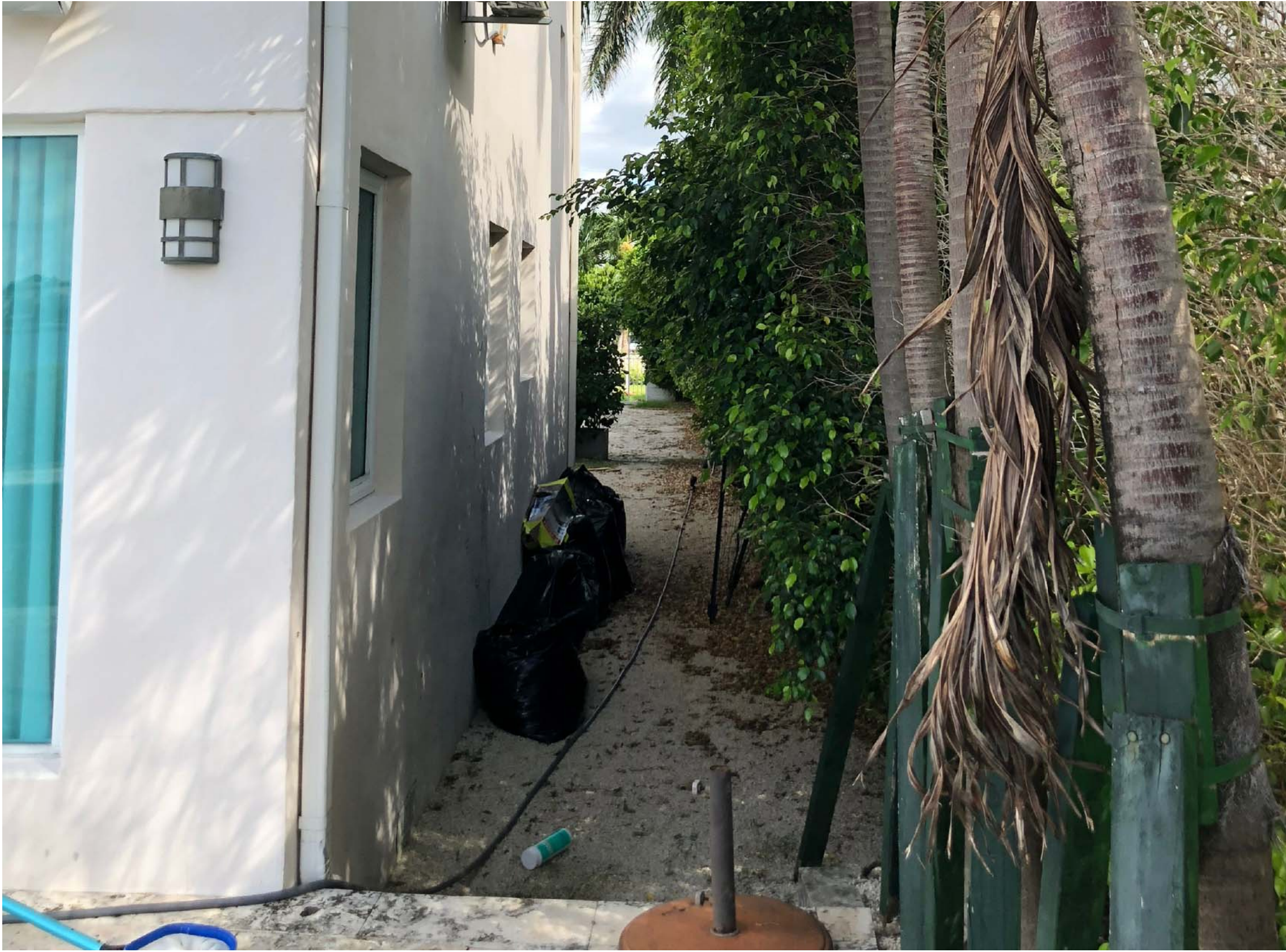
8 EXISTING HOUSE Scale: N.T.S.