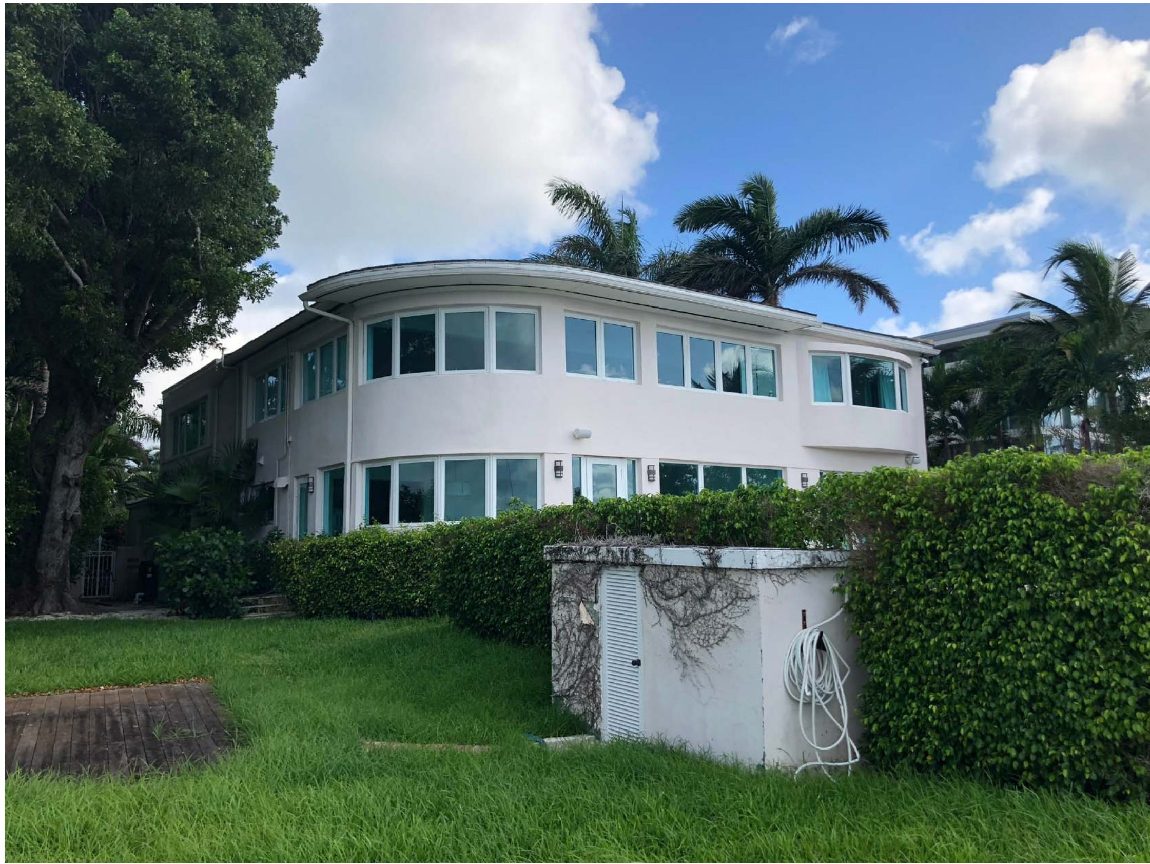
5 EXISTING HOUSE Scale: N.T.S.