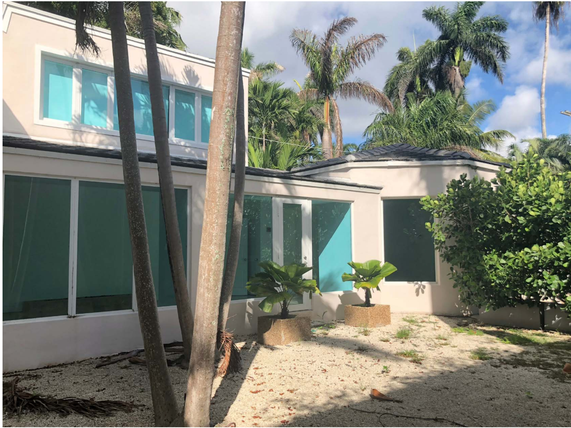
3 EXISTING HOUSE Scale: N.T.S.