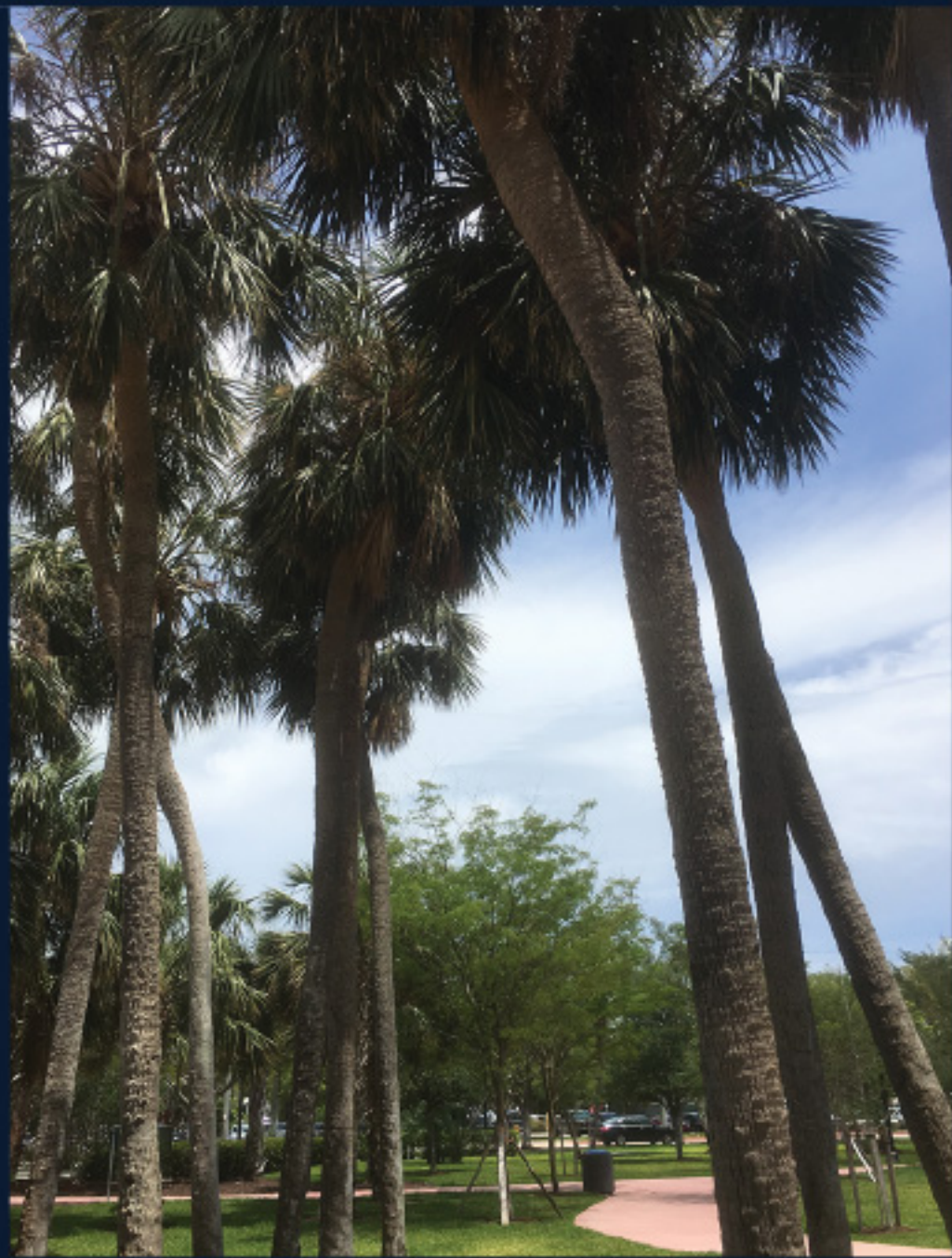
Venetian Islands: Belle Isle Park