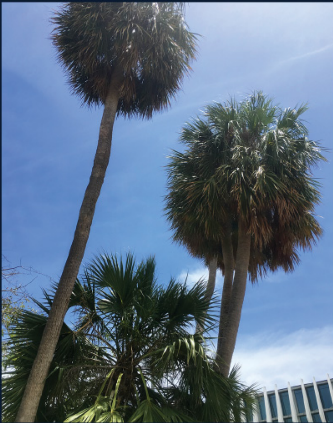
City Center: Botanical Garden

The photos below show recommended tree spots from 6 of the 12 parks where the birdhouse habitats can be installed.