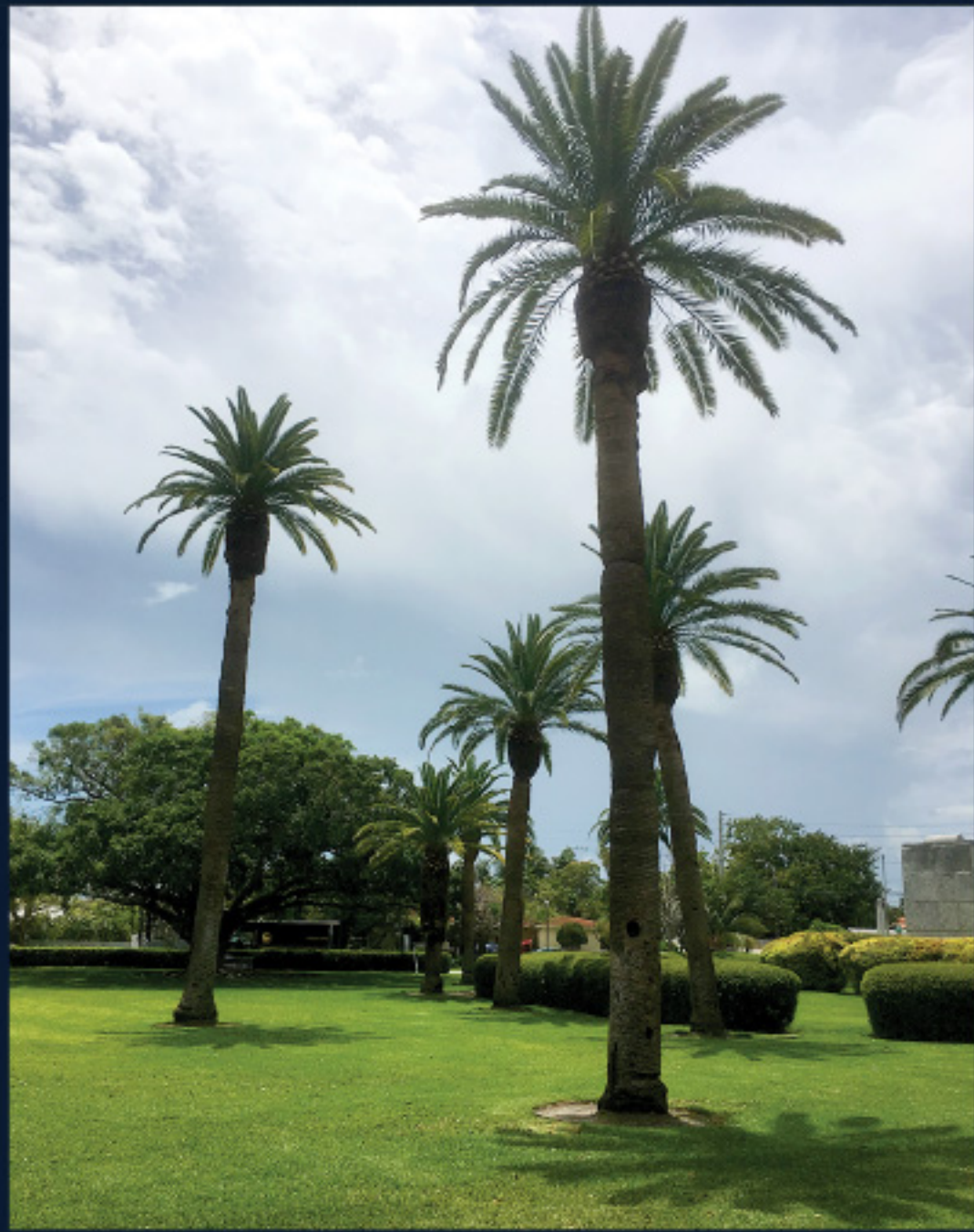
La Gorce: Fisher Park