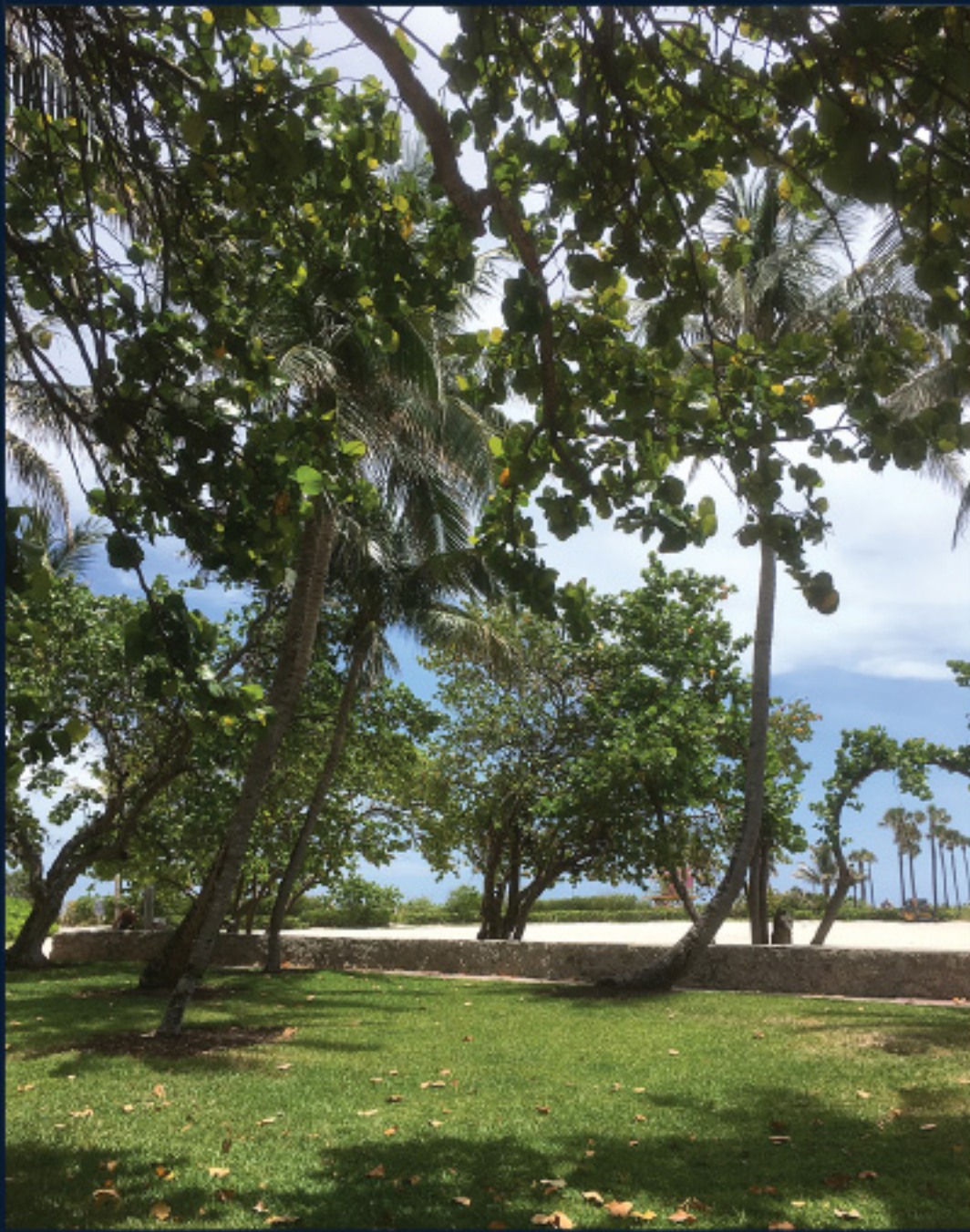
Ocean Front: Indian Beach Park