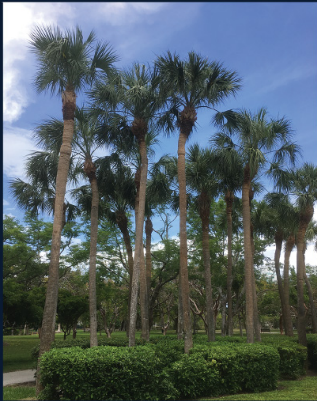
Nautilus: Pinetree Park