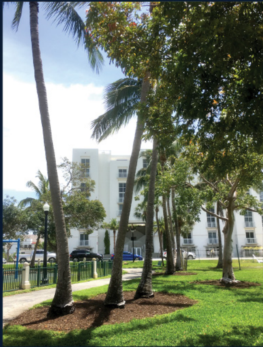
Bayshore: Gibb Memorial Park