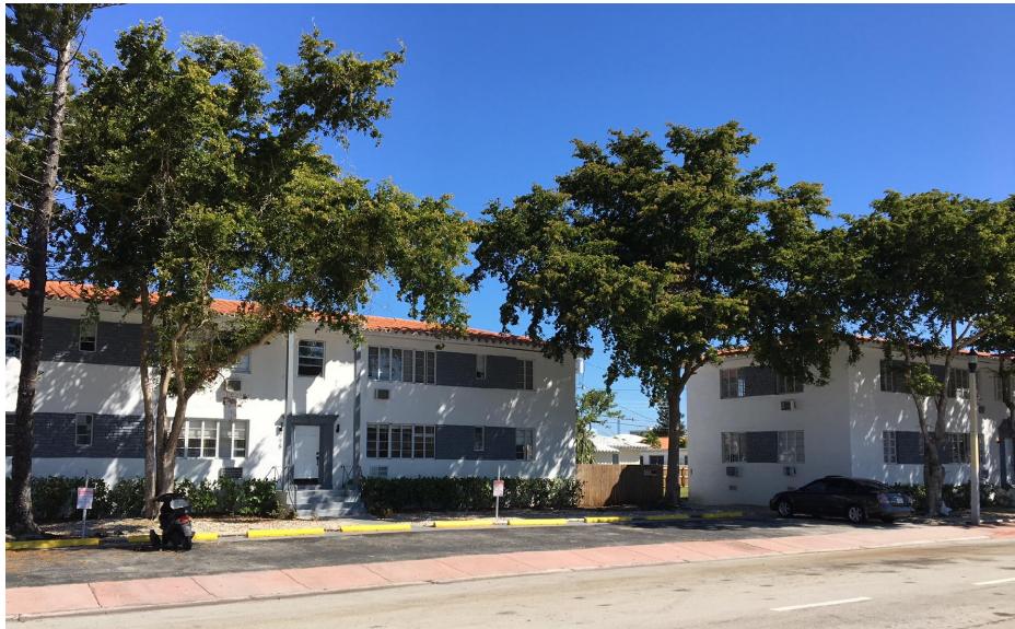
APARTMENT BUILDINGS ACROSS THE STREET