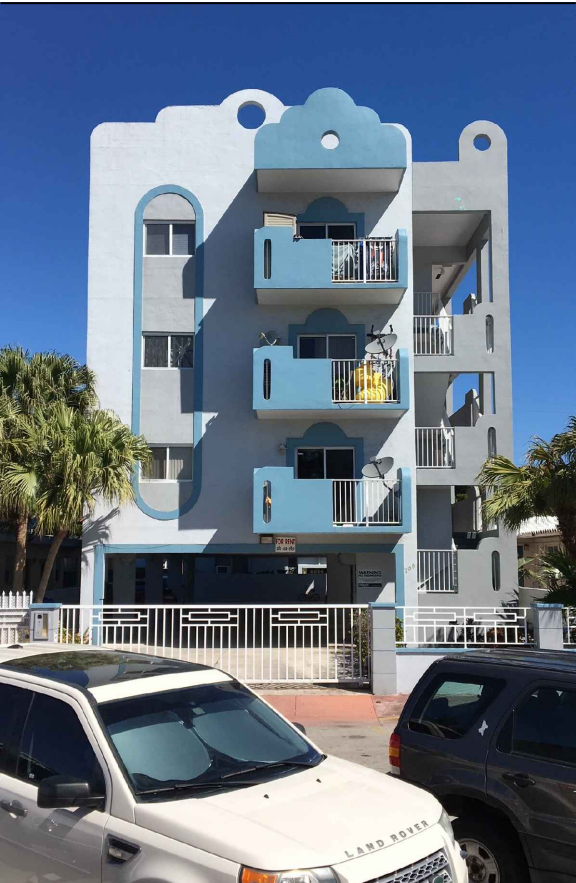
NEIGHBORHOOD MIDRISE APARTMENT BUILDING PRECEDENT