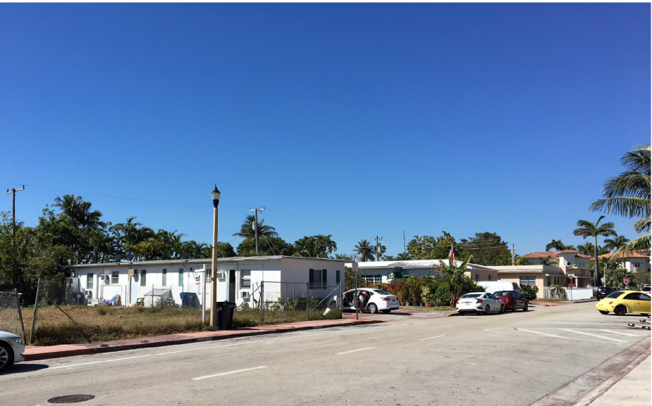
ADJACENT PROPERTIES TO THE WEST