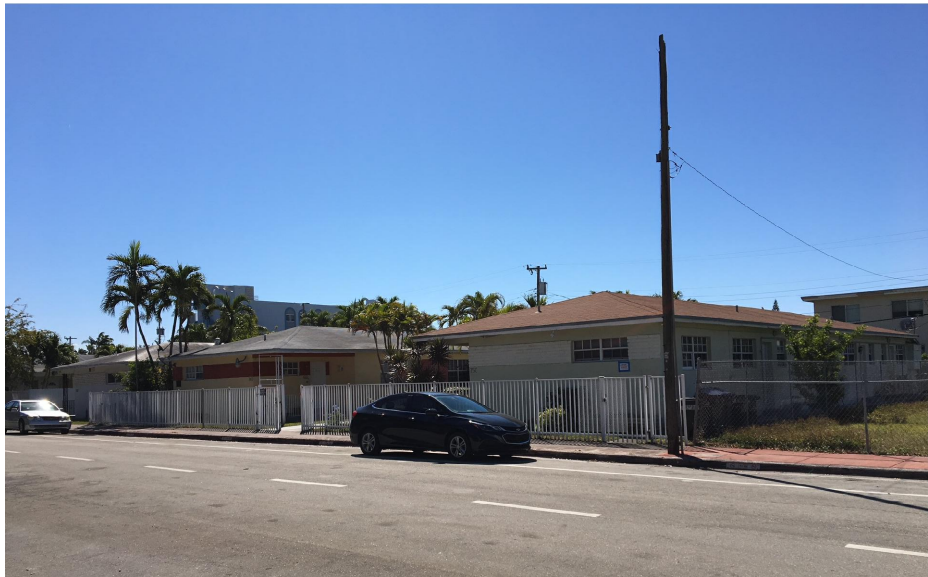
ADJACENT PROPERTIES TO THE EAST