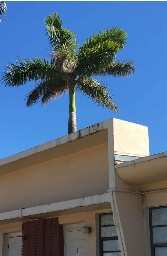
NEIGHBORHOOD CONTRIBUTING BUILDING FACADE DETAIL