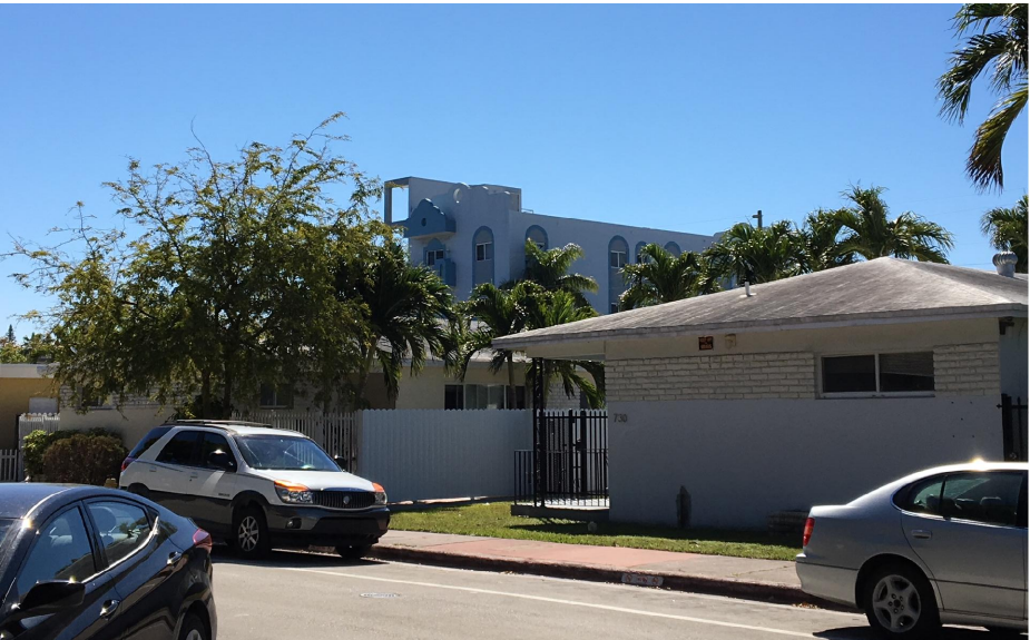
BUILDING TYPE MIX