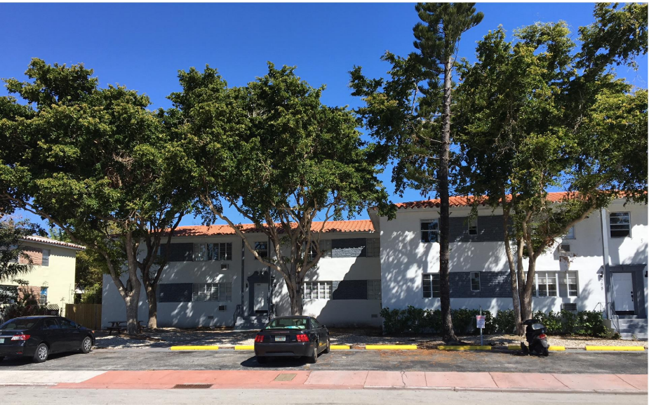
APARTMENT BUILDINGS ACROSS THE STREET