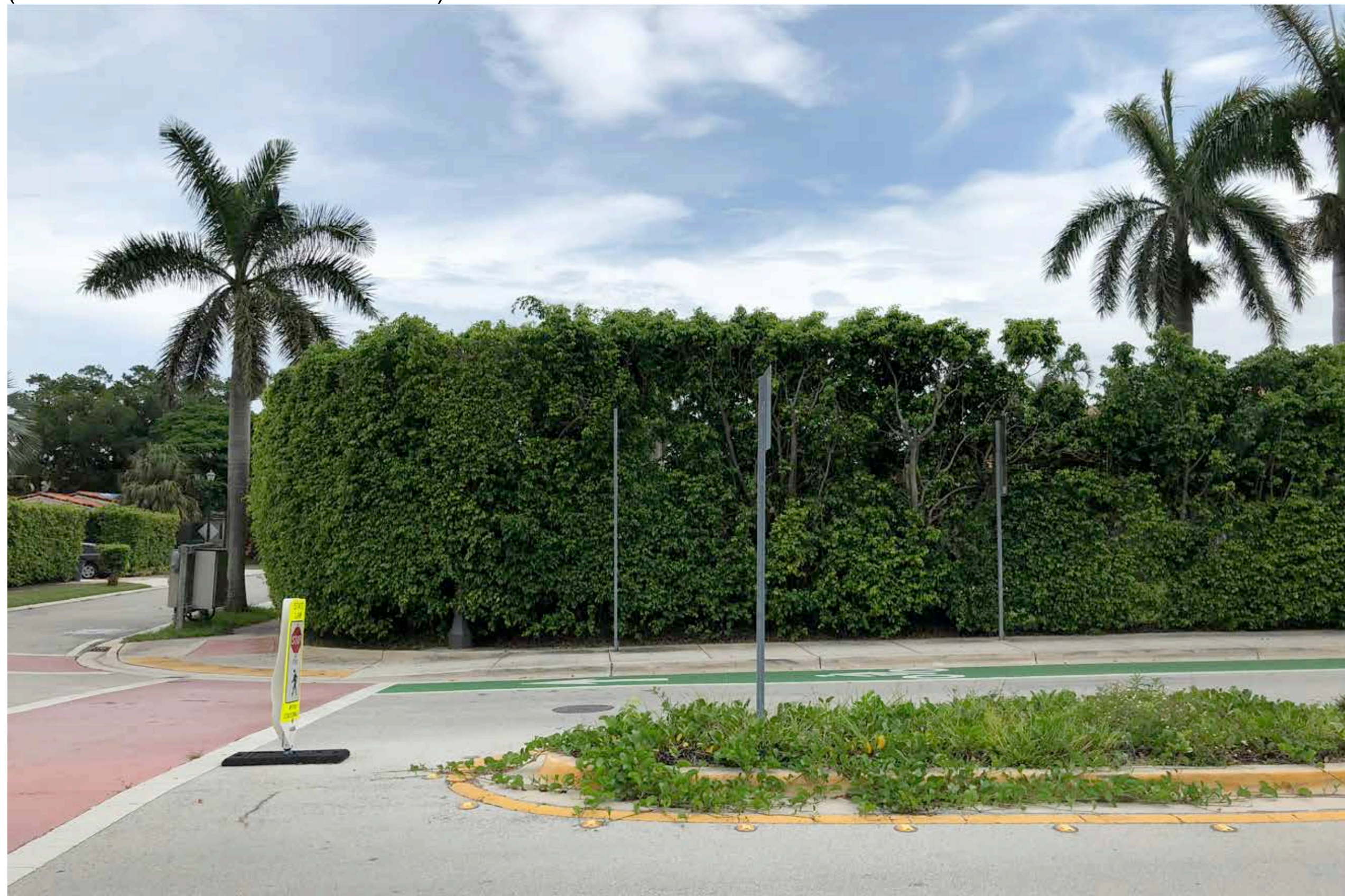
07 226 W RIVO ALTO DR (LOOKING SOUTH)