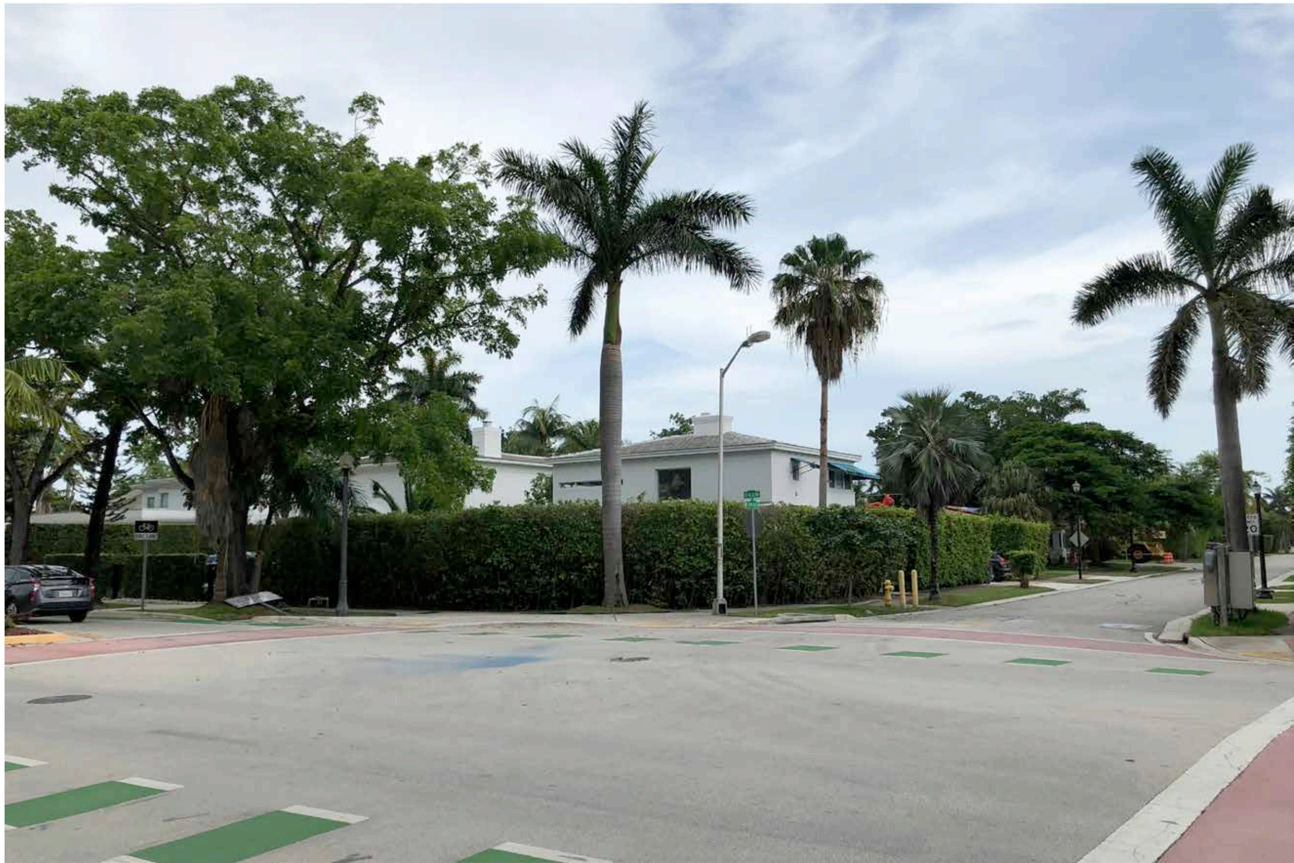
06 225 W RIVO ALTO DR (LOOKING SOUTHEAST)