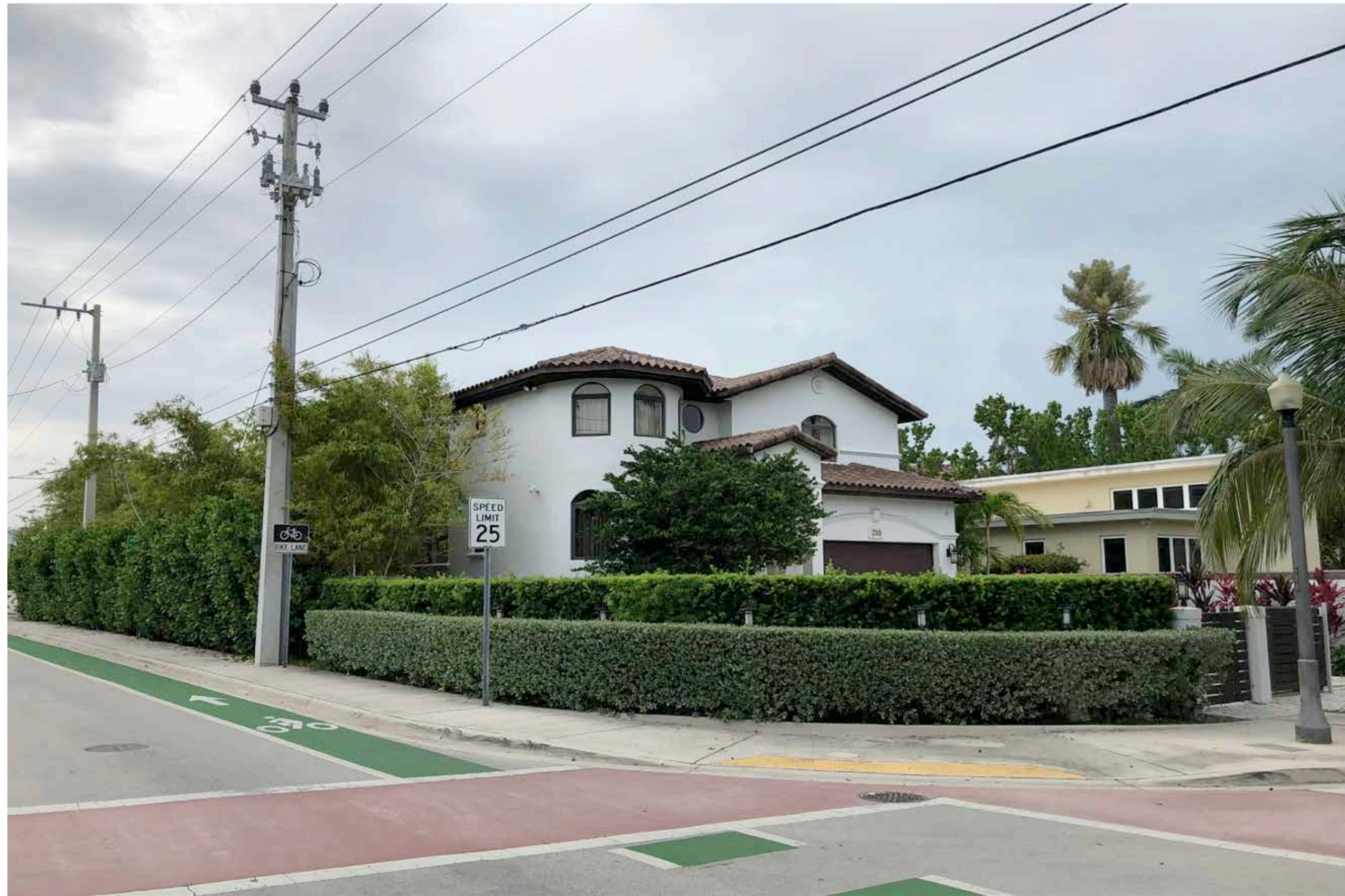
05 230 W RIVO ALTO DR (CORNER LOOKING NORTHWEST)