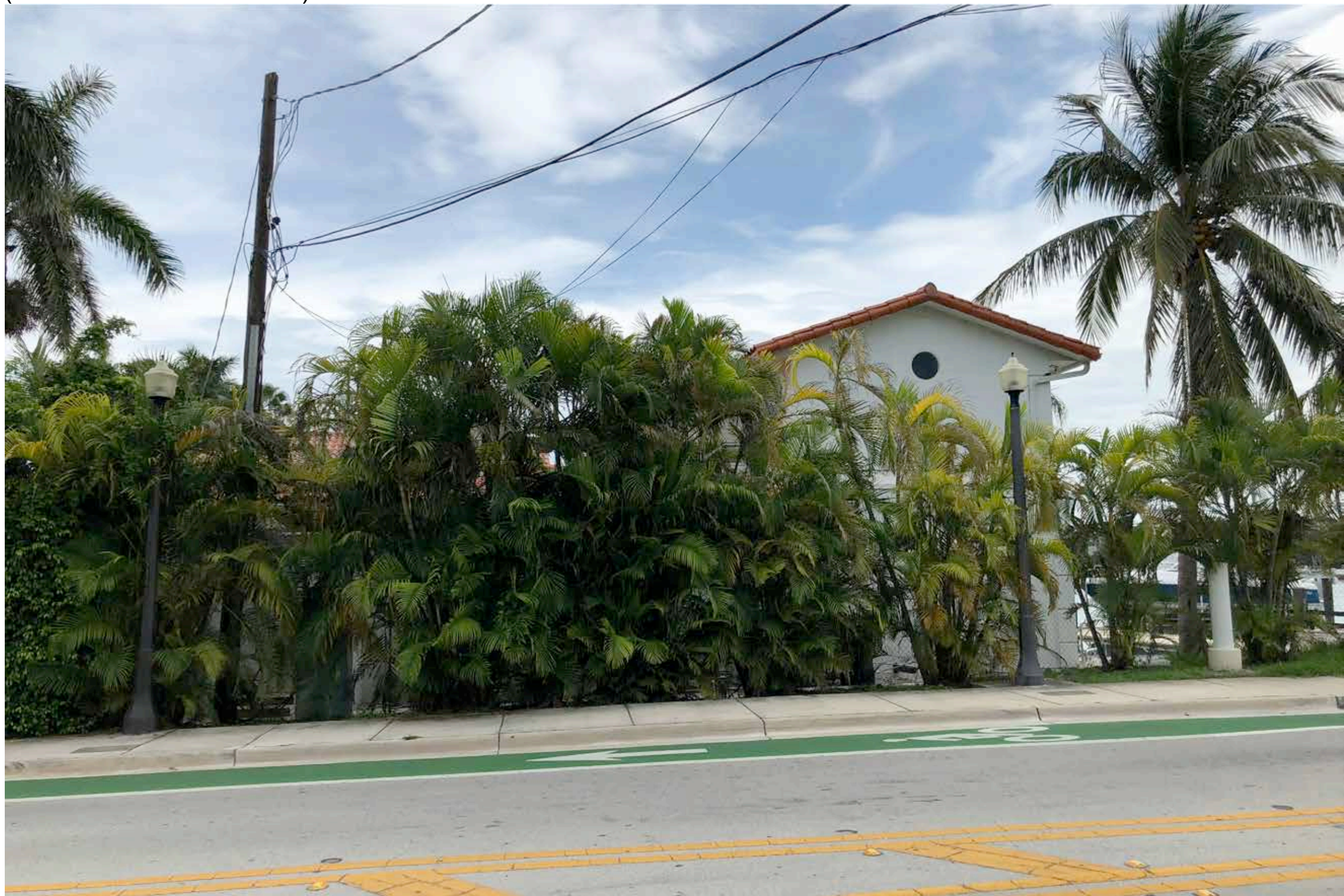
08 226 W RIVO ALTO DR (LOOKING SOUTH)