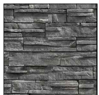
2 STONE VENEER