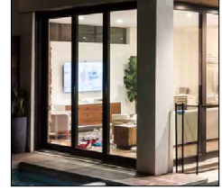
7 ALUMN DOOR AND WINDOW, IMPACT GL.