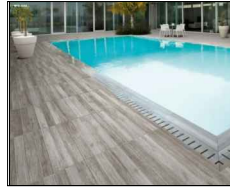
8 CERAMIC EXTERIOR FINISHED FLOORING