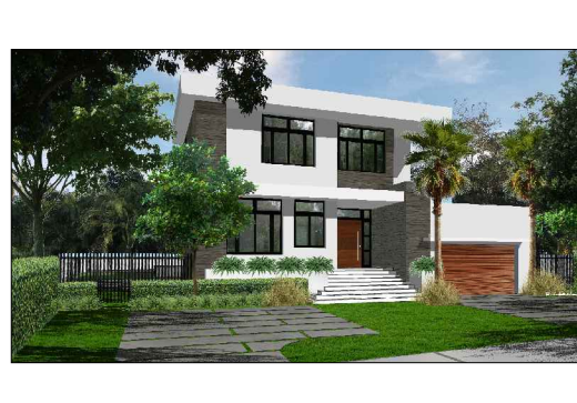
4465 ALTON RD.