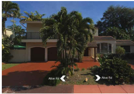
4475 ALTON RD.