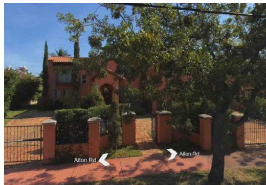
4451 ALTON RD.