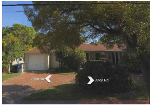
4455 ALTON RD.