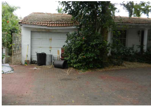
4465 ALTON RD.