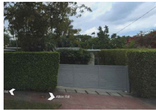
4456 ALTON RD.