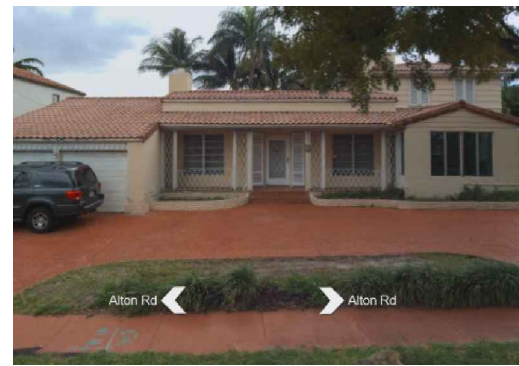
4450 ALTON RD.