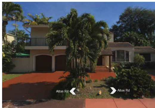
4475 ALTON RD.