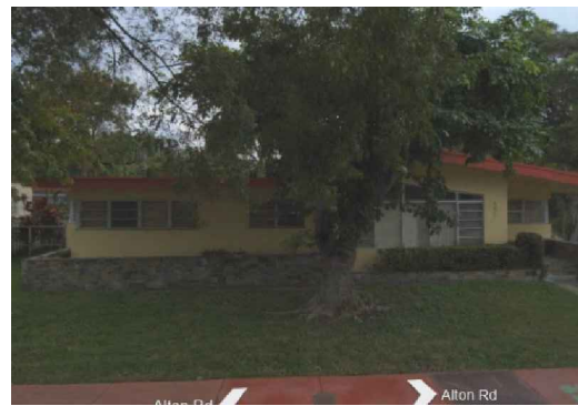
4470 ALTON RD.