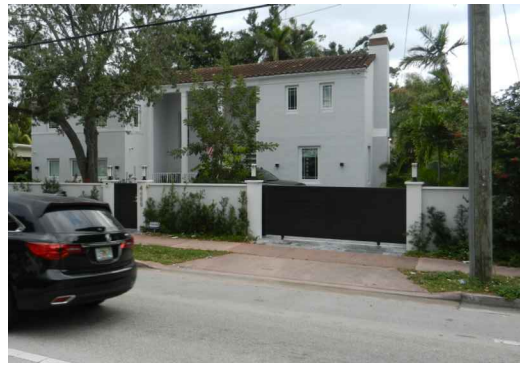
4469 ALTON RD.