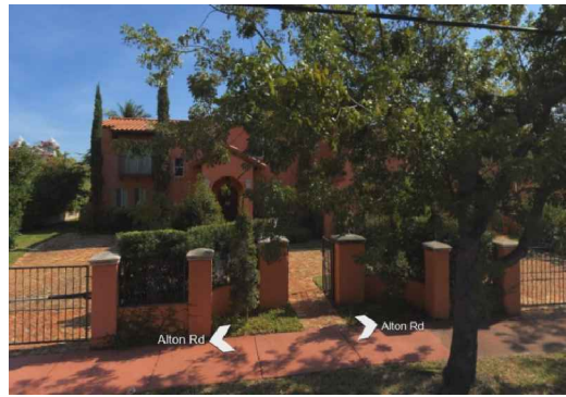
4451 ALTON RD.