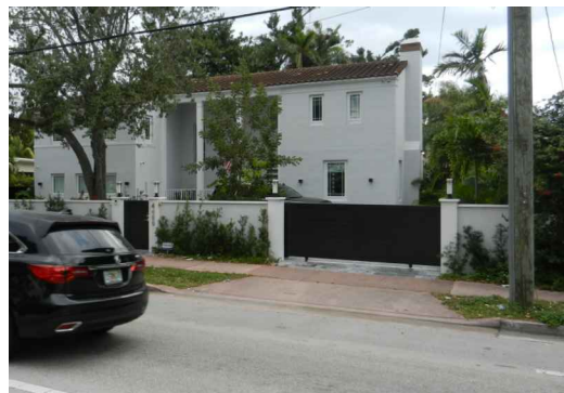
4469 ALTON RD.