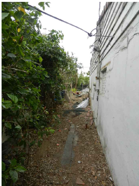
7 SIDE VIEW SCALE: NTS