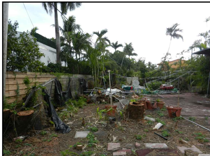
8 REAR VIEW SCALE: NTS