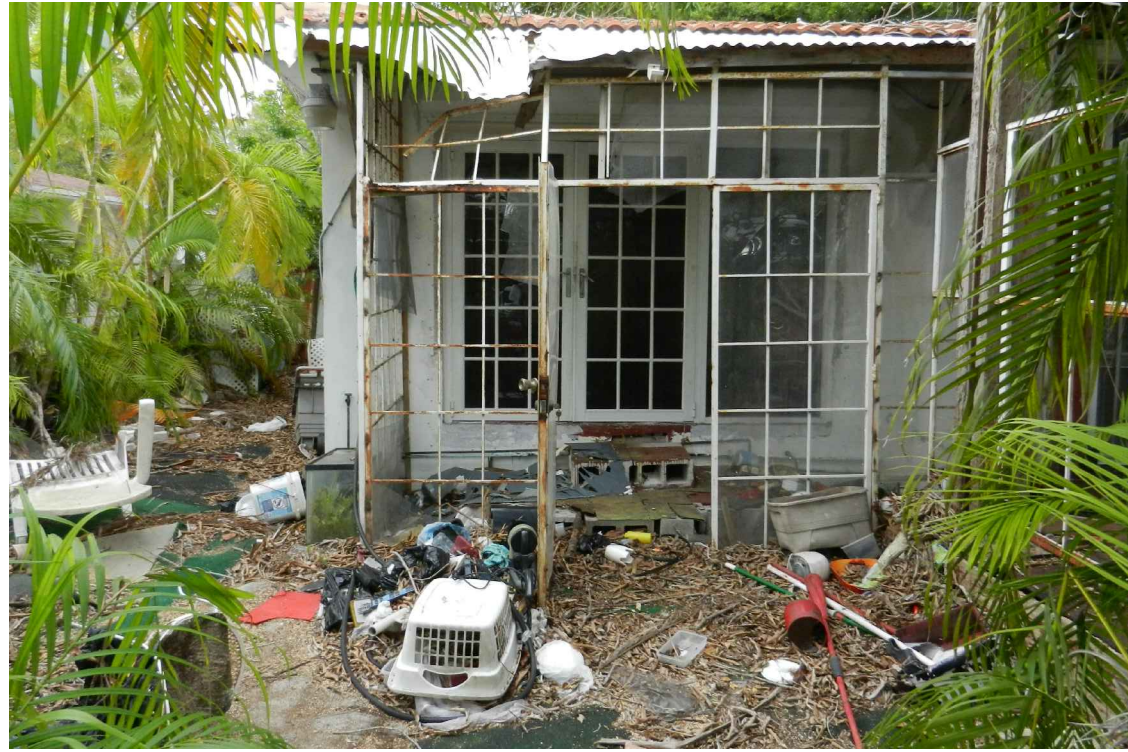
6 REAR VIEW SCALE: NTS