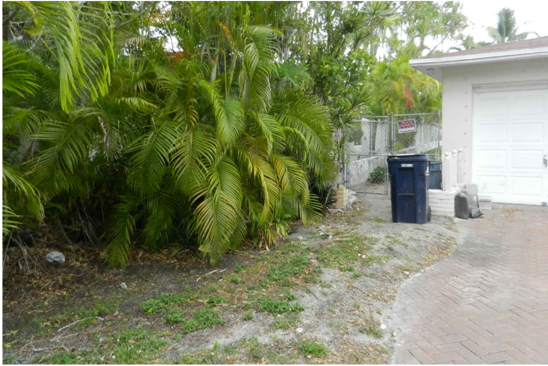
5 FRONT VIEW SCALE: NTS