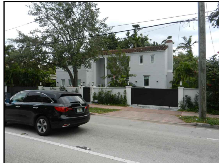
4 FRONT VIEW-HOUSE/NORTH SCALE: NTS