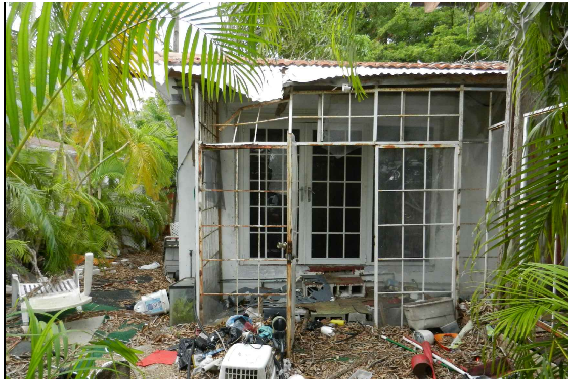
3 REAR VIEW SCALE: NTS