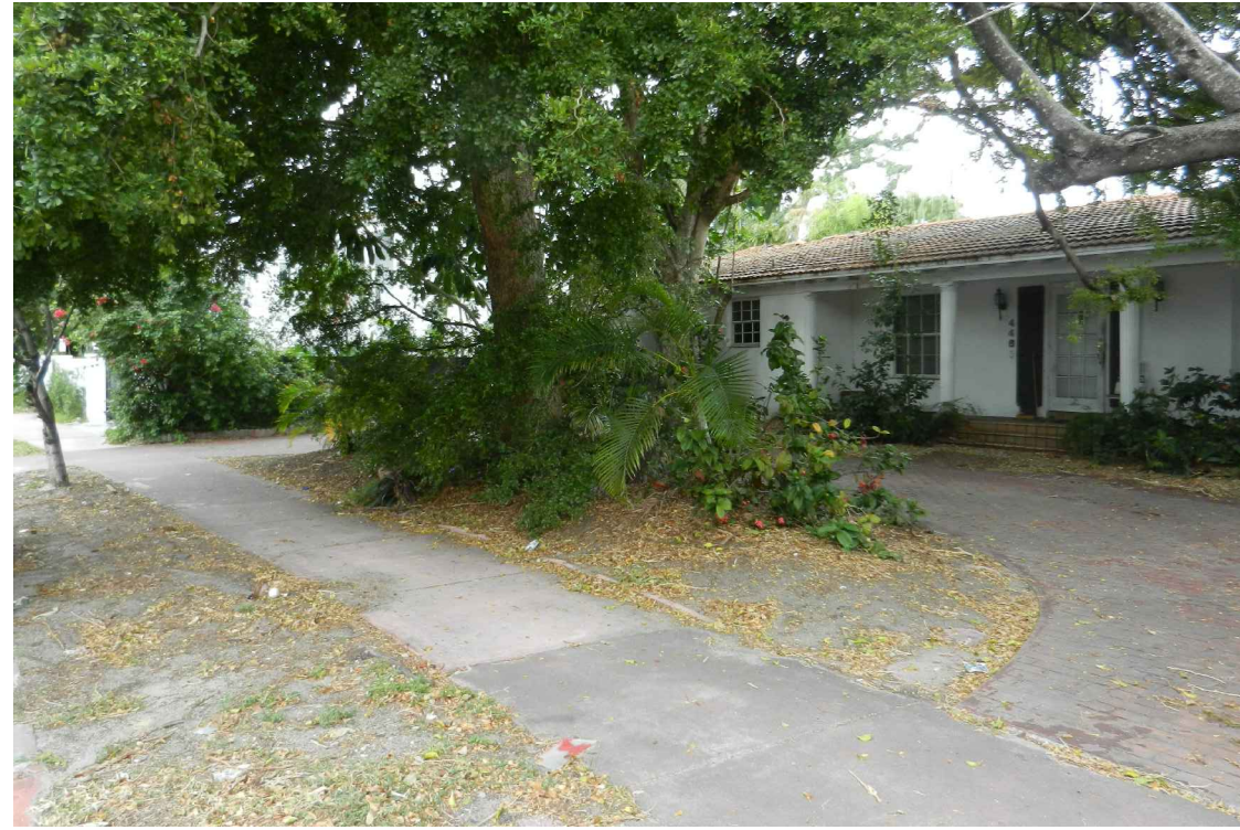
2 FRONT VIEW SCALE: NTS