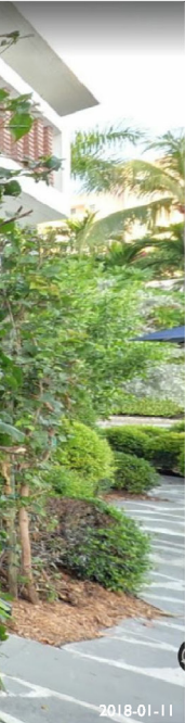
TO THE HOTEL ENTRANCE