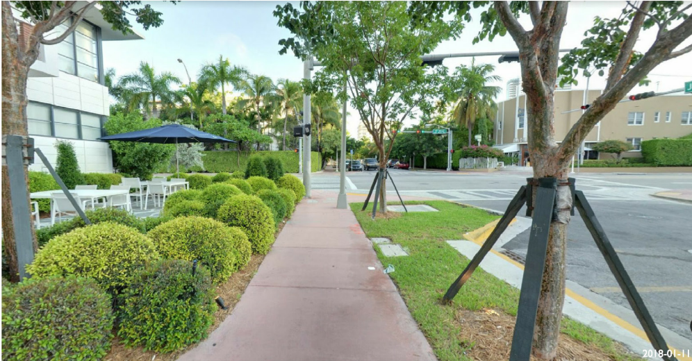
5. FRONT VIEW OF THE KASKADES HOTEL FROM JAMES AVENUE