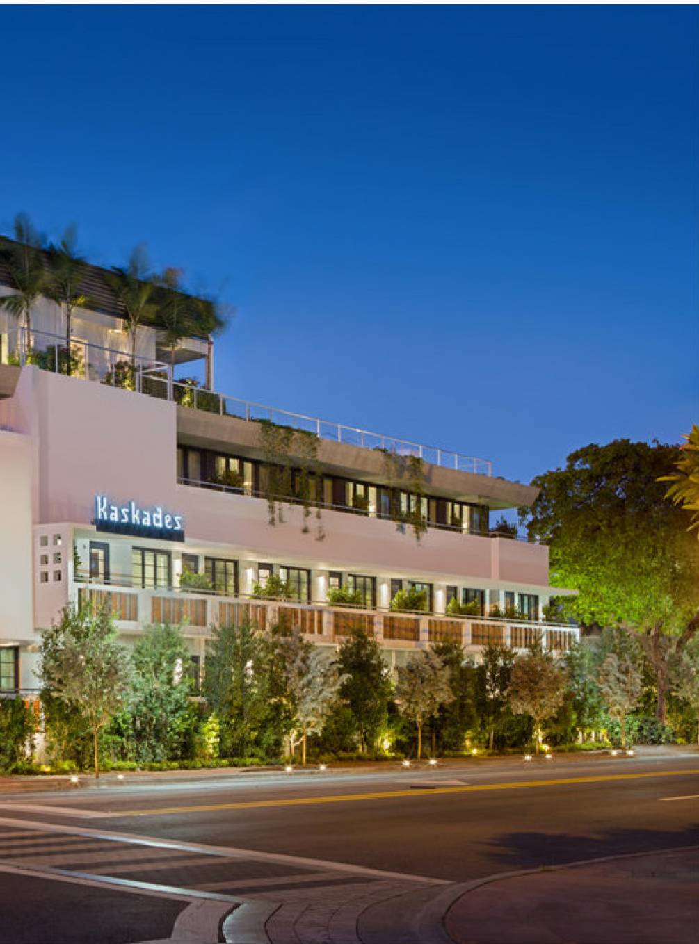
4. PHOTO OF THE EXISTING KASKADES HOTEL FROM INTERSECTION OF 17TH STREET AND JAMES AVENUE.