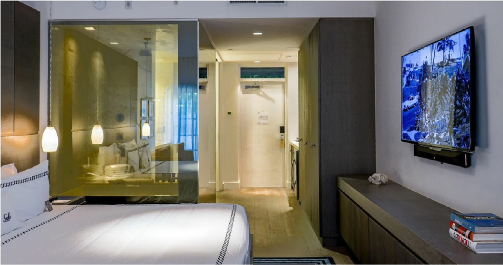
18. HOTEL UNIT ON SECOND LEVEL