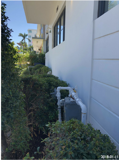
11. EQUIPMENT IN THE HOTEL'S FRONT YARD