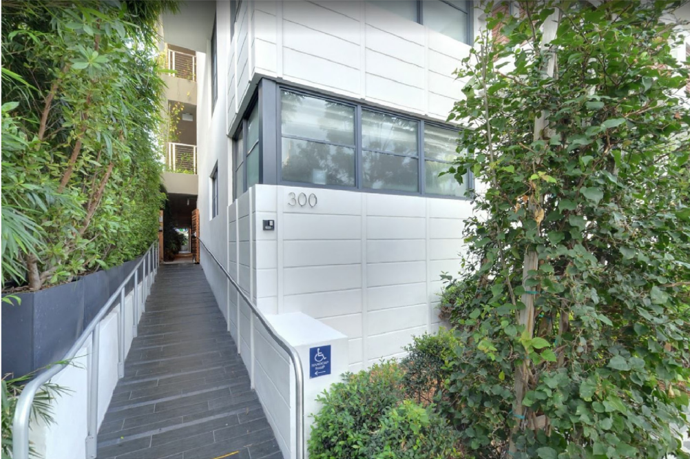
13. ADA RAMP LEADING TO