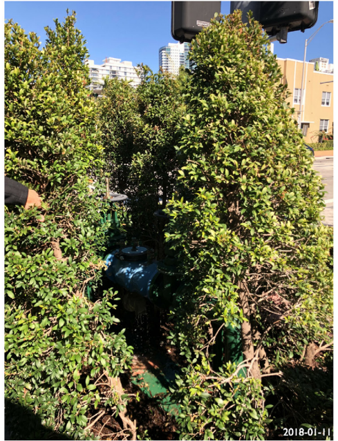
12. DOMESTIC BACKFLOW IN THE HOTEL'S FRONT YARD