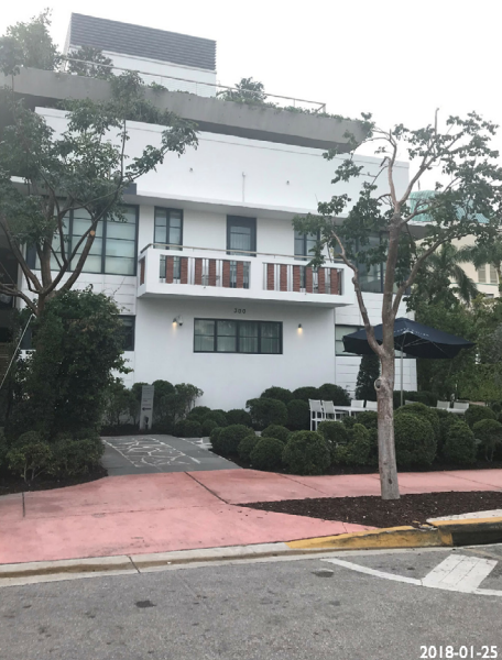
2. KASKADES HOTEL OUTDOOR AREA