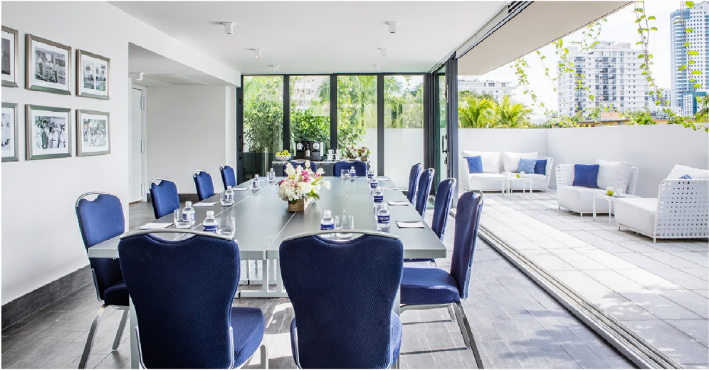
15. CONFERENCE ROOM ON THIRD FLOOR