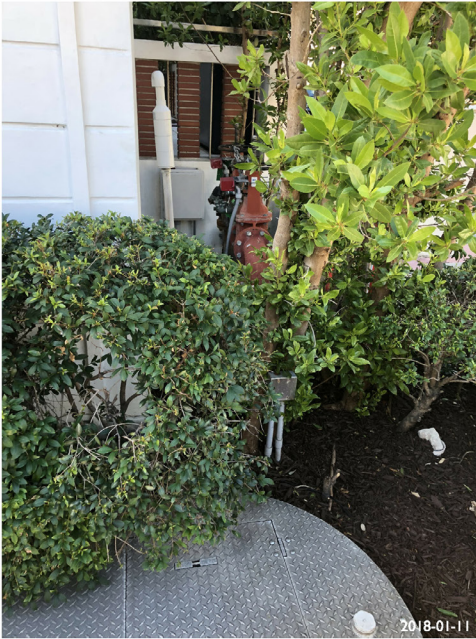
9. DRAIN WELL AND MANHOLE IN THE HOTEL'S FRONT YARD