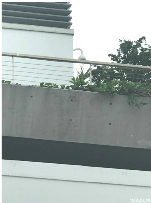
3. KASKADES HOTEL PARAPET DETAIL