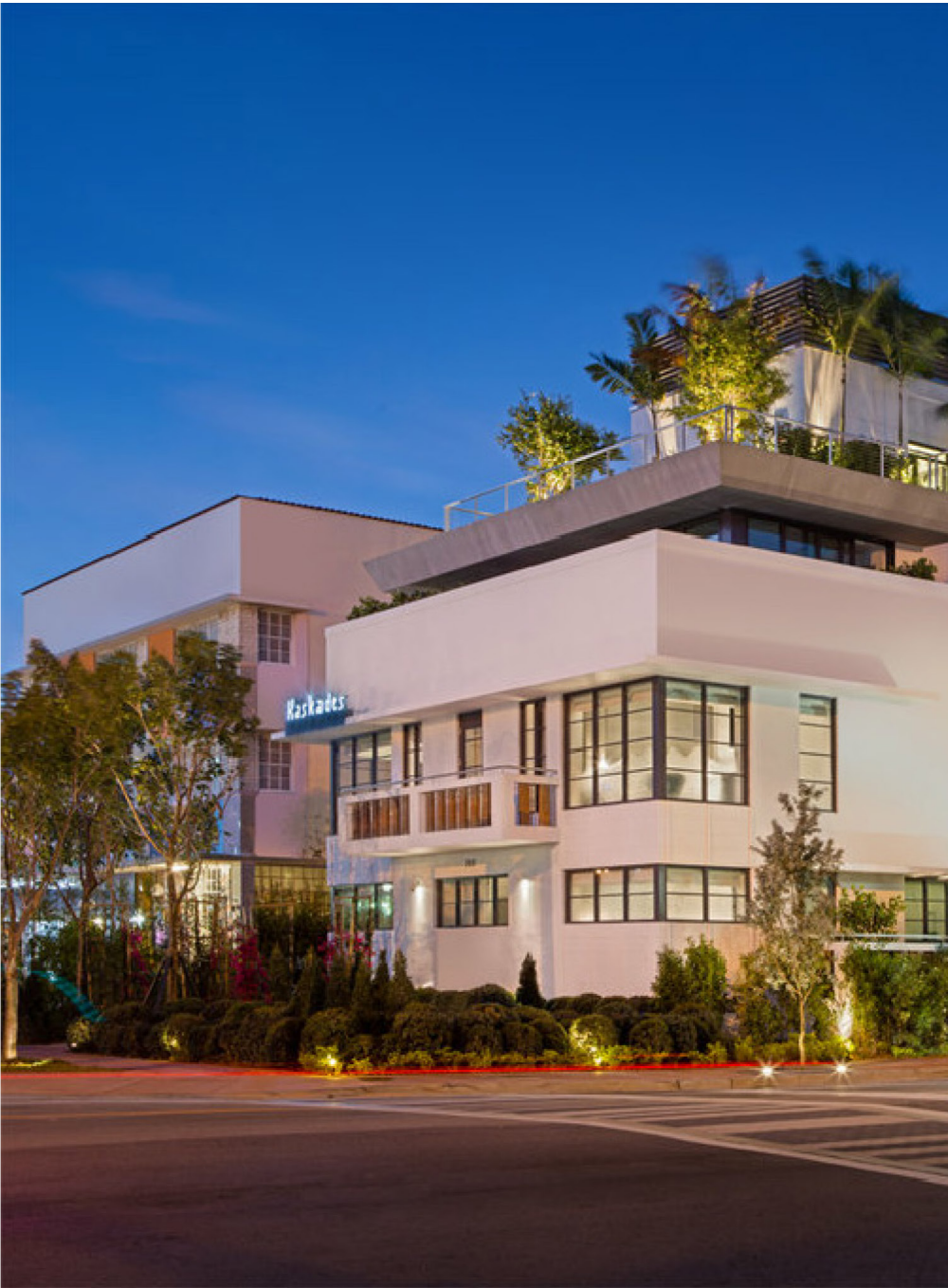
Urban Robot Associates (2014). Photo of the Kaskades Hotel. [image] Available at http://www.urbanrobot.net/gipfel/ln6lk4l1wio153iv5rqj9de8djsiye [Accessed 11 Jan. 2018].