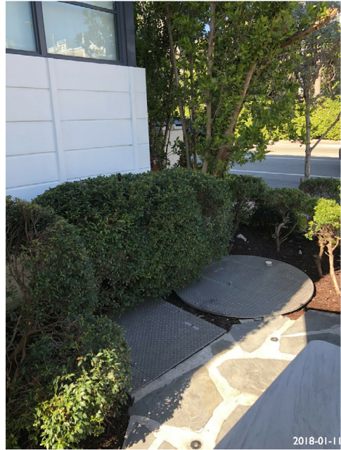
10. DRAIN WELL AND MANHOLE IN THE HOTEL'S FRONT YARD