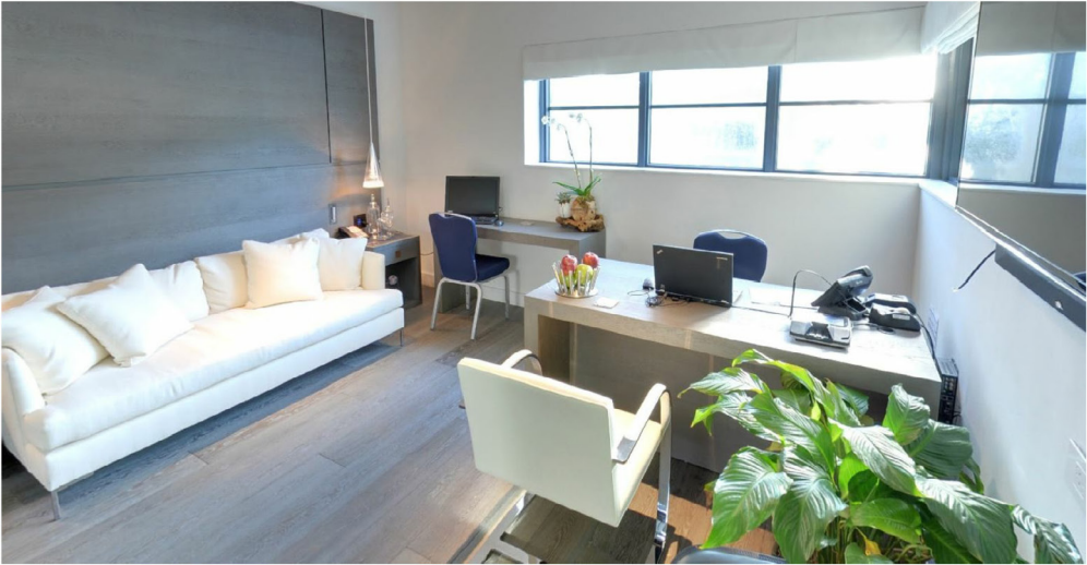
17. HOTEL OFFICE ON FIRST FLOOR