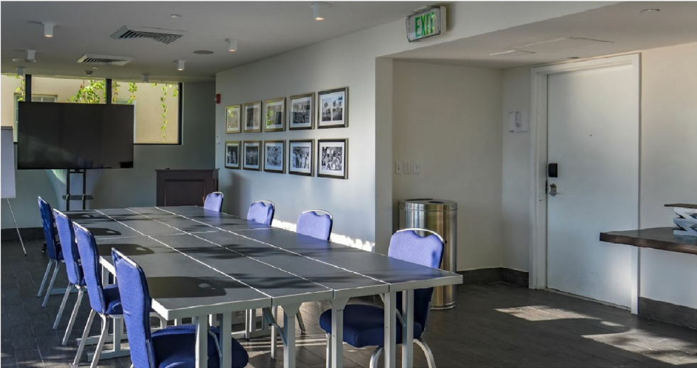
16. CONFERENCE ROOM ON THIRD FLOOR