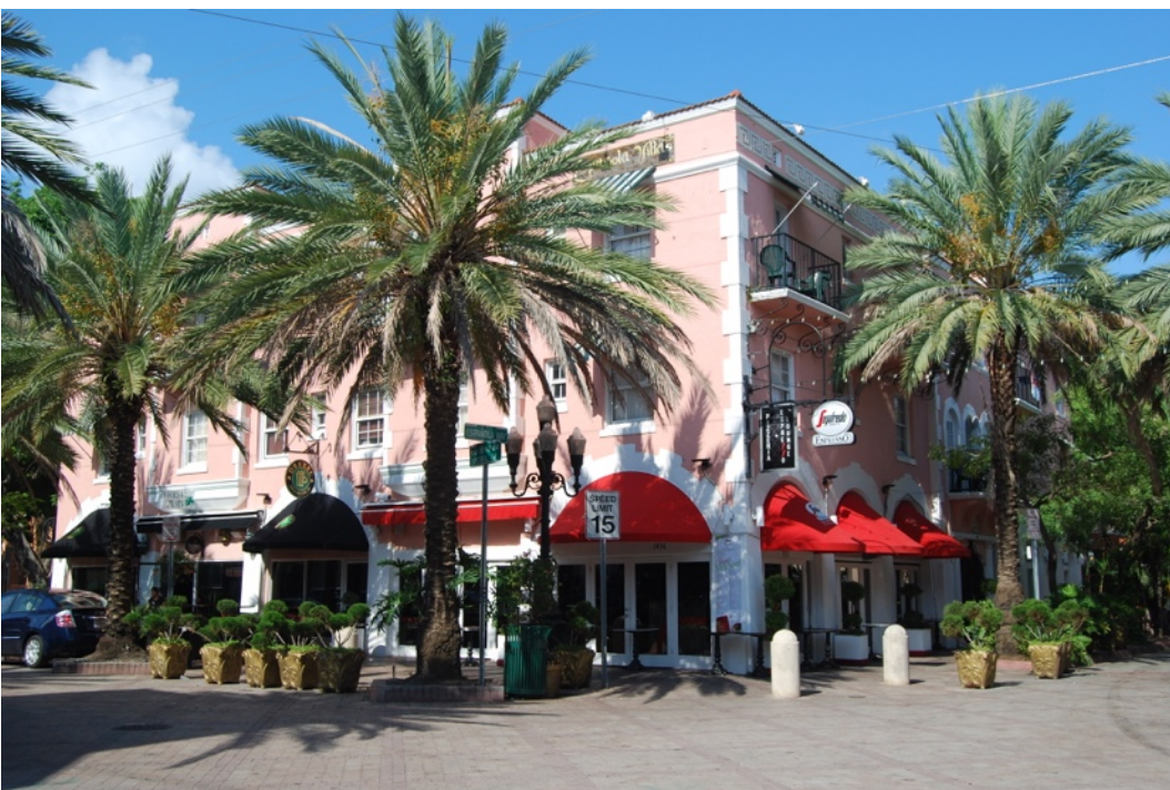
ESPANOLA WAY, THE MATANZAS HOTEL 2005 (8)