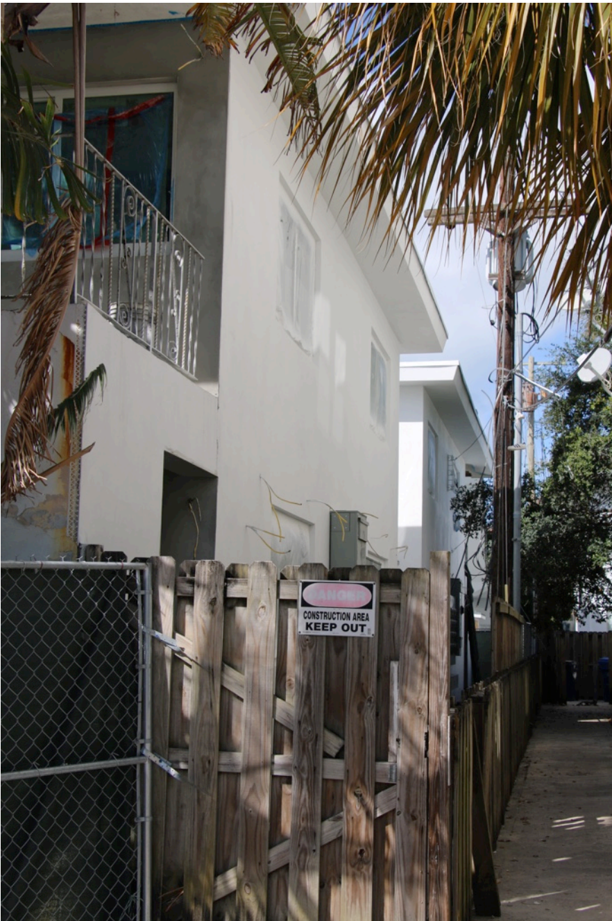
LEFT PHOTO: EAST ELEVATION, FEBRUARY, 2018 (8)