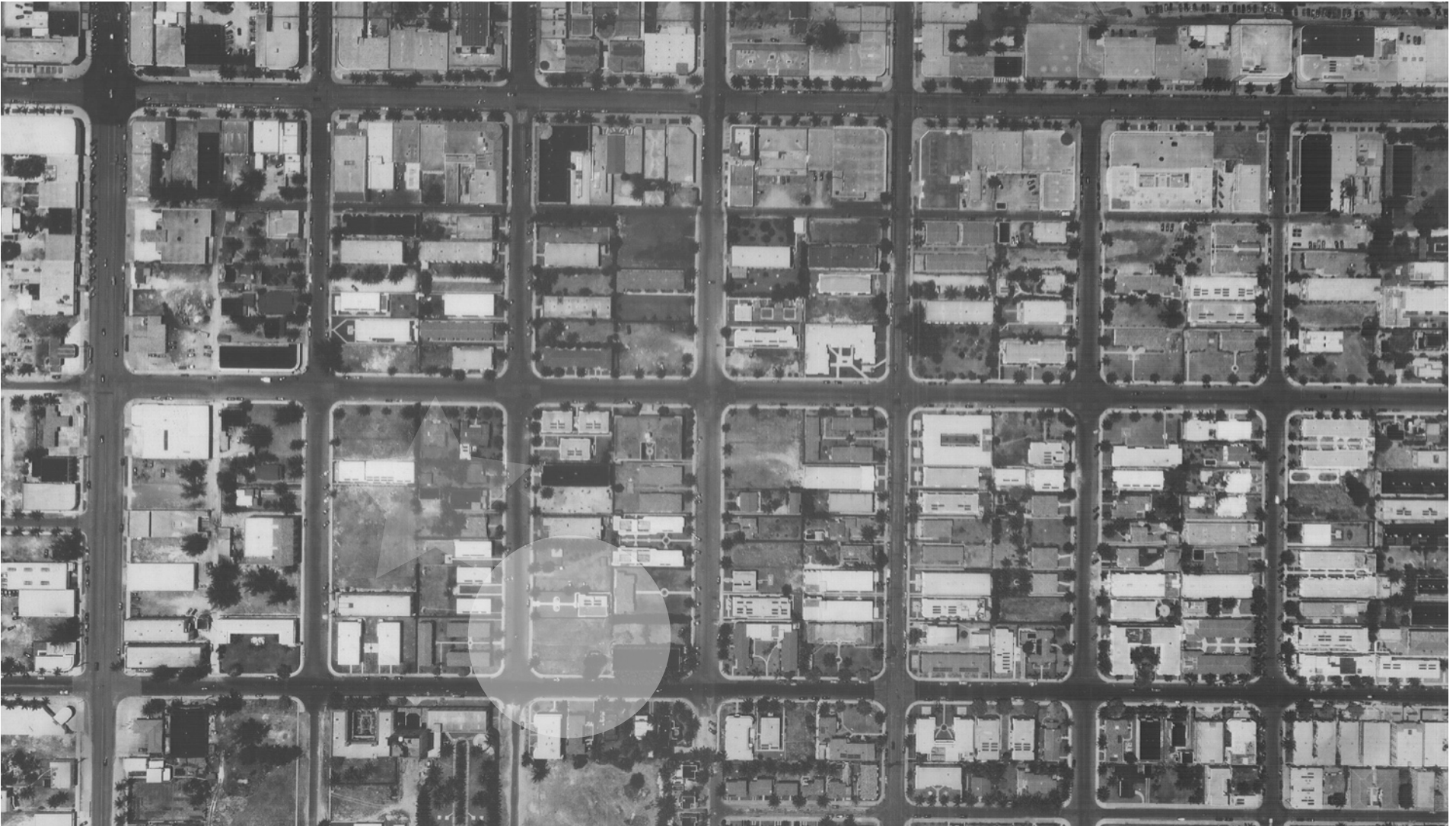
1941 AERIAL PHOTOGRAPH SHOWING UNDEVELOPED LAND AT THE FUTURE SITE OF 1501 MICHIGAN AVENUE (10)