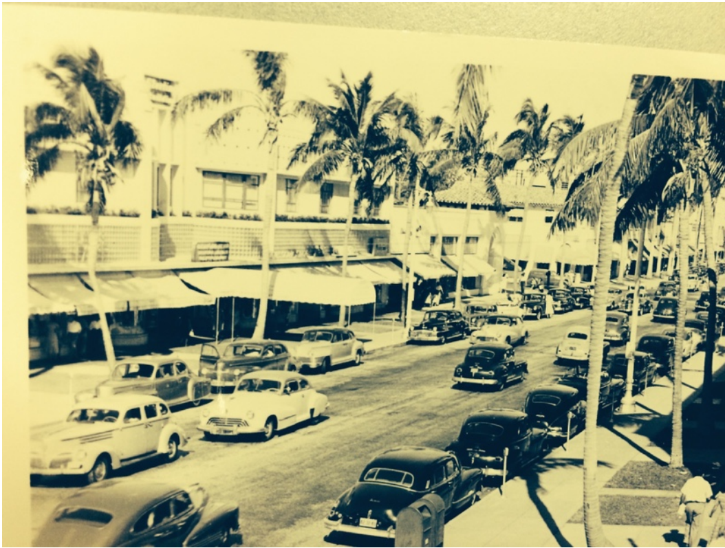
THIS CIRCA 1950 PHOTOGRAPH AT LEFT FEATURES LINCOLN ROAD AND THE STERLING BUILDING, LOCATED TWO BLOCKS NORTH OF 1501 MICHIGAN AVENUE COURTESY HISTORY MIAMI.