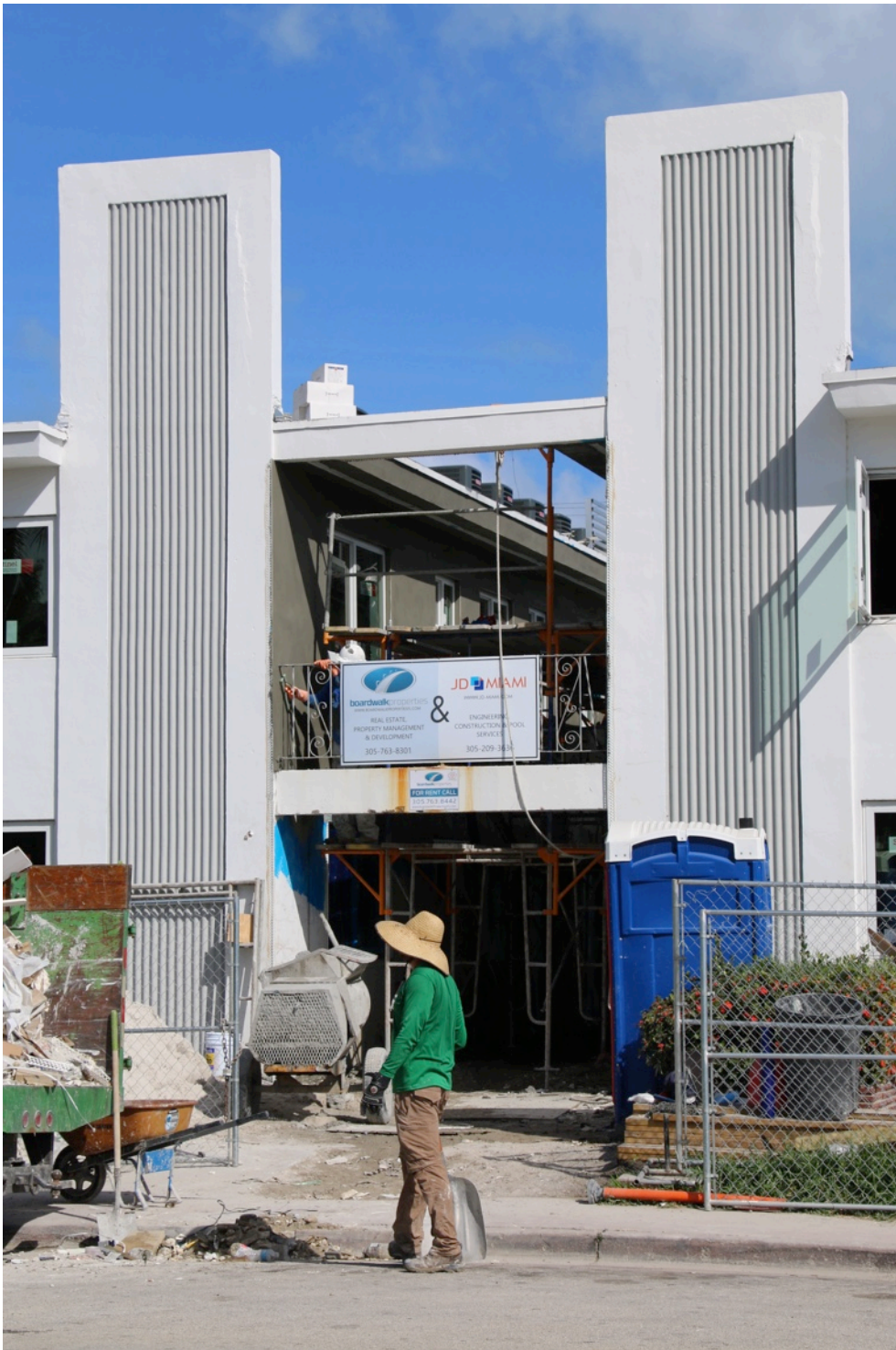
LEFT PHOTO: DETAIL AT MAIN ENTRANCE COURTYARD SHOWING VERTICAL FLUTING AT VERTICAL WALLS. FEBRUARY, 2018 (8) CONTEMPORARY PHOTOGRAPHS