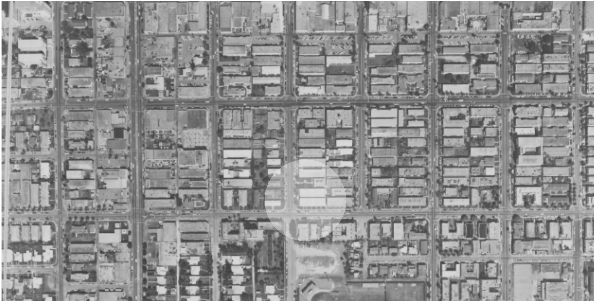
1969 AERIAL PHOTOGRAPH (10)