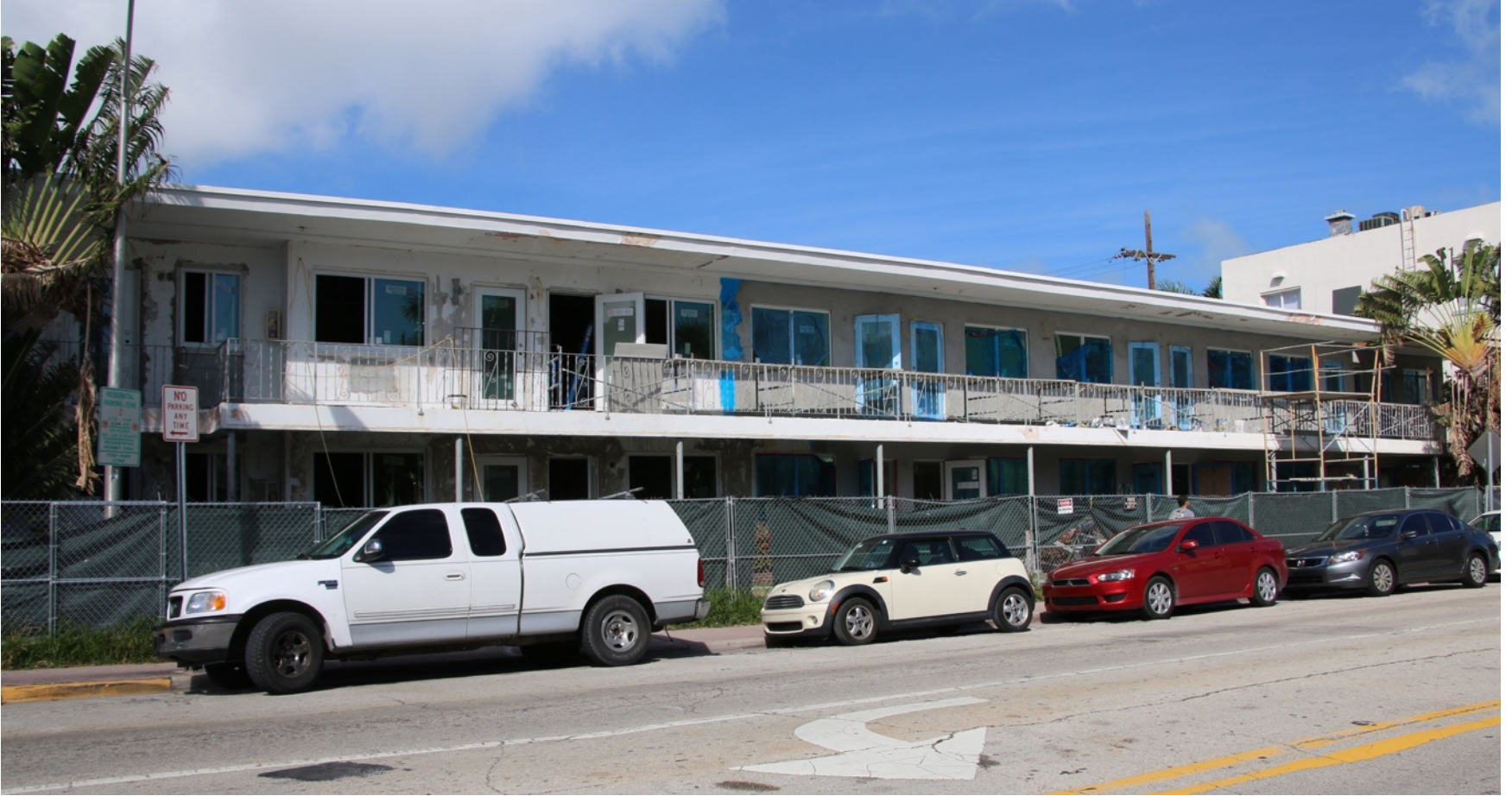
TOP PHOTO: SOUTH ELEVATION FACING 16th STREET, FEBRUARY, 2018 (8)