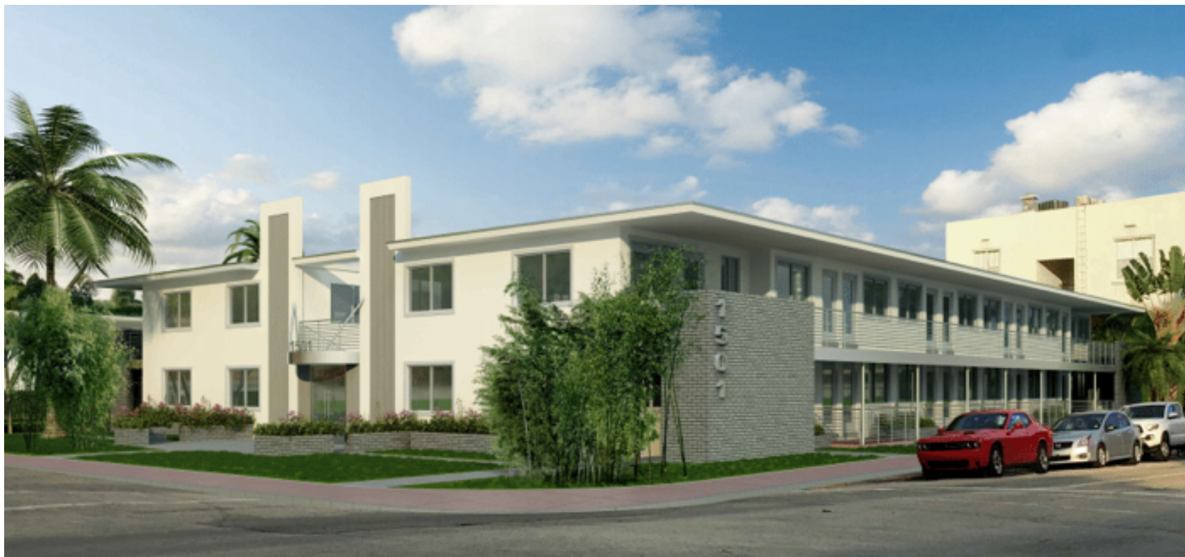
RENDERING OF PROPOSED DESGNS COURTESY OF BERENBLUM BUSCH ARCHITECTS