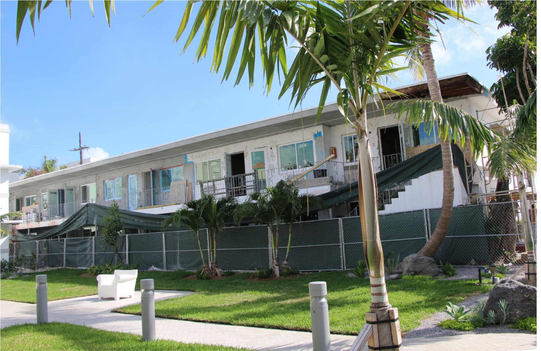
NORTH ELEVATION OF 1501 MICHIGAN AVENUE OVERLOOKING NEIGHBORING FRONT YARD. FEBRUARY, 2018 (8)