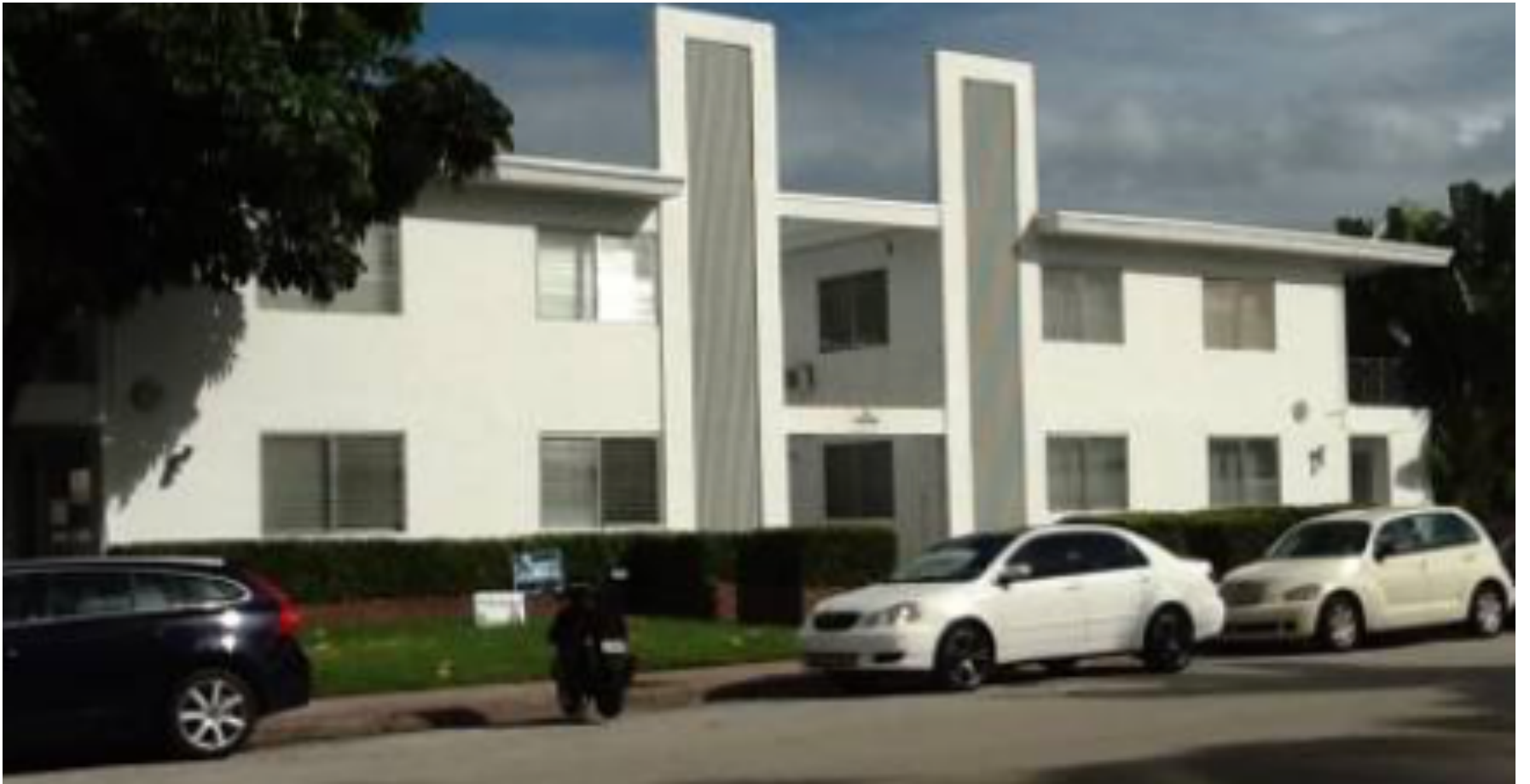
CIRCA 2010