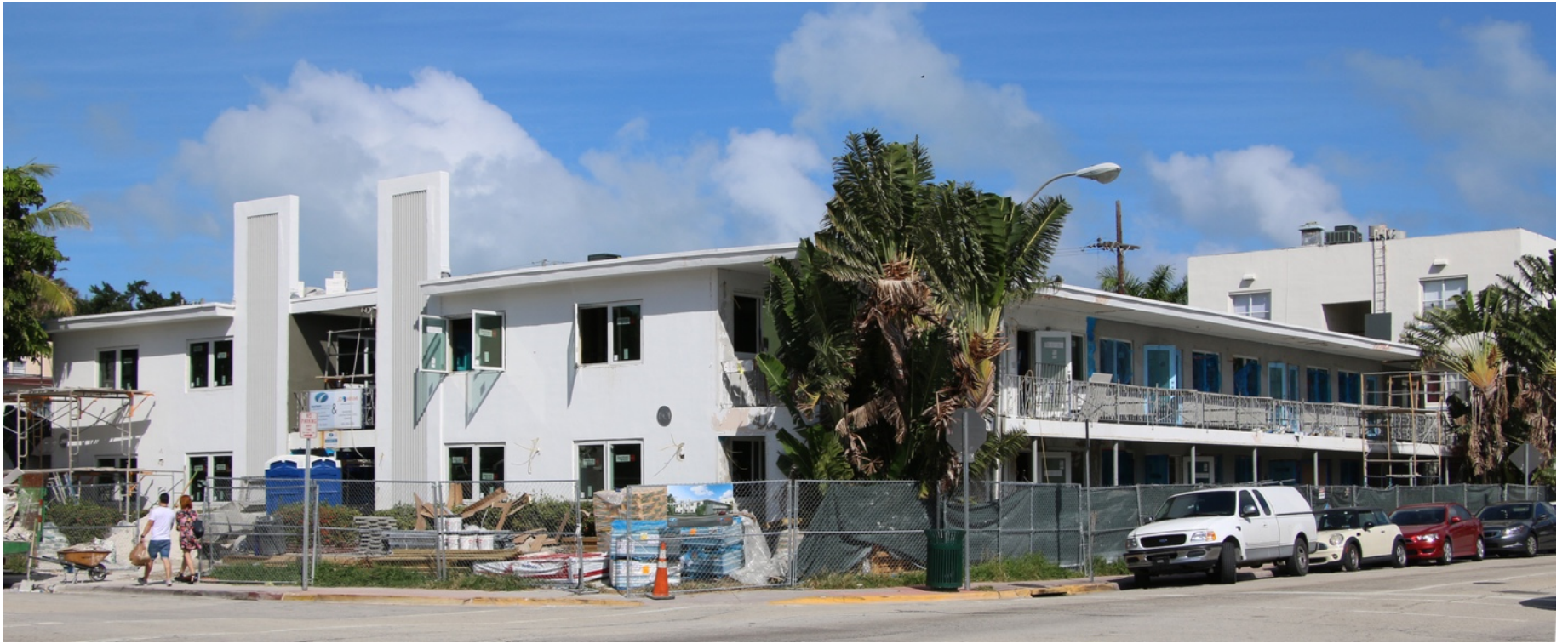
TOP PHOTO: VIEW OF SOUTH (@RIGHT) AND WESTERN (FRONT) ELEVATIONS OF 1501 MICHIGAN AVENUE FEBRUARY, 2018 (8)