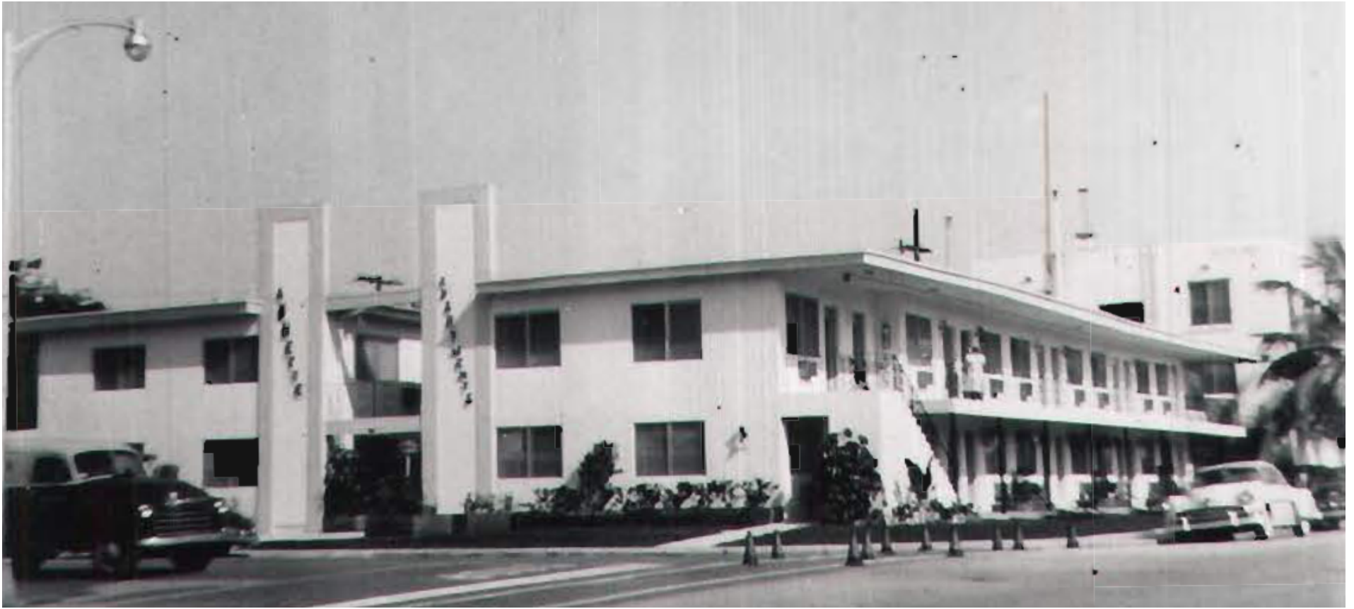
1955 PHOTOGRAPH (9)

Address: 1501-1511 Michigan Avenue aka Annette Apartments