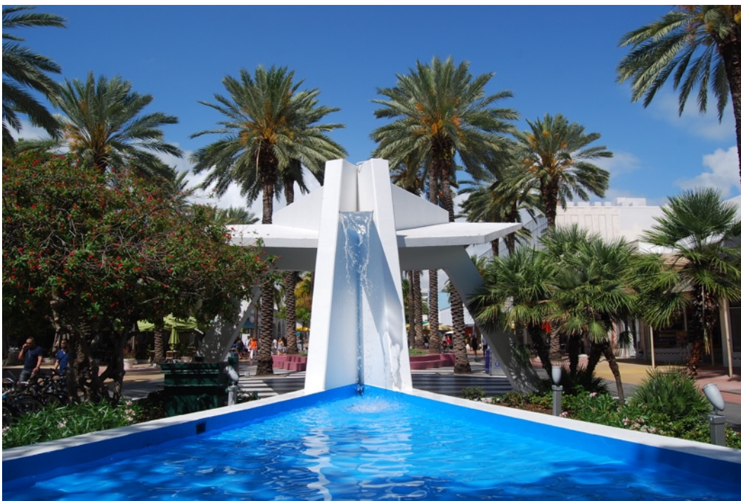
LINCOLN ROAD FOLLY FOUNTAIN DESIGNED BY THE ARCHITECT MORRIS LAPIDUS IN 1960, WHEN THE ROAD WAS TRANSFORMED FROM A VEHICULAR ROAD INTO A PEDESTRIAN PROMENADE (8)