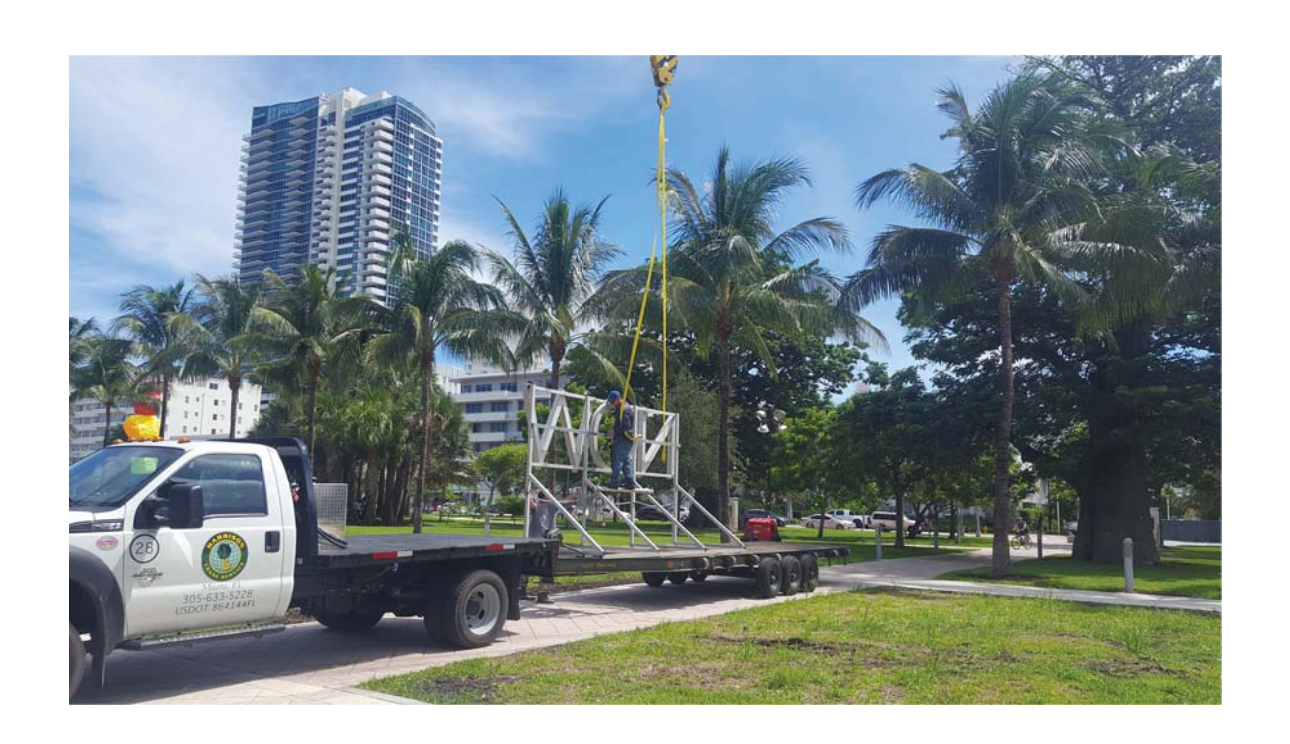
Flat Bed Truck