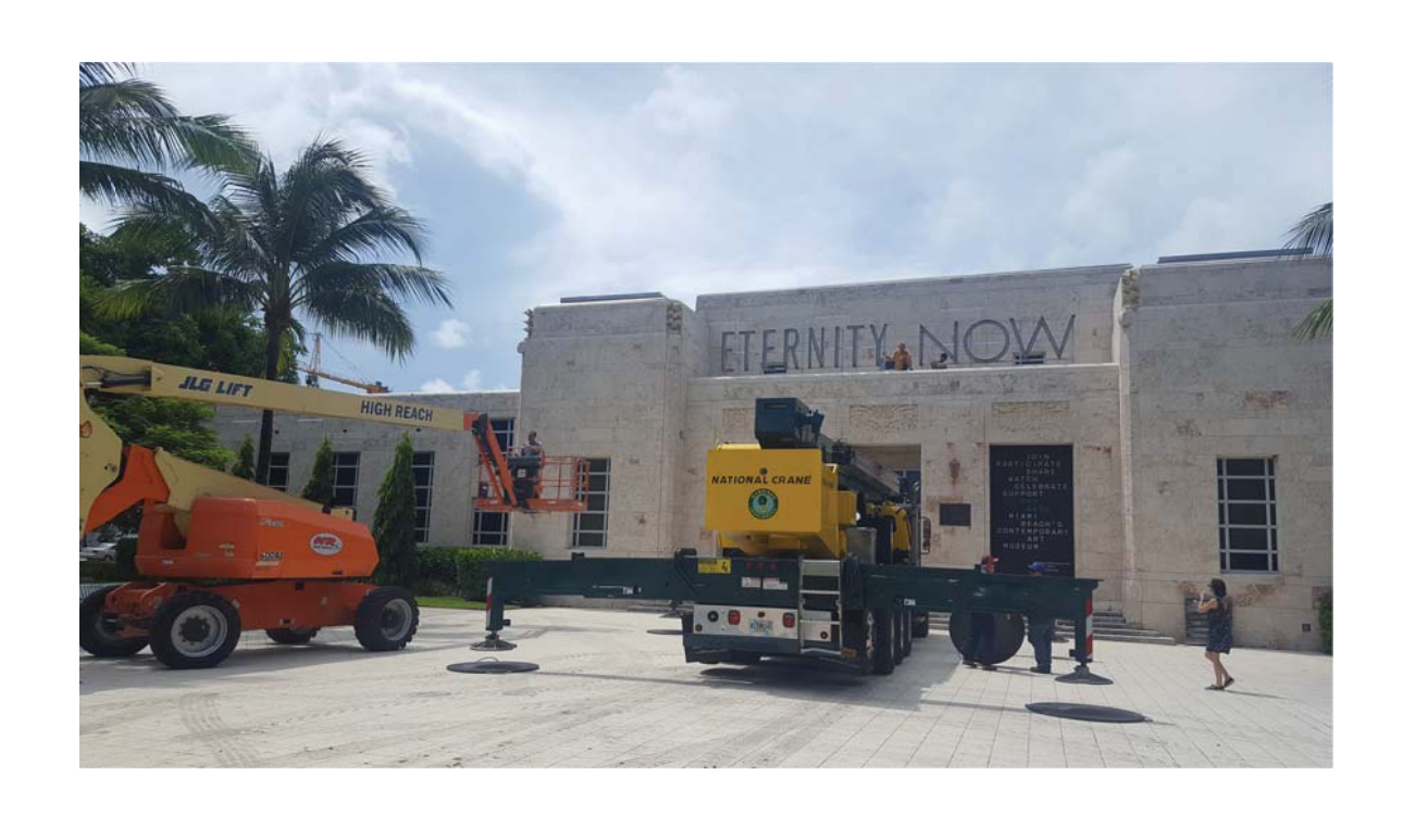
Exhibit 9m: Demolition Plan (Deinstallation Plan)