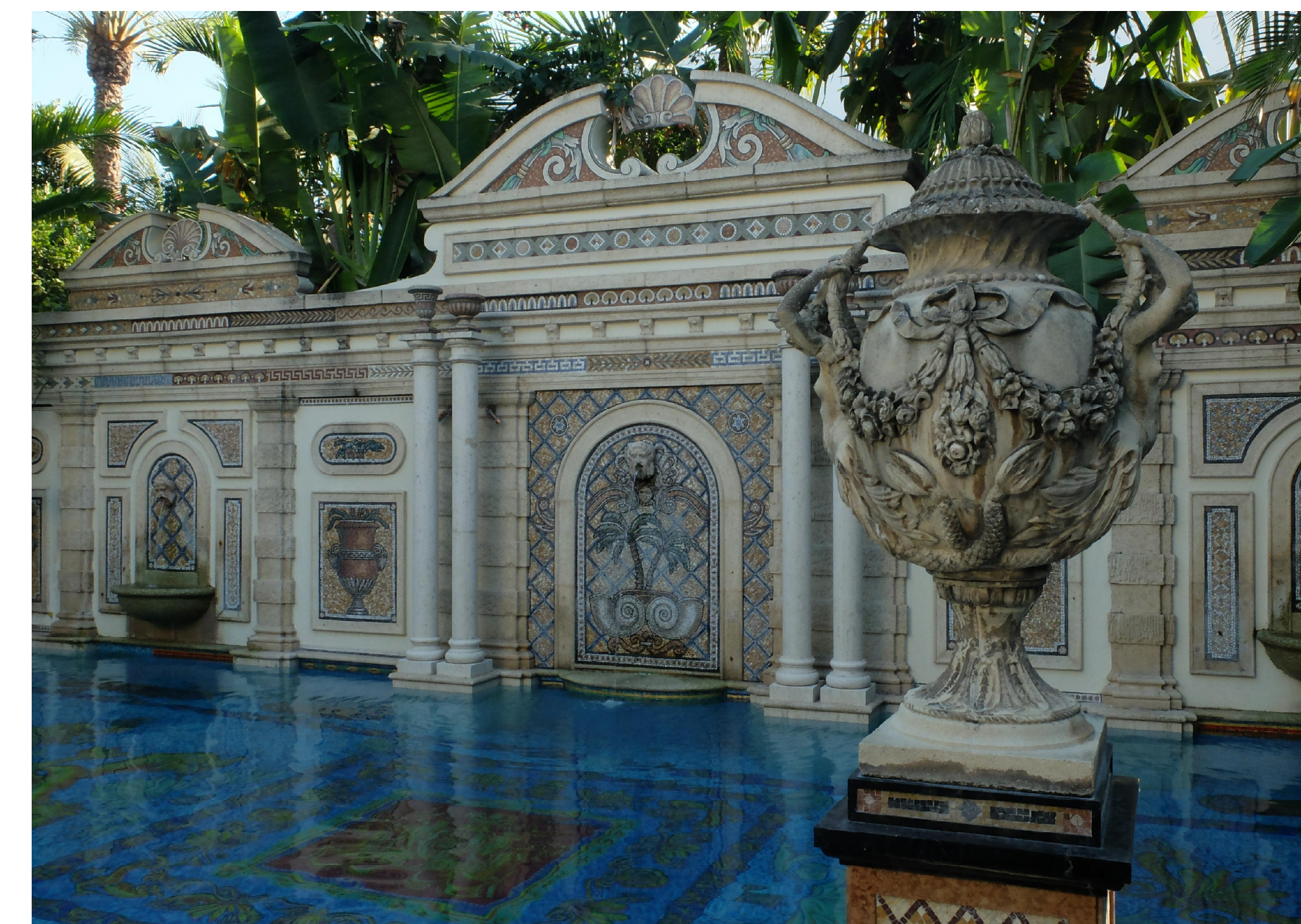
EXISTING POOL AREA (2015)