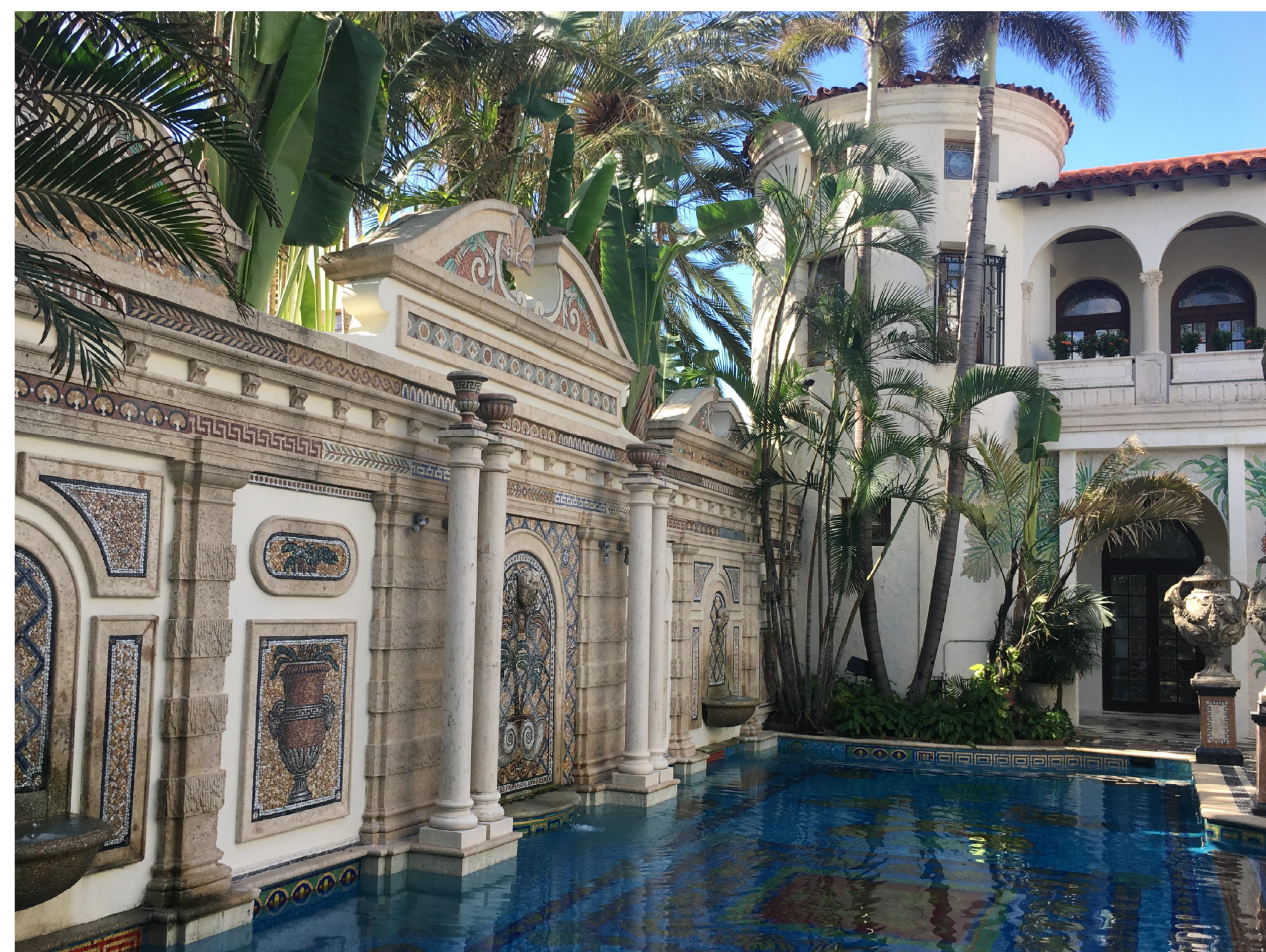
EXISTING POOL AREA (2017)