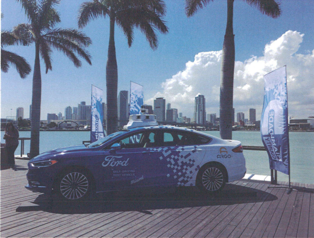
Ford Autonomous Vehicle. This vehicle has been mapping Miami Beach streets with the mapping device attached to its roof.