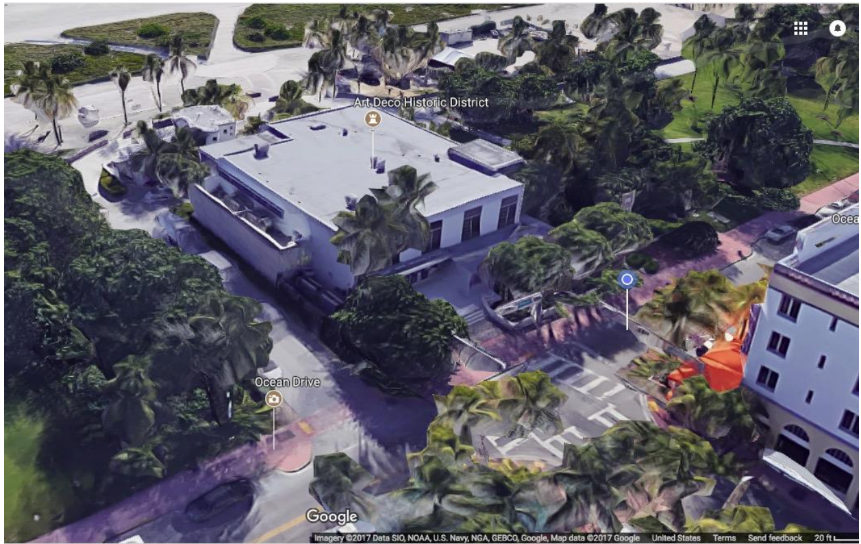
Existing Aerial