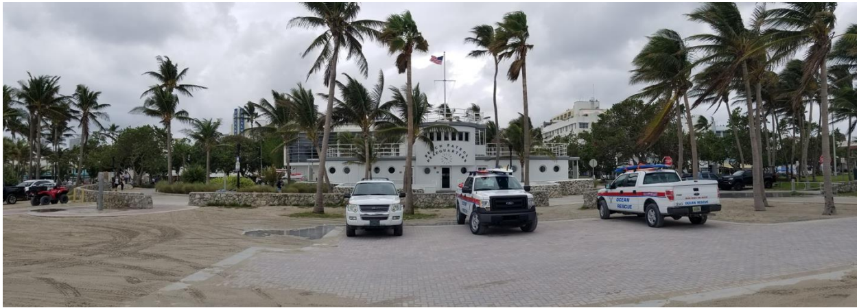
Existing East Panoramic