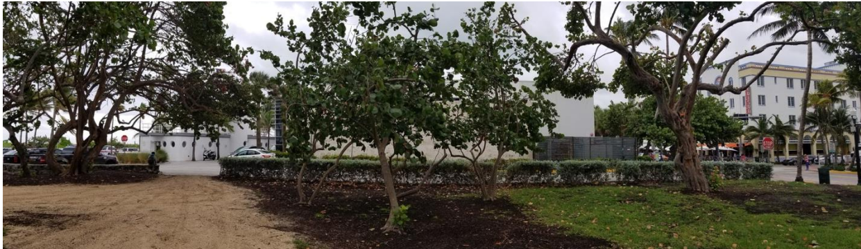
Existing North Panoramic