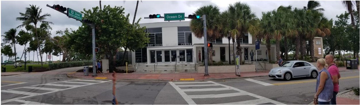
Existing West Panoramic