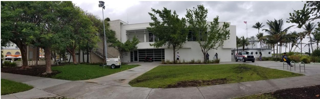
Existing South Panoramic