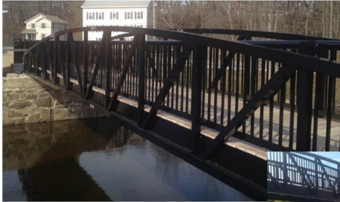
Option 2: Contour Style