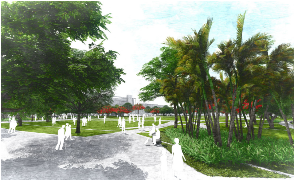
2. TROPICAL GARDEN PLANTINGS + SEATING