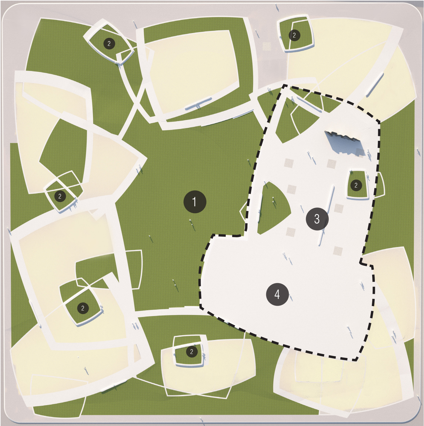
1 - PLOT LAYOUT - PREVIOUS PLAN