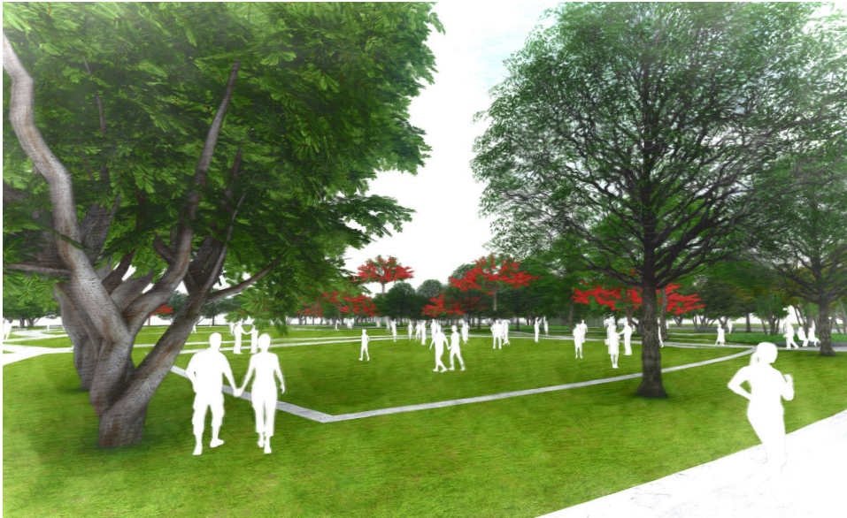
1. ENTRY PLAZA