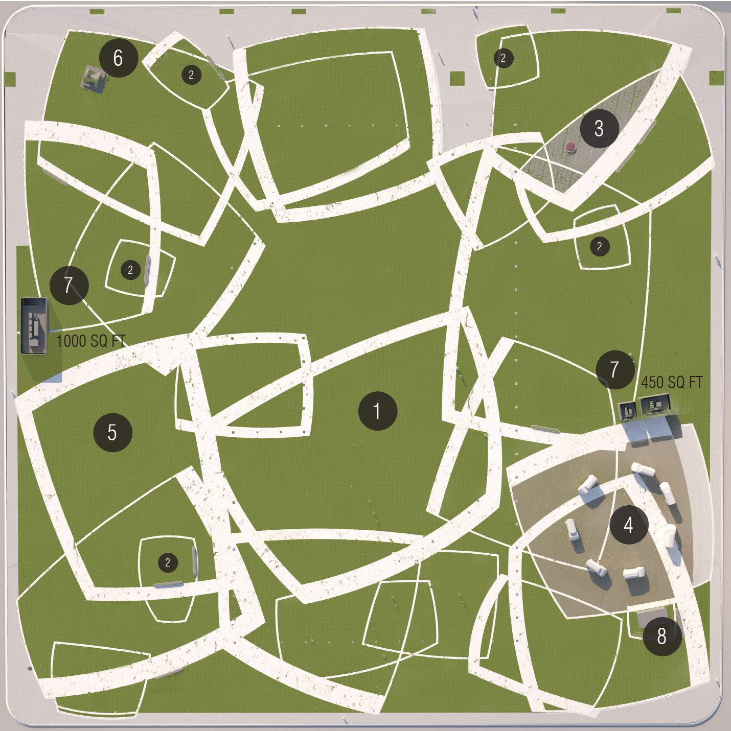
2 - PLOT LAYOUT - CURRENT PLAN

WARNING: It is a violation of the law for any person, unless acting under the direction of a licensed architect, to alter an item in any way. If an item in this document is altered, the altering architect, if other than the architect of record, shall affix to the item his seal and the notation of "altered by" follows by his signature and the date of such alteration, and the specific description of the alteration.