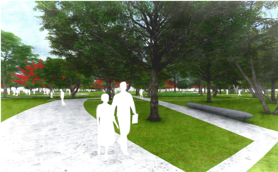
3. PARK ENTRANCE FROM 19TH STREET