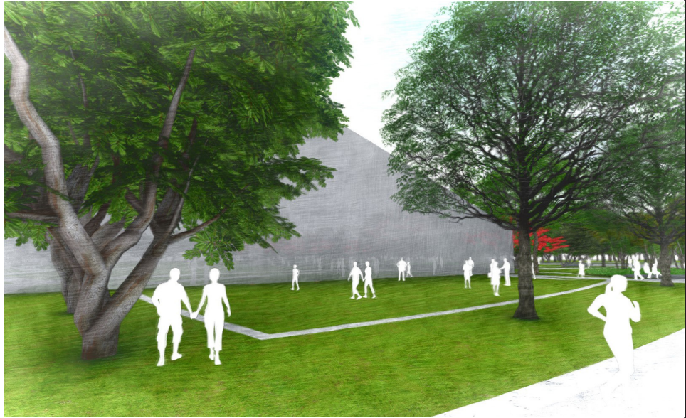
1. ENTRY PLAZA