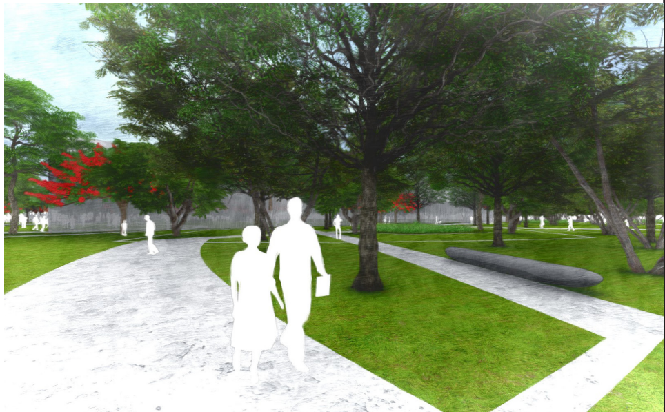
3. PARK ENTRANCE FROM 19TH STREET