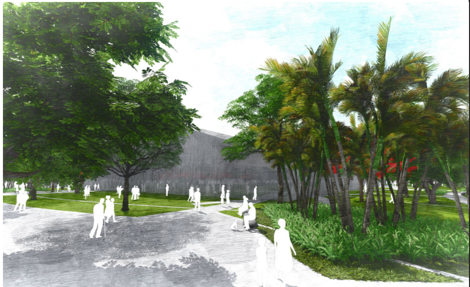
2. TROPICAL GARDEN PLANTINGS + SEATING