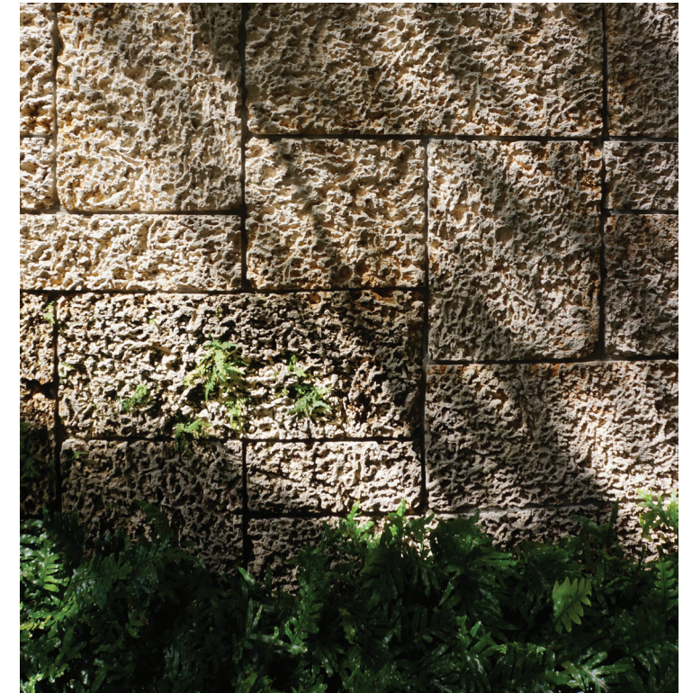
OOLITE STONE WALL