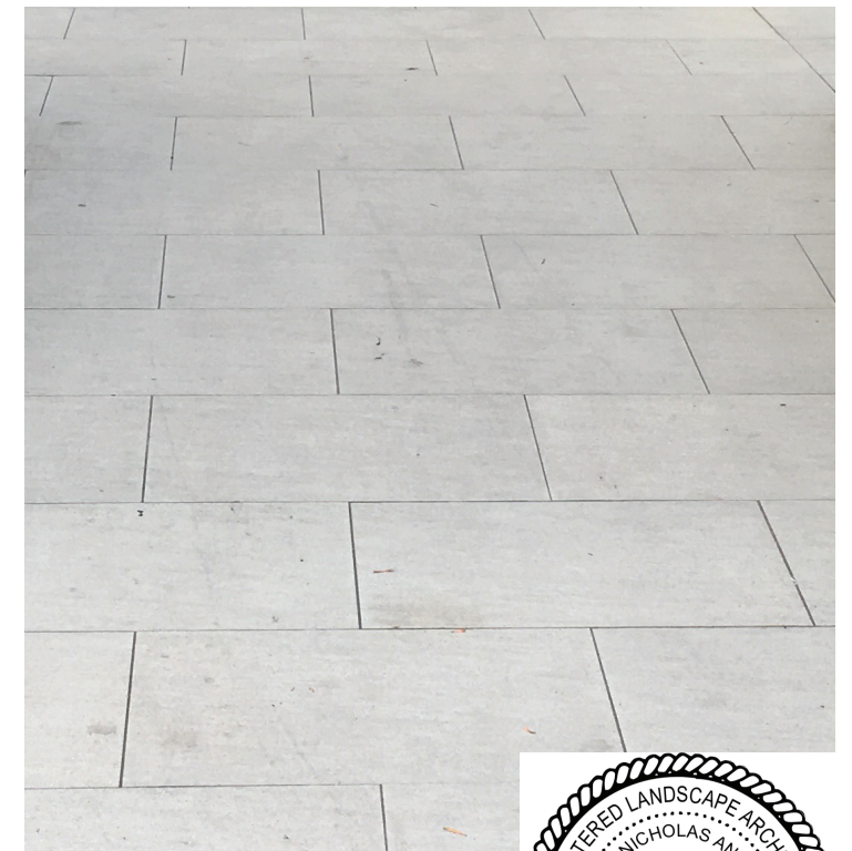
PROPOSED POOL DECK TO MATCH EXISTING