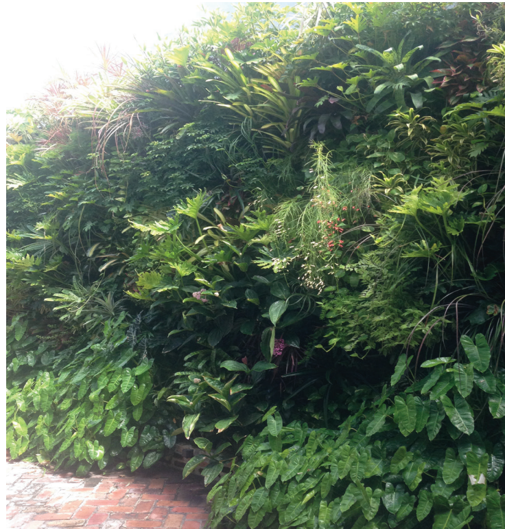
PROPOSED GREEN WALL