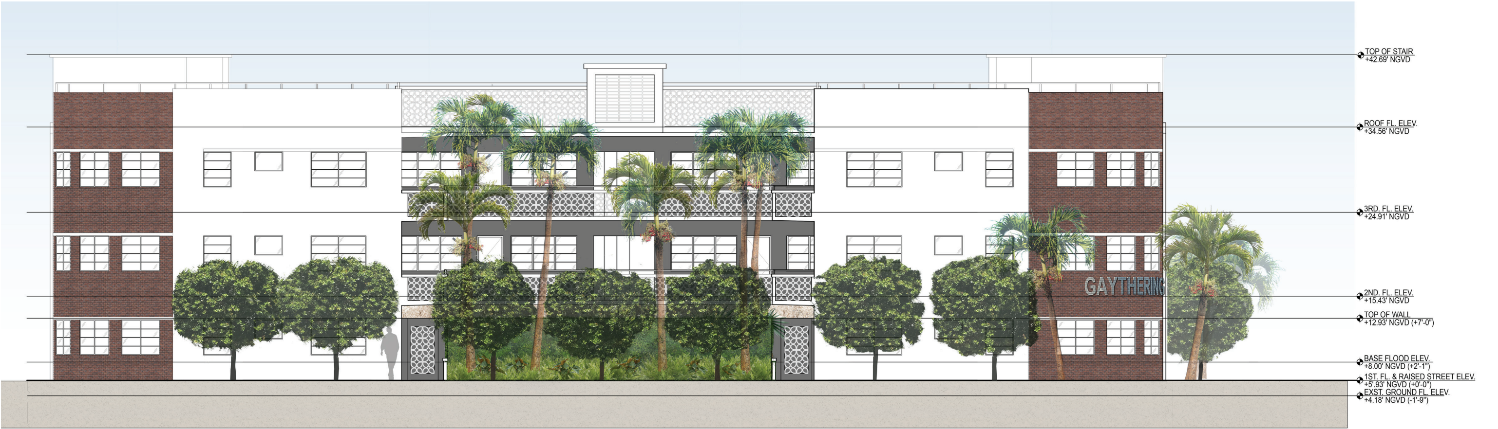
1 SOUTH ELEVATION 3/16" = 1'-0"