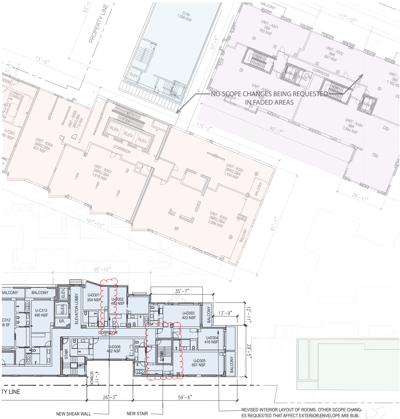
Revised Proposed Third Level Floor Plan - East SCALE: 1/16" = 1'