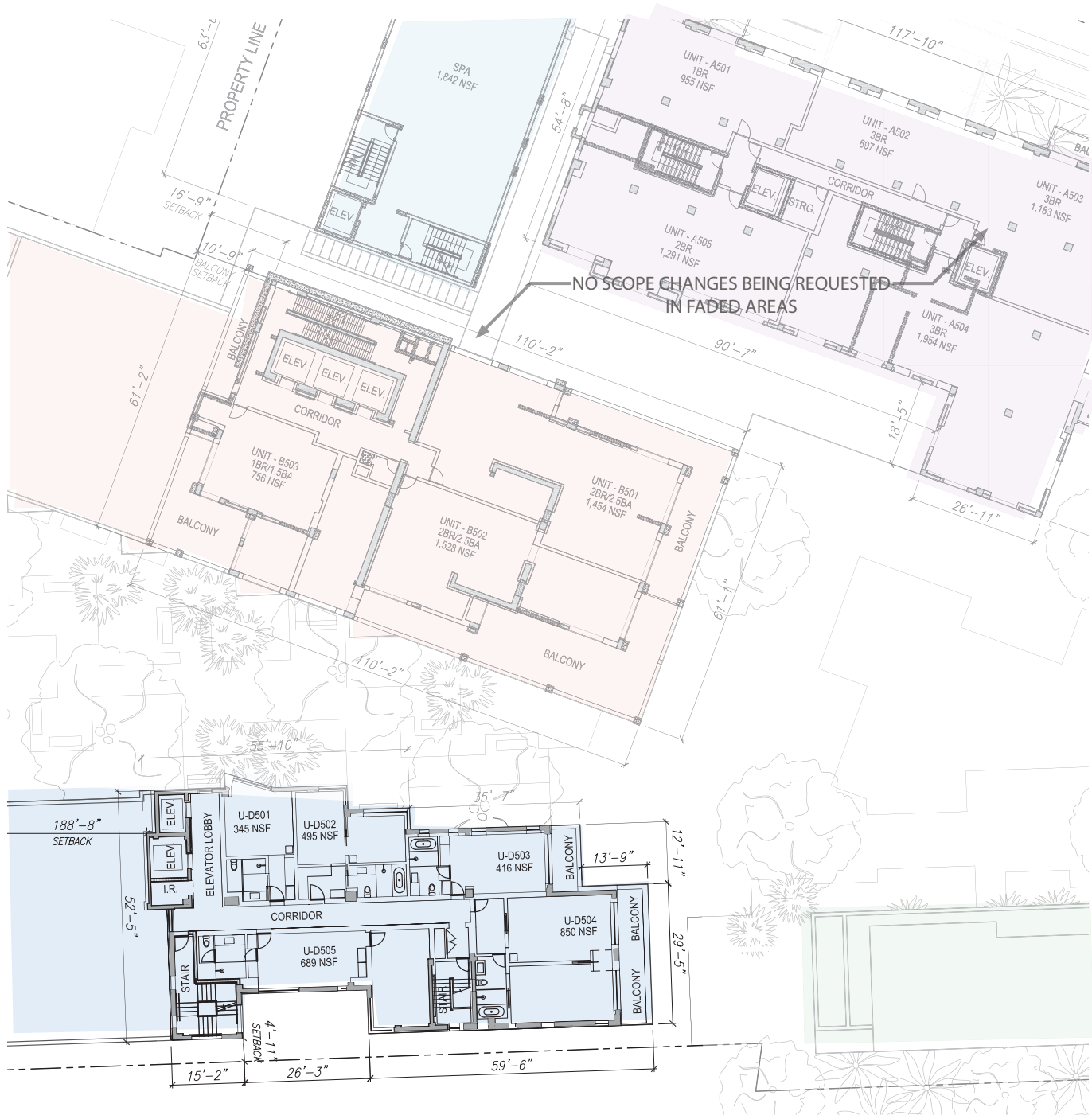
Currently Approved Fourth - Eighth Level Floor Plan - East SCALE: 1/16" = 1'