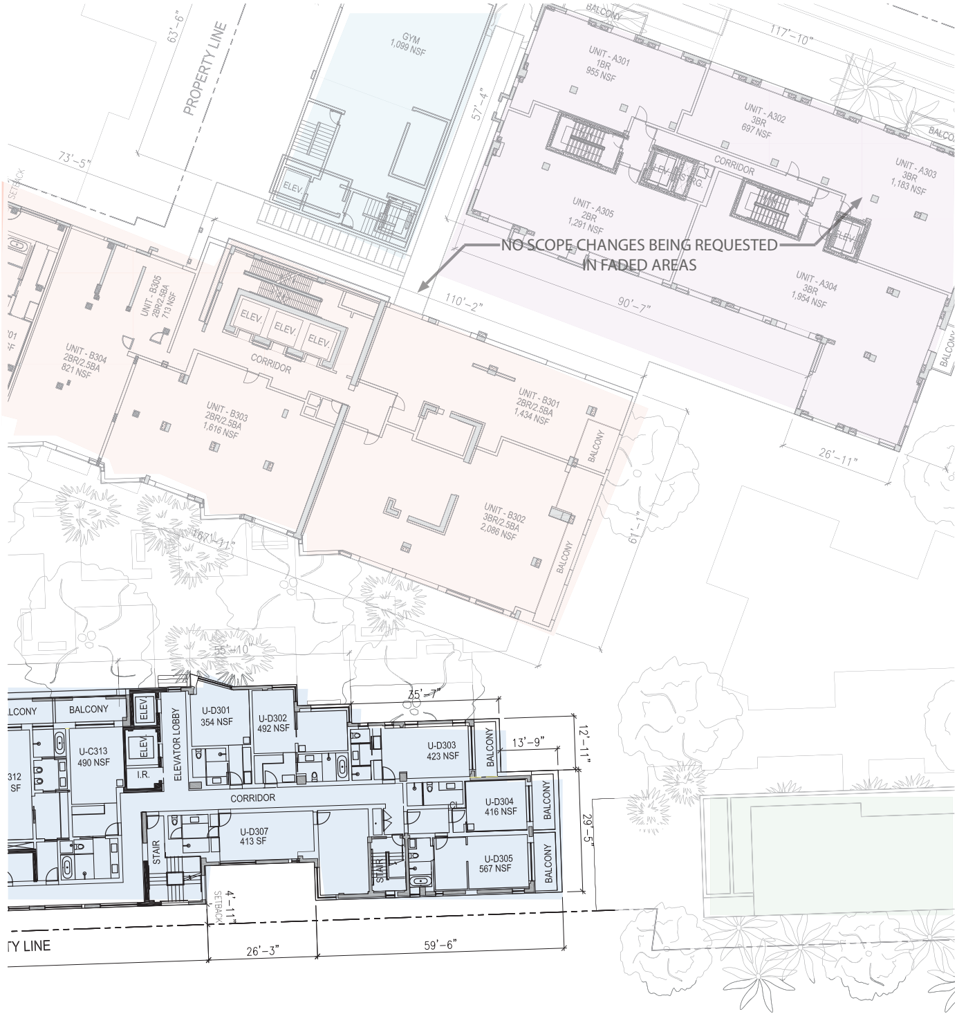
Currently Approved ThirdLevel Floor Plan - East SCALE: 1/16" = 1'