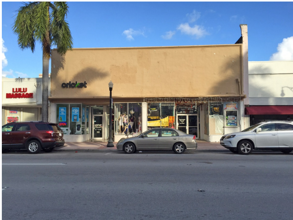
Existing conditions Collins 7435-39

Architect: T. Hunter Henderson Year- 1940 Style- Post War Modern– MiMo Local Historic District- “Harding Townsite_South Altos del Mar Historic District” Historically contributing Structure. Curiosities: Permit record mixes 2 lot permits into one lot permit therefore 7433 was always a single use Lot (assigned 7433 Collins Ave. & the next lot was assigned 3 numbers and 3 locales (7435-7437-7439) Present uses: Latin Food Market (7435) / Cricket (7439) /Most Everything Fashion Outlet (7437) Architect Bio: T. Hunter Henderson was the Architect for the Astor hotel (1930-39), Cinema Casino, Messing Apartments (1940-49) among his works.