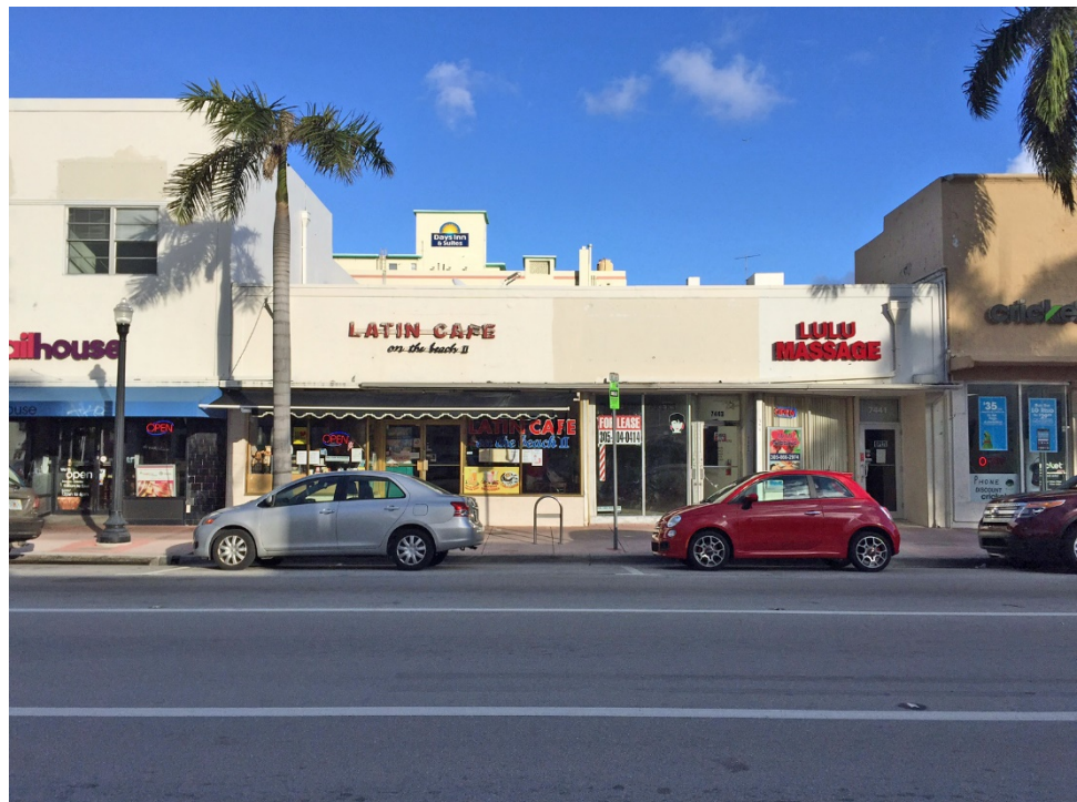
Existing conditions Collins 7441