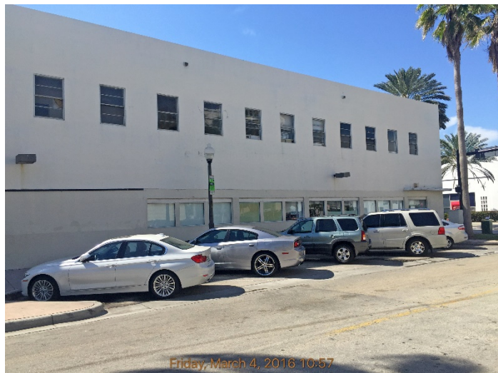
Existing Conditions Collins 7447-55