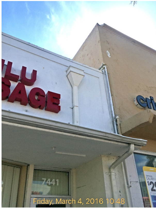
Existing conditions Collins 7441