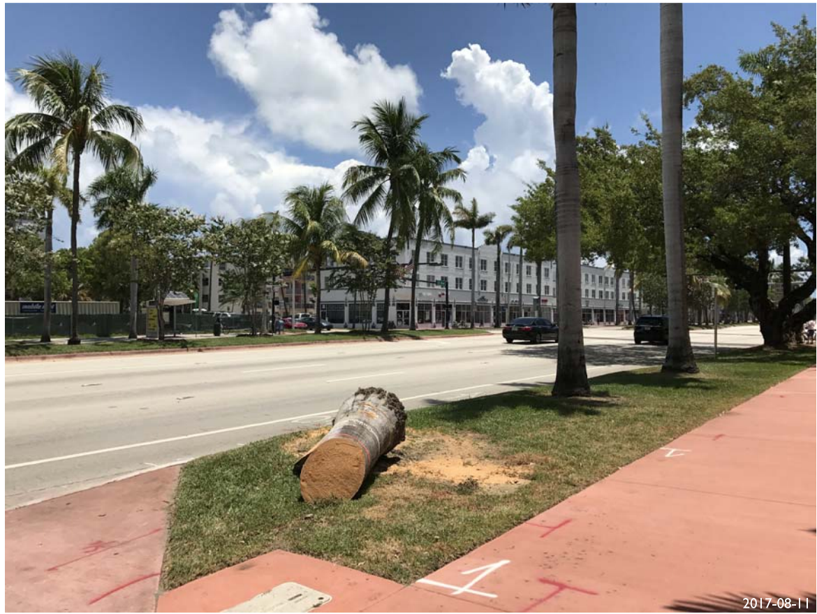
12. VIEW OF BUILDING ON NORTHEAST CORNER OF 5TH STREET AND MERIDIAN AVENUE