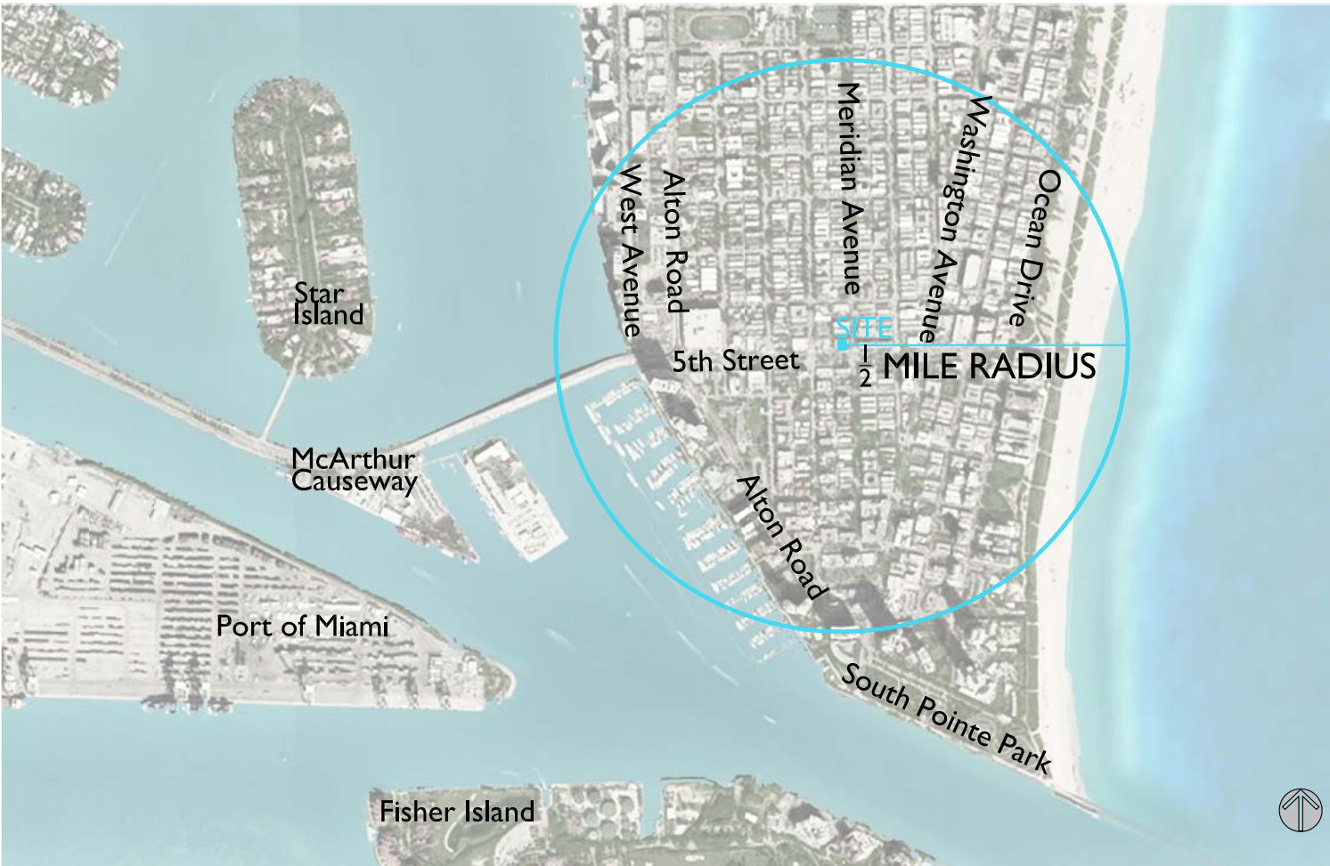
AERIAL OF 1/2 MILE RADIUS