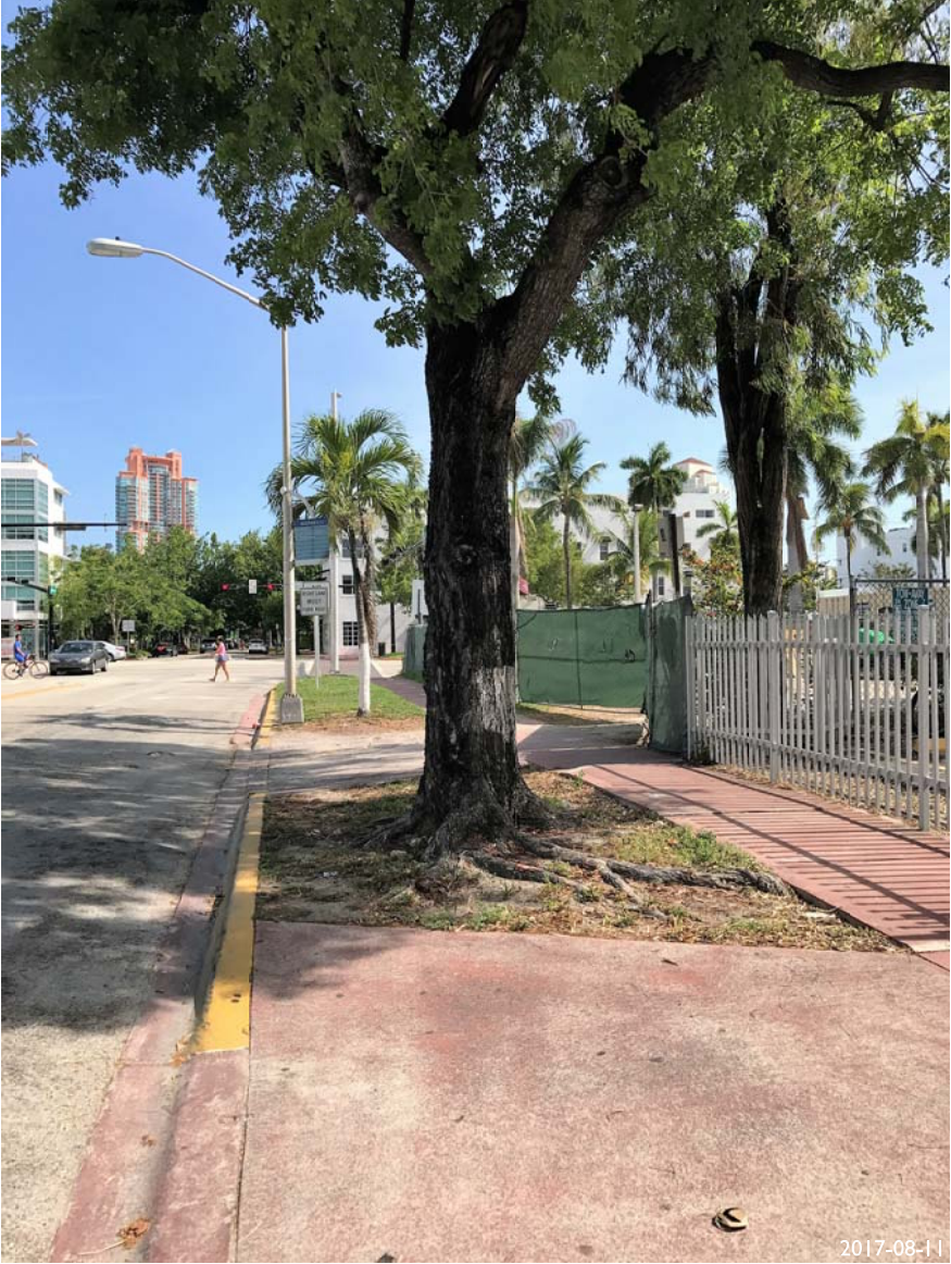
8. MERIDIAN AVENUE FACING SOUTH ALONG SIDEWALK