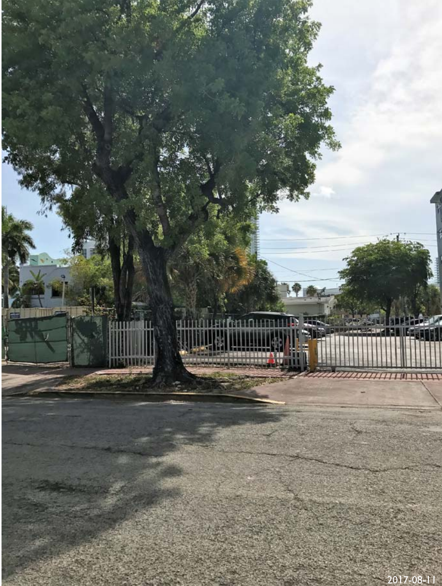
7. CURB CUT ON ADJACENT PROPERTY TO NORTH