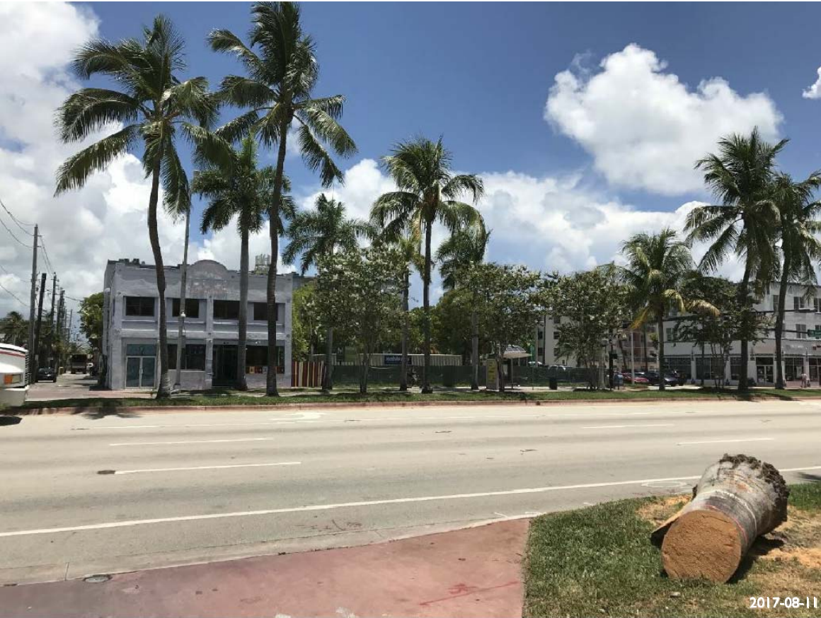
1. VIEW OF PROPERTY FACING NORTH ACROSS 5TH STREET