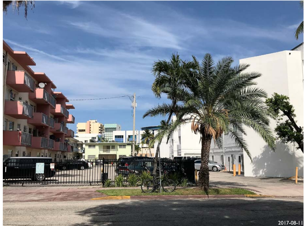
15. VIEW OF EAST SIDE OF MERIDIAN AVENUE