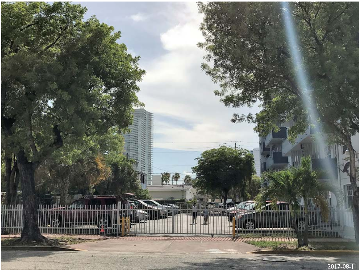
20. VIEW OF WEST SIDE OF MERIDIAN AVENUE