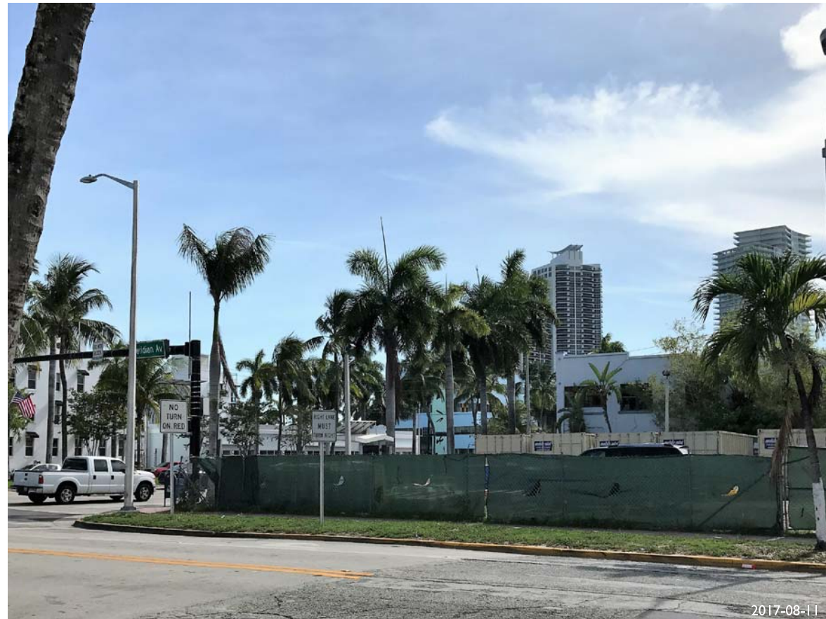
19. VIEW OF WEST SIDE OF MERIDIAN AVENUE