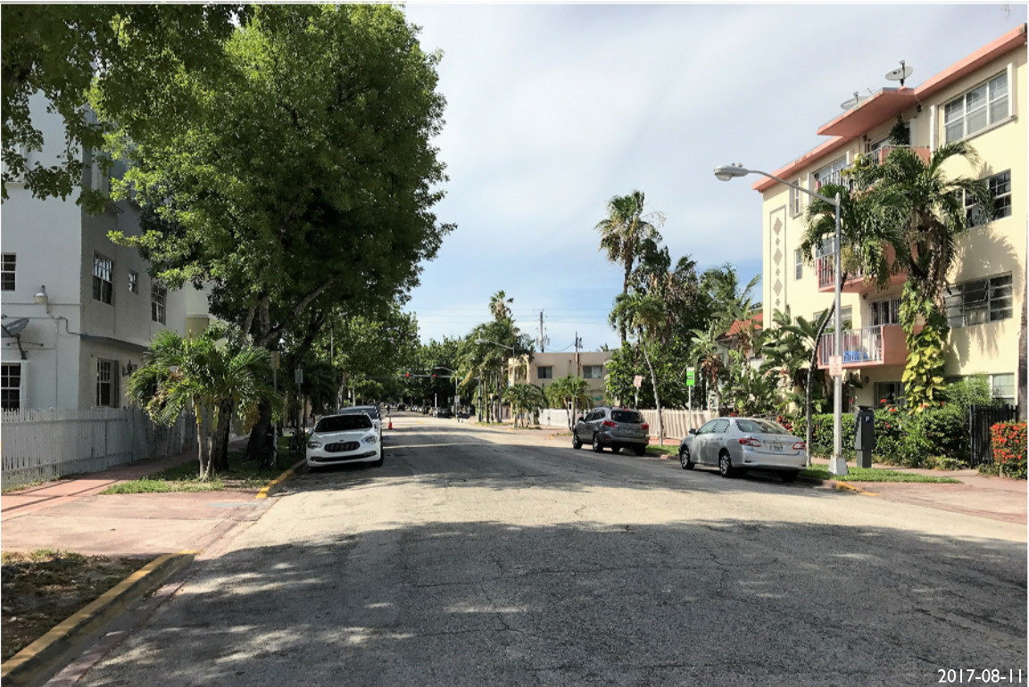
5. MERIDIAN AVENUE FACING NORTH