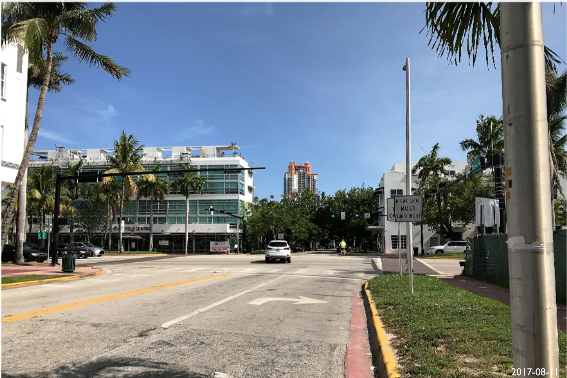
4. MERIDIAN AVENUE FACING SOUTH