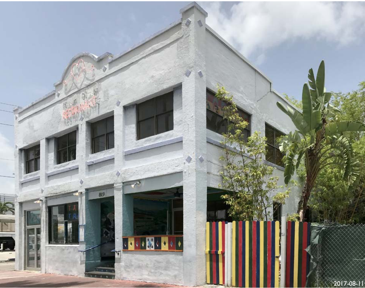
23. VIEW OF TAPTAP RESTAURANT