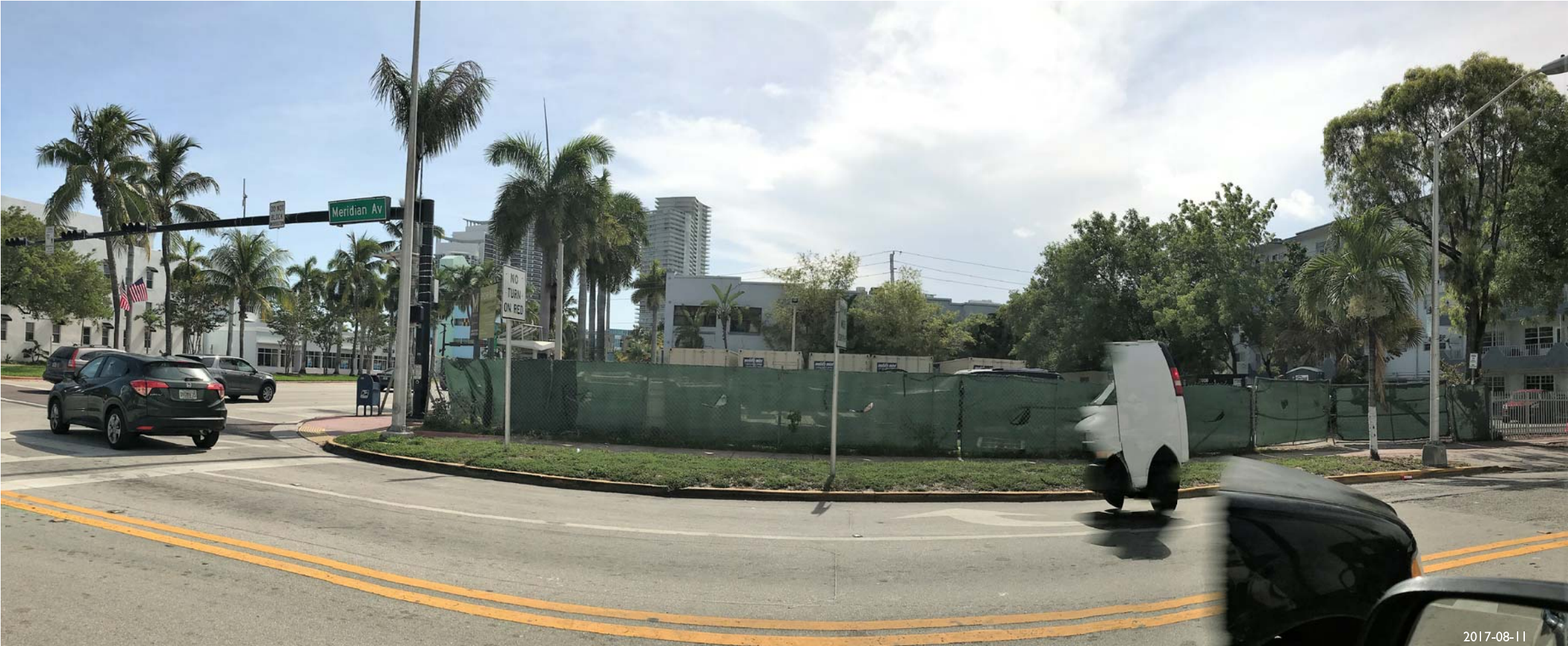
3. VIEW OF PROPERTY FACING WEST