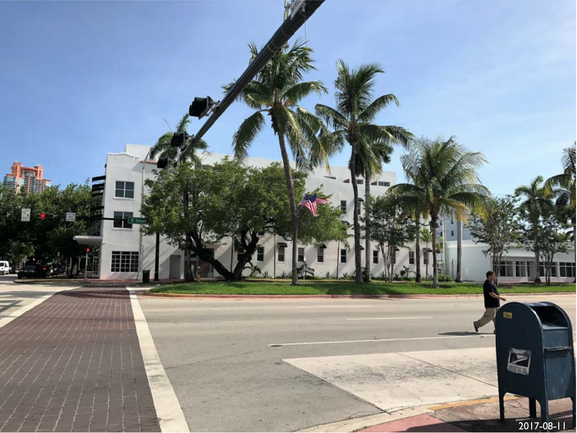
10. VIEW OF URBANICA HOTEL ON SOUTHWEST CORNER OF 5TH STREET AND MERIDIAN AVENUE