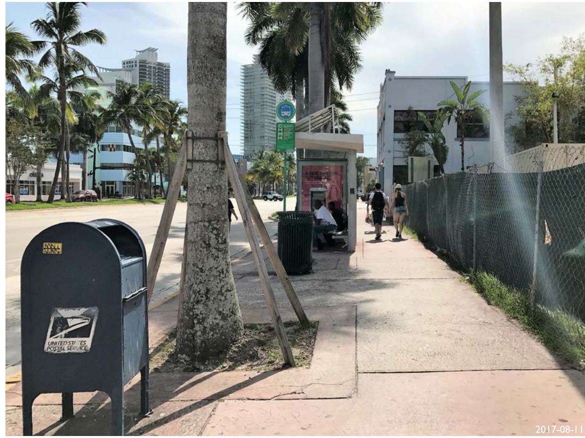
21. VIEW OF SIDEWALK ALONG 5TH STREET