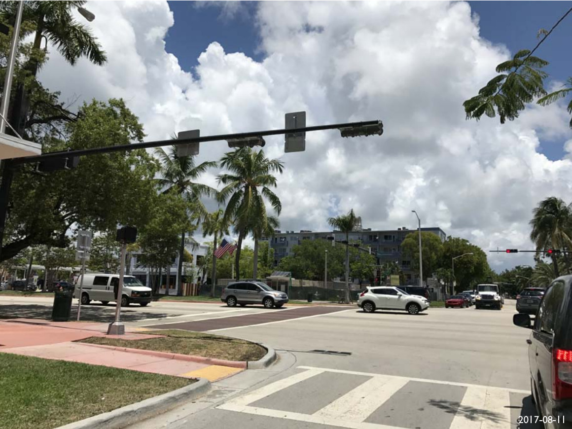
2. VIEW OF PROPERTY FACING NORTHWEST