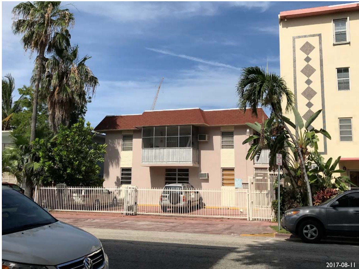
16. VIEW OF EAST SIDE OF MERIDIAN AVENUE