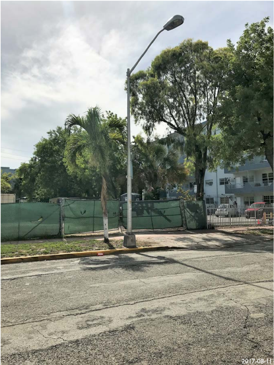
6. SITE ALONG MERIDIAN AVENUE AND EXISTING CURB