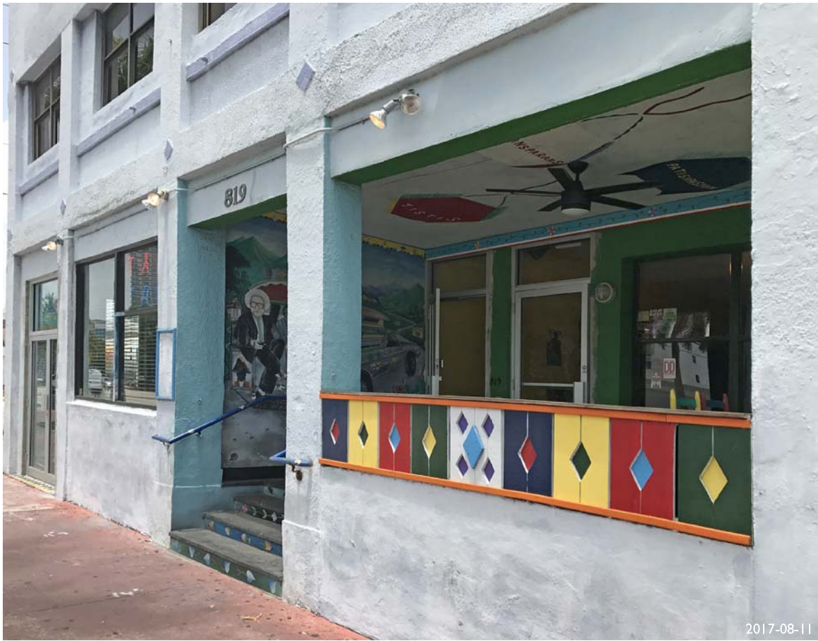
22. TAPTAP RESTAURANT ENTRANCE