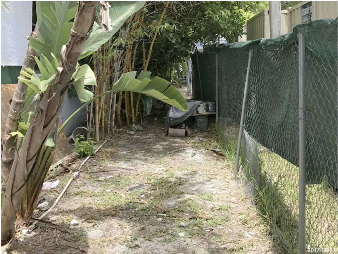
24. VIEW OF THE ALLEY BETWEEN THE SITE AND TAPTAP RESTAURANT