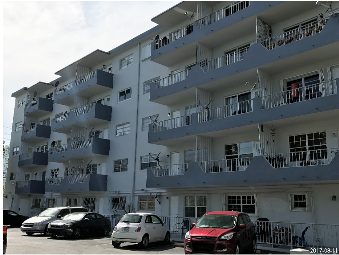
11. VIEW OF RESIDENTIAL BUILDING TO THE NORTH OF PROPERTY