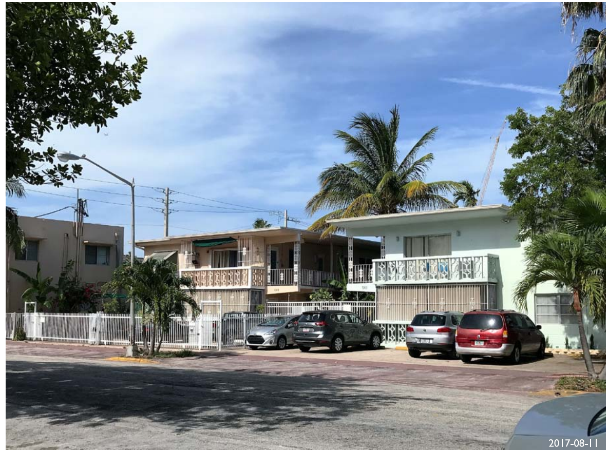
17. VIEW OF EAST SIDE OF MERIDIAN AVENUE