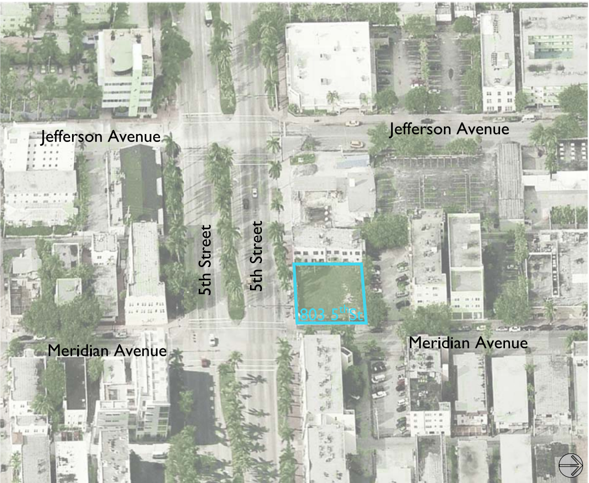
AERIAL FACING WEST