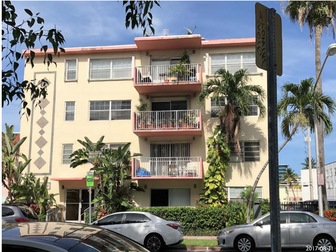
14. VIEW OF EAST SIDE OF MERIDIAN AVENUE