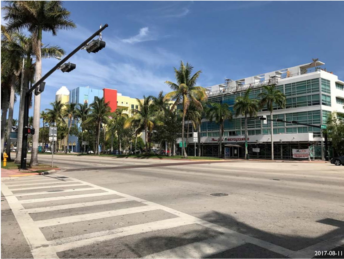
9. VIEW OF RESIDENTIAL BUILDING ON SOUTHEAST CORNER OF 5TH STREET AND MERIDIAN AVENUE