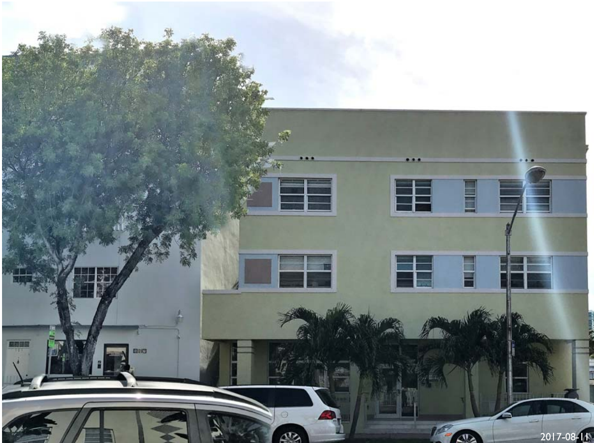
18. VIEW OF WEST SIDE OF MERIDIAN AVENUE