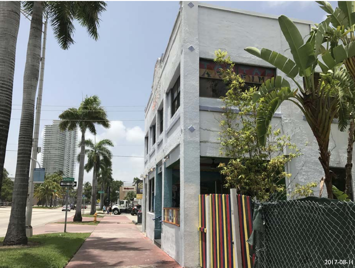
25. VIEW OF SIDEWALK ALONG 5TH STREET