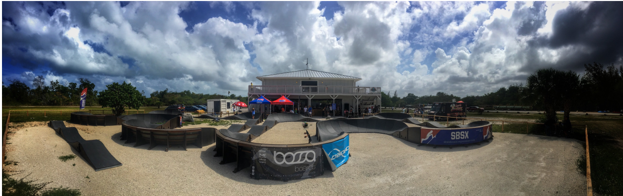
(Actual track being sold)