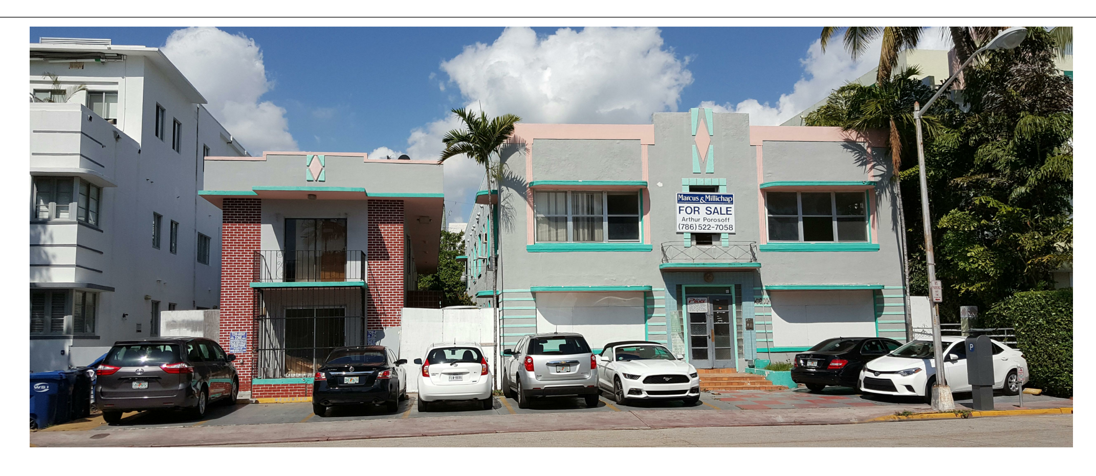
BUILDING B EAST (FRONT)