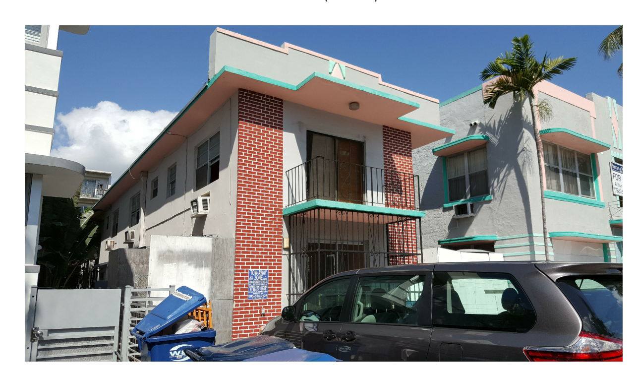
BUILDING B SOUTH EAST (FRONT)