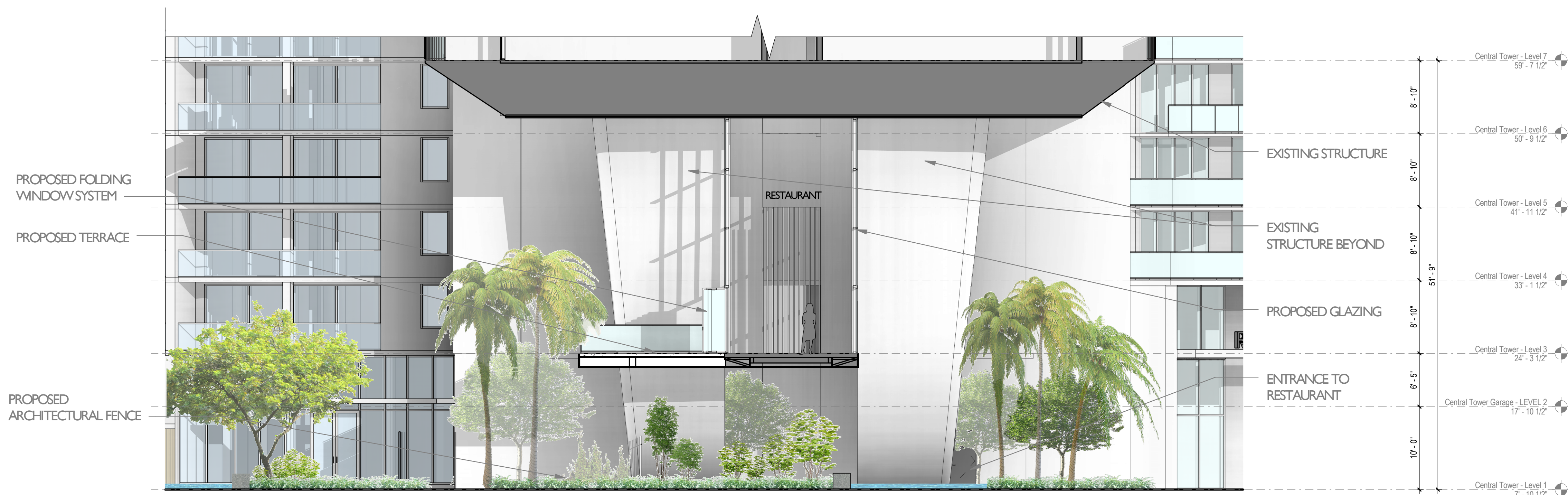
Central Tower - Section I Proposed SCALE: 1/8" = 1'-0"

GENERAL NOTE: ALL ELEVATIONS & SECTIONS ARE NOTED AS NGVD