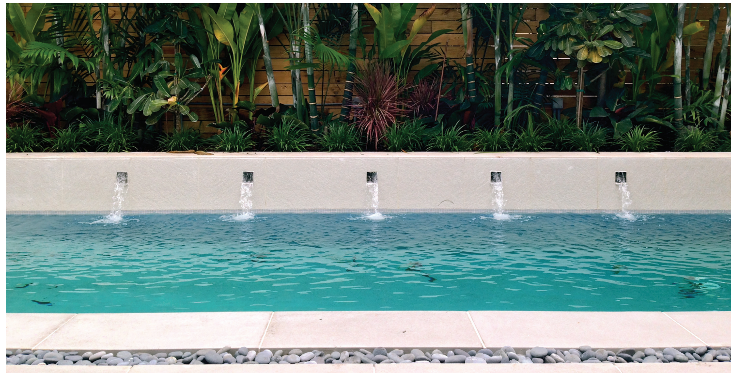
PROPOSED POOL WITH WATER FEATURE