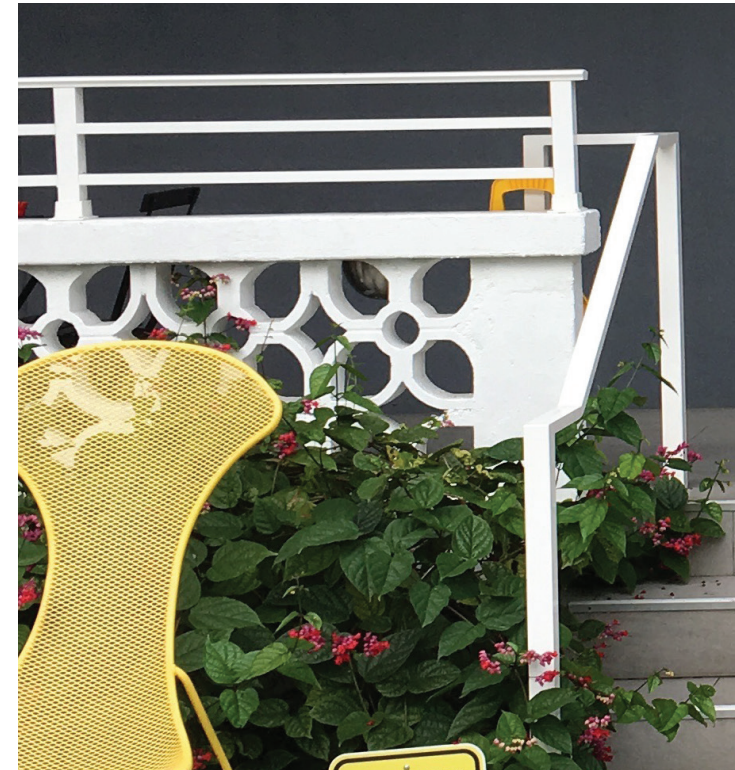
METAL RAILING & POOL GATE TO MATCH EXISTING