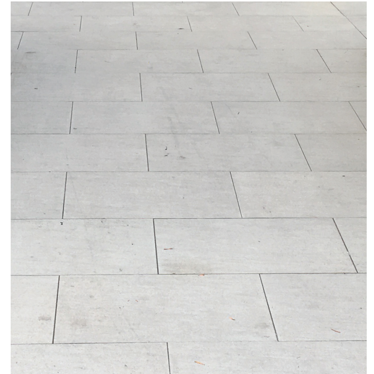
PROPOSED POOL DECK TO MATCH EXISTING