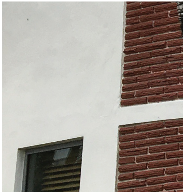
PROPOSED STUCCO WORK TO MATCH EXISTING