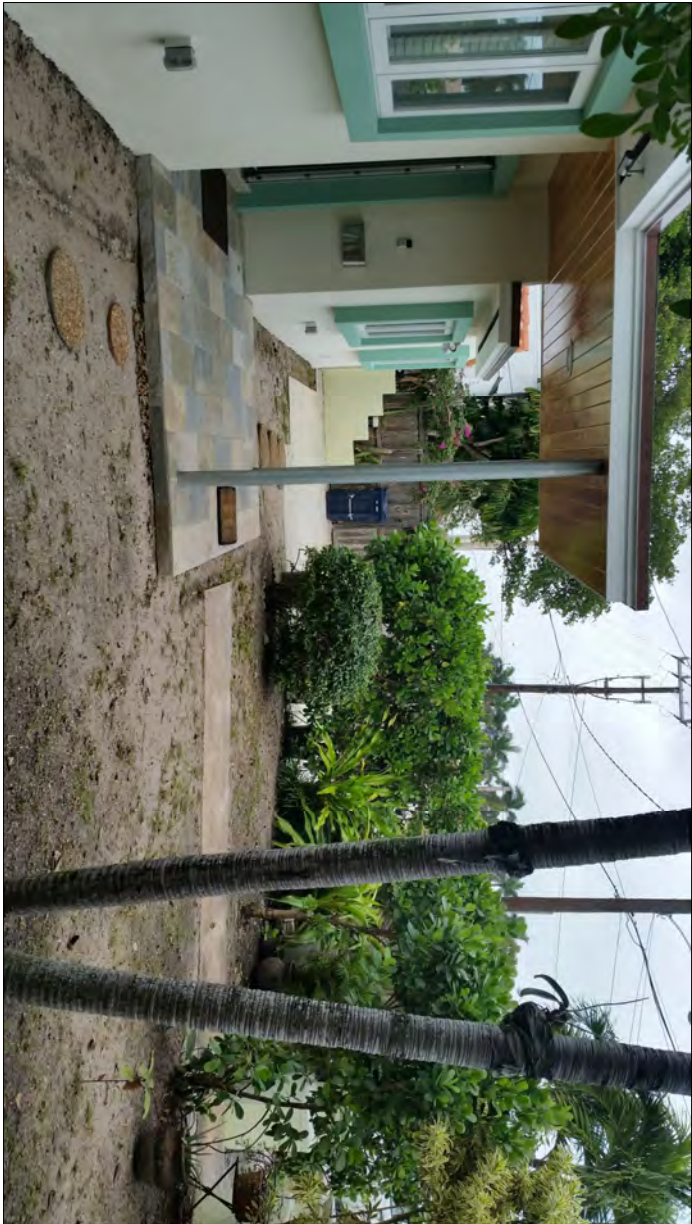
SIDE VIEW - SOUTH (PHOTO TAKEN ON JANUARY 27TH, 2016)