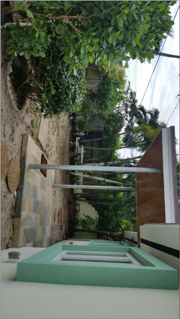
SIDE VIEW - NORTH (PHOTO TAKEN ON JANUARY 27TH, 2016)