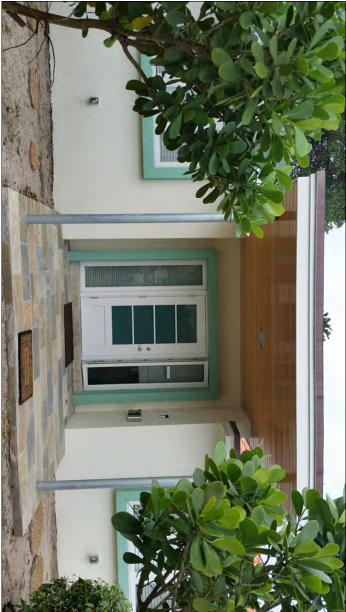
FRONT VIEW - EAST (PHOTO TAKEN ON JANUARY 27TH, 2016)