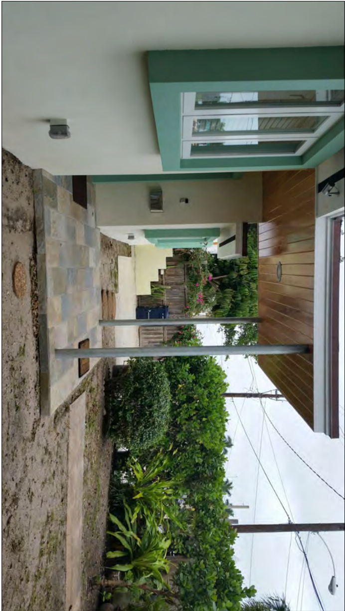
SIDE VIEW - SOUTH (PHOTO TAKEN ON JANUARY 27TH, 2016)