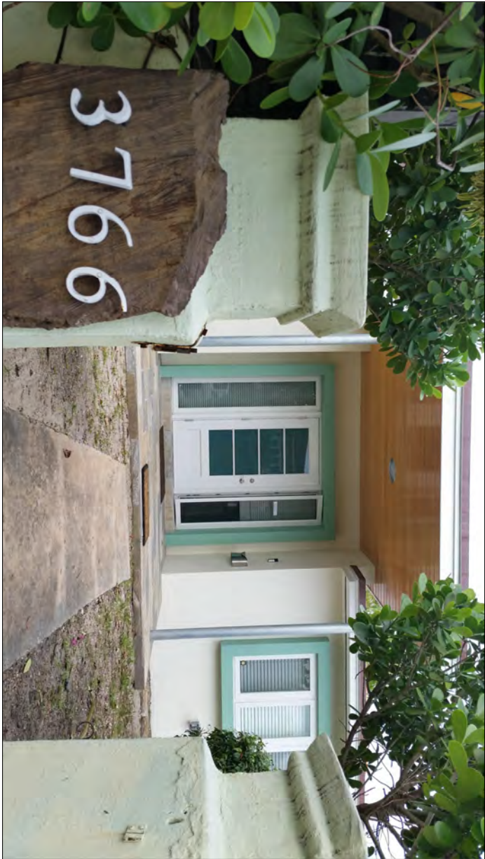
FRONT VIEW - EAST (PHOTO TAKEN ON JANUARY 27TH, 2016)