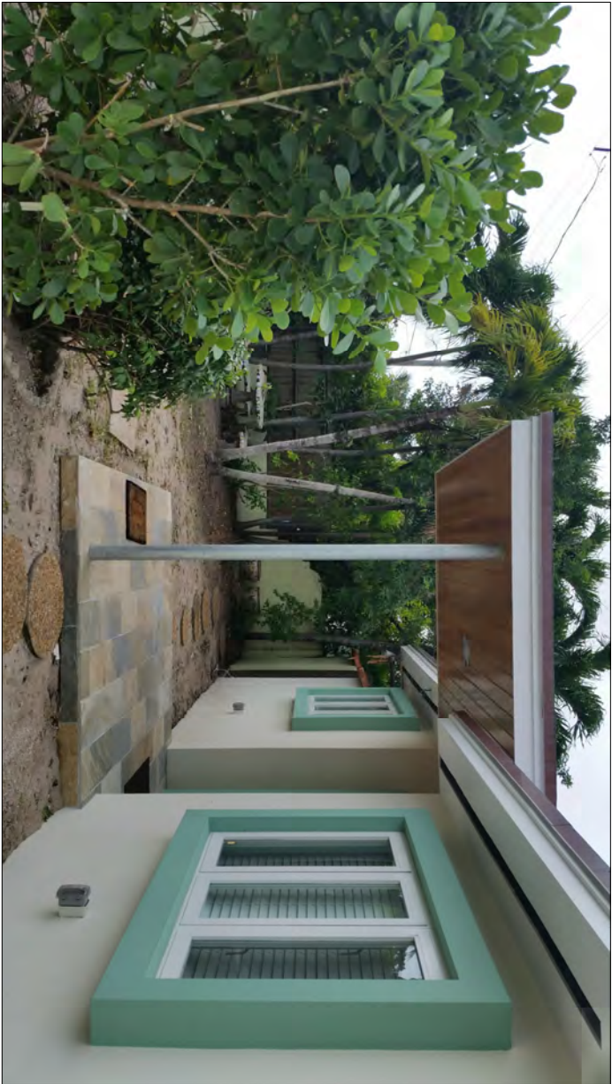
SIDE VIEW - NORTH (PHOTO TAKEN ON JANUARY 27TH, 2016)