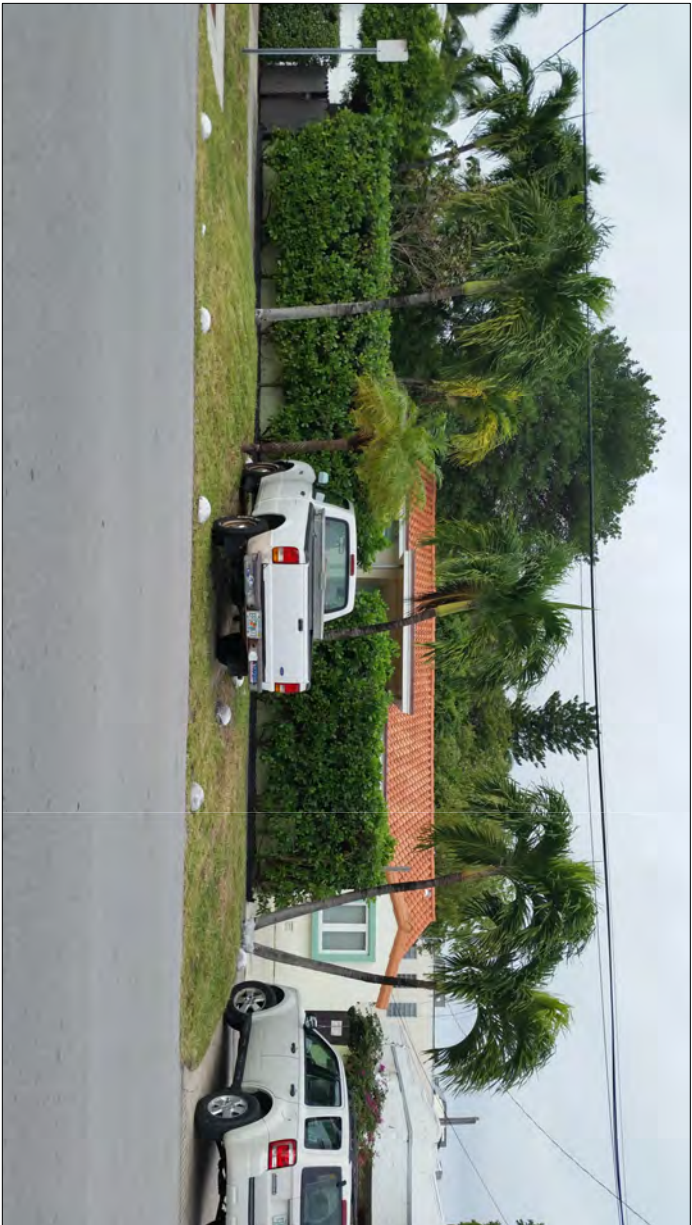
FRONT VIEW - EAST (PHOTO TAKEN ON JANUARY 27TH, 2016)