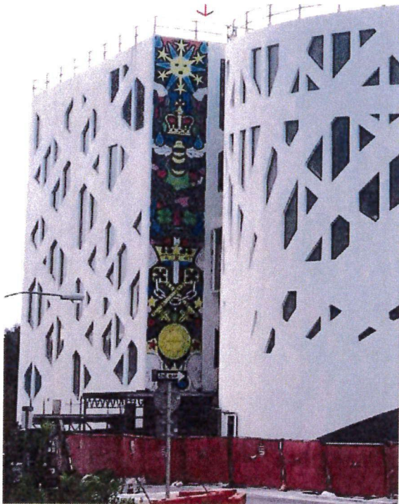
Previously approved banner, 2016