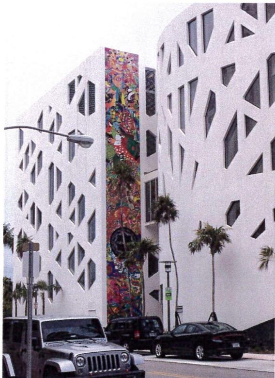
Currently installed banner, 2017