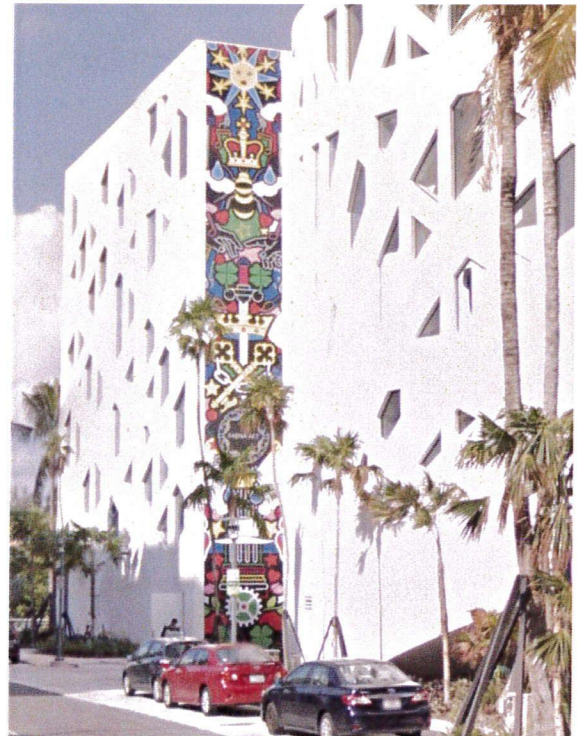
Previously installed banner, 2016