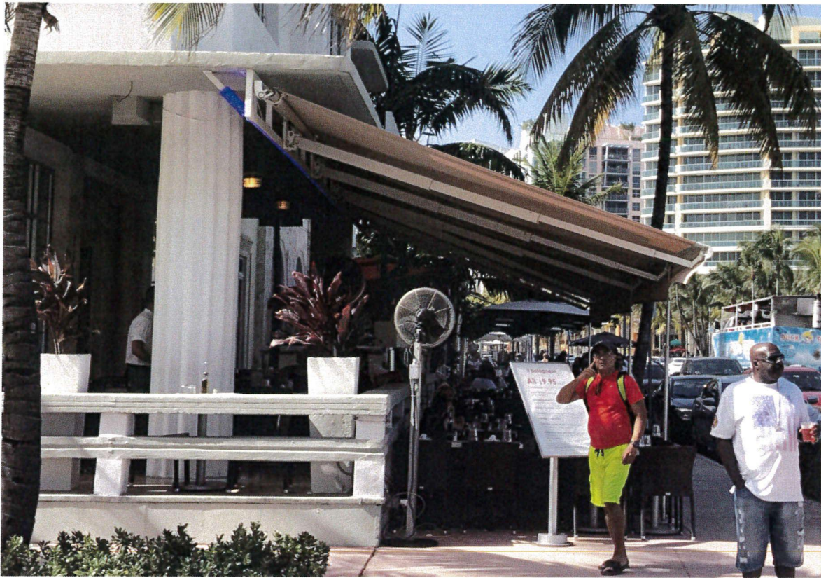
Unpermitted retractable awning structure, August 2017