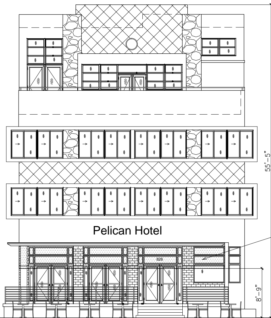
EAST ELEVATION (FRONT) SCALE : 3/32" = 1'-0"

RETRACTABLE AWNING (SEE SPECS. ATTACHED)