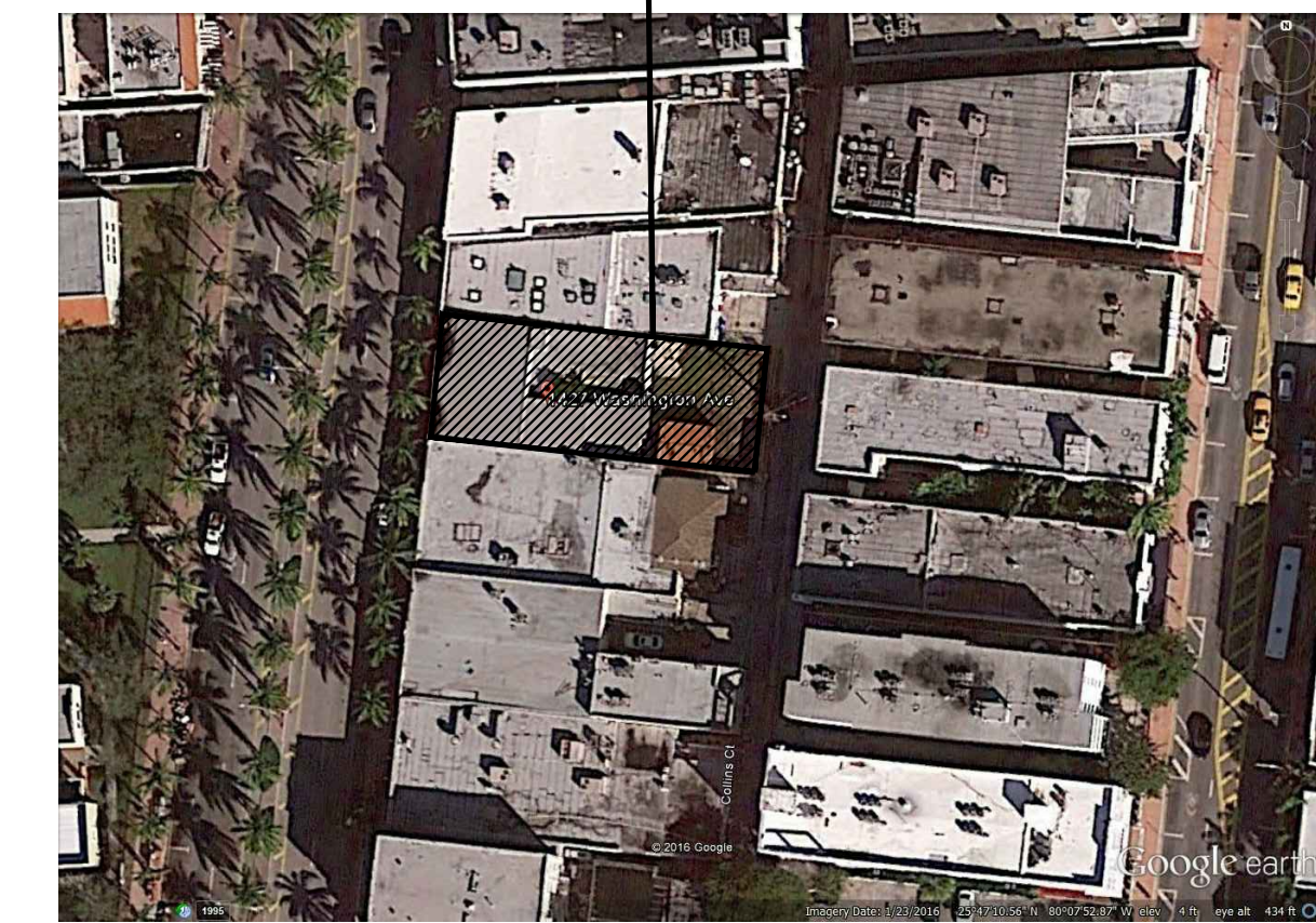
LOCATION MAP SCALE: N.T.S.