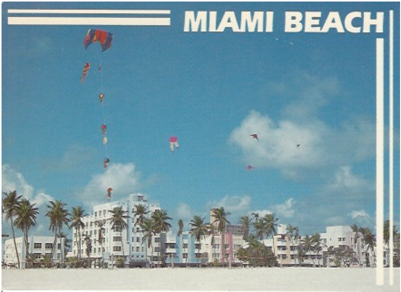
OCEAN DRIVE WITH HEATHCOTE AT FAR LEFT, 1992