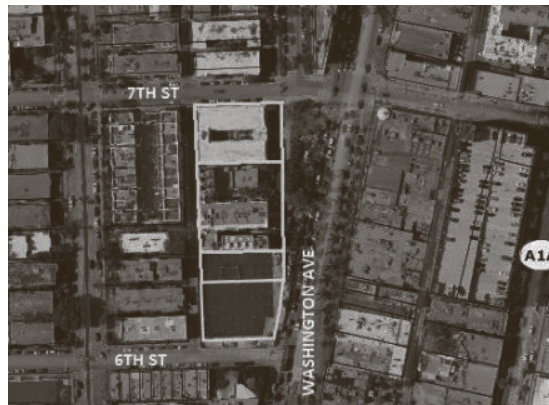
Map indicating the area covered by the proposed Ordinances

INTERESTED PARTIES are invited to appear at this meeting, or be represented by an agent, or to express their views in writing addressed to the City Commission, c/o the City Clerk, 1700 Convention Center Drive, 1 st Floor, City Hall, Miami Beach, Florida 33139. This item is available for public inspection during normal business hours in the City Clerk's Office, 1700 Convention Center Drive, 1 st Floor, City Hall, Miami Beach, Florida 33139. This item may be continued, and under such circumstances, additional legal notice need not be provided.