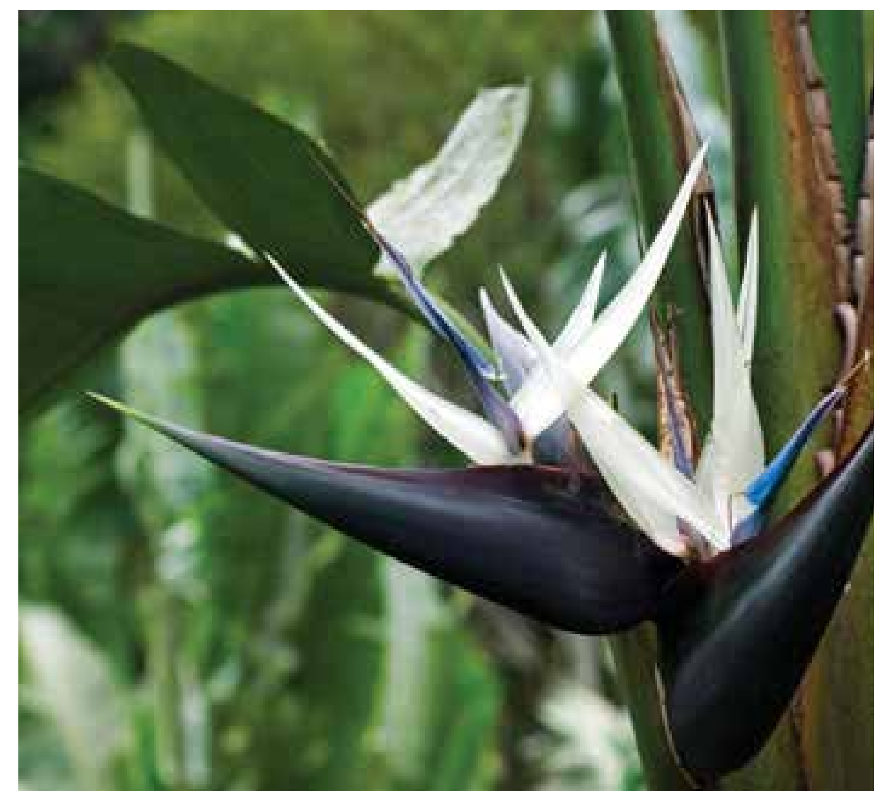
White Bird of Paradise - (15 gallon)