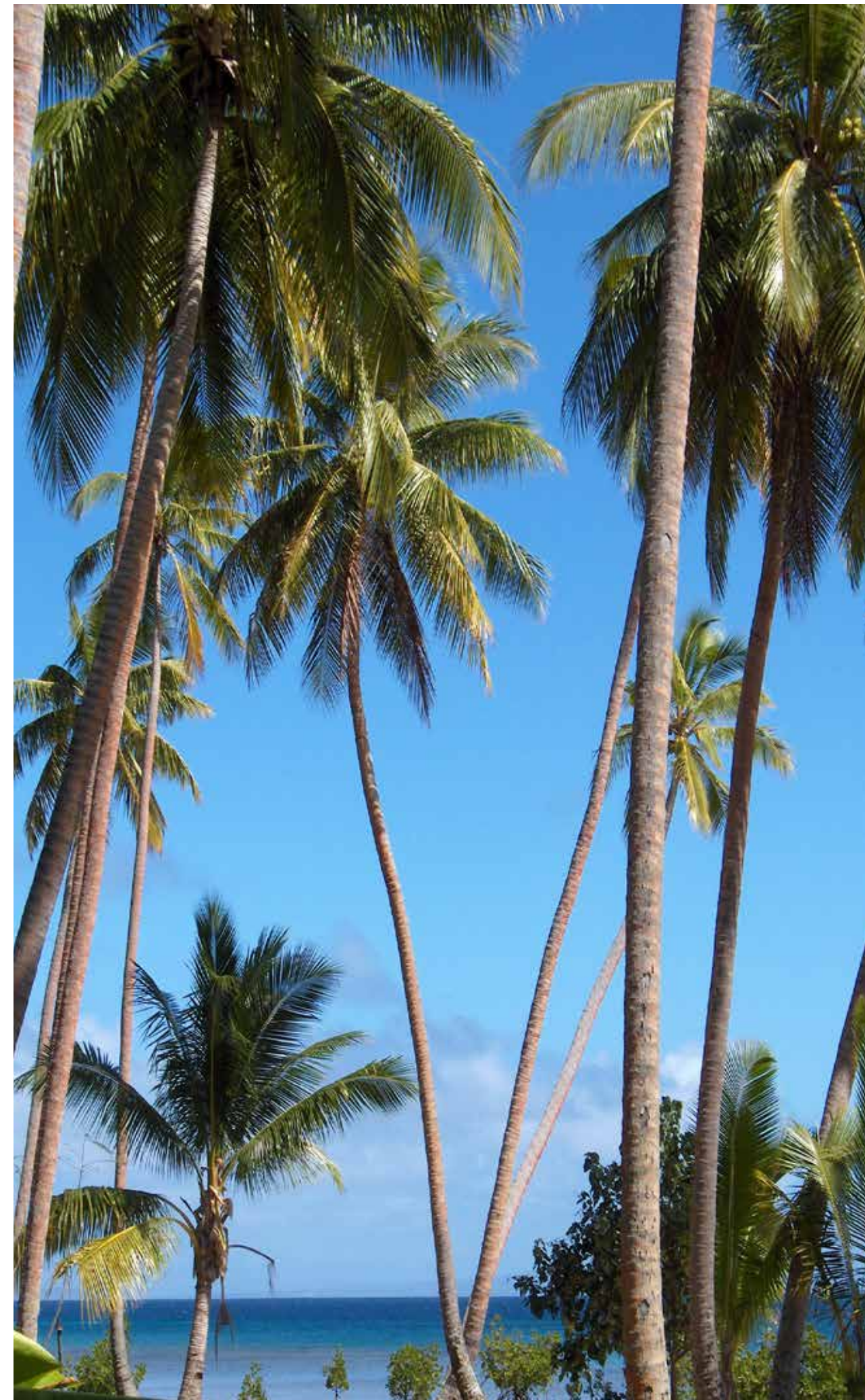
COCONUT PALM - (FG - 24')