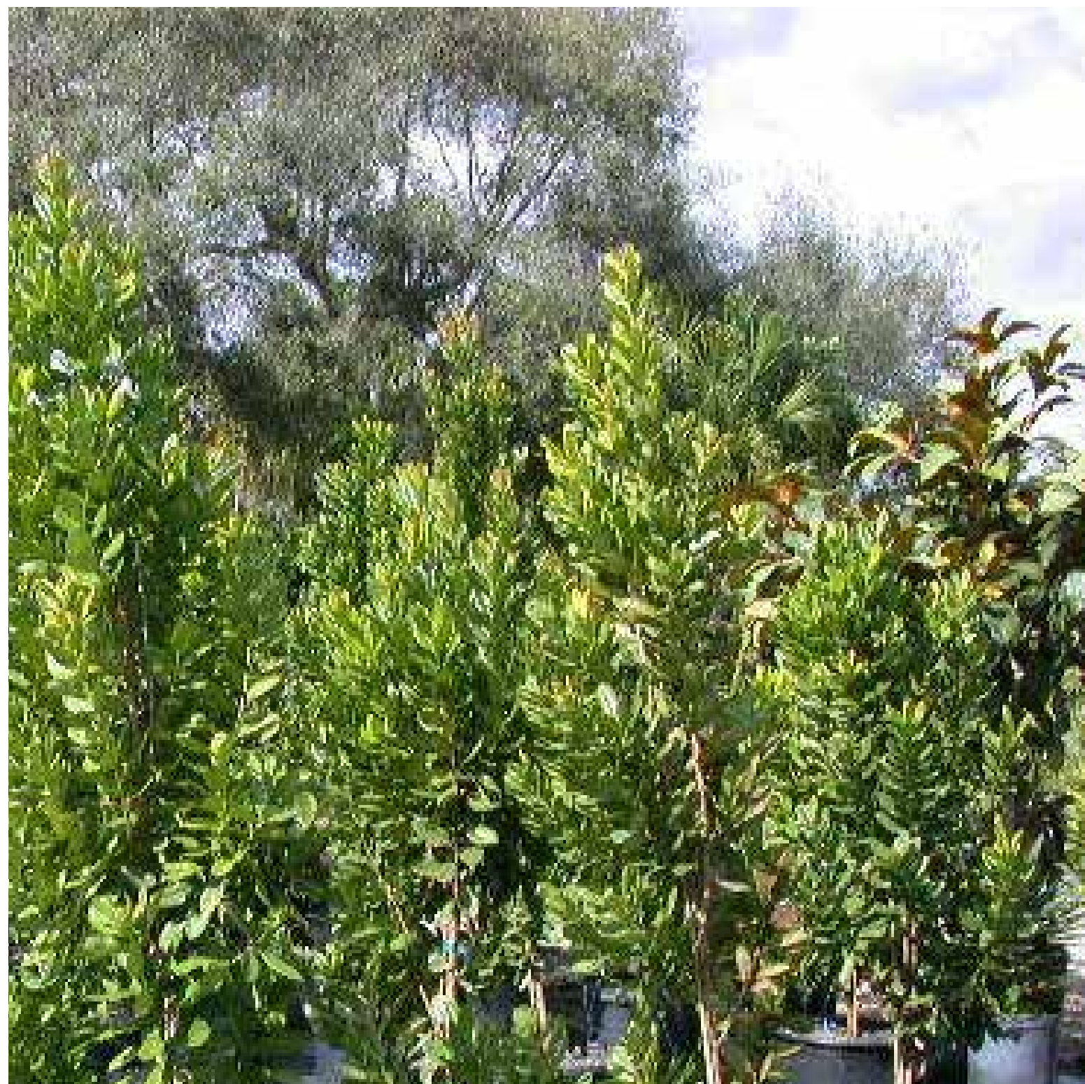
BAY RUM - (30 GALLON)