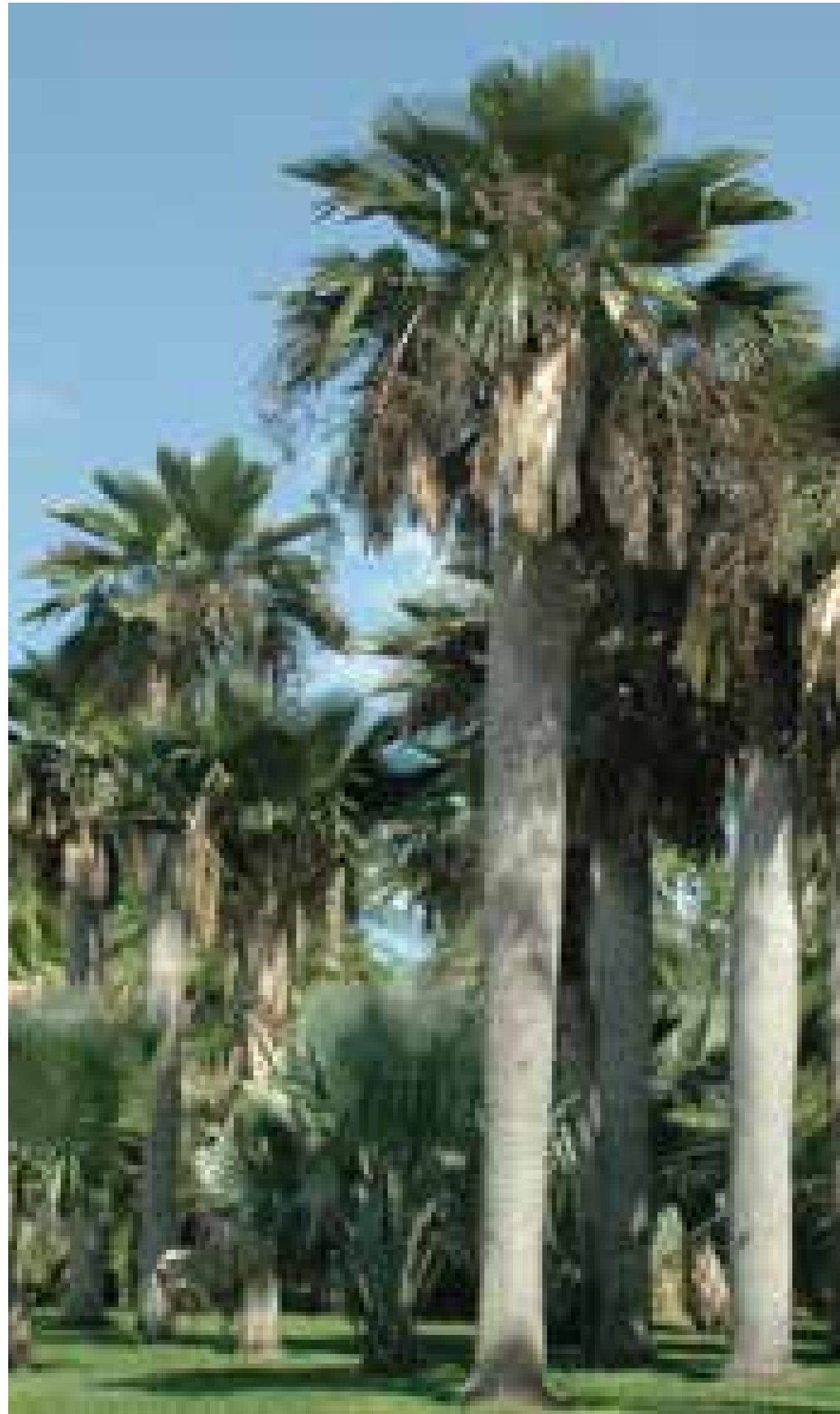
BAILEY PALM - (FG 24')