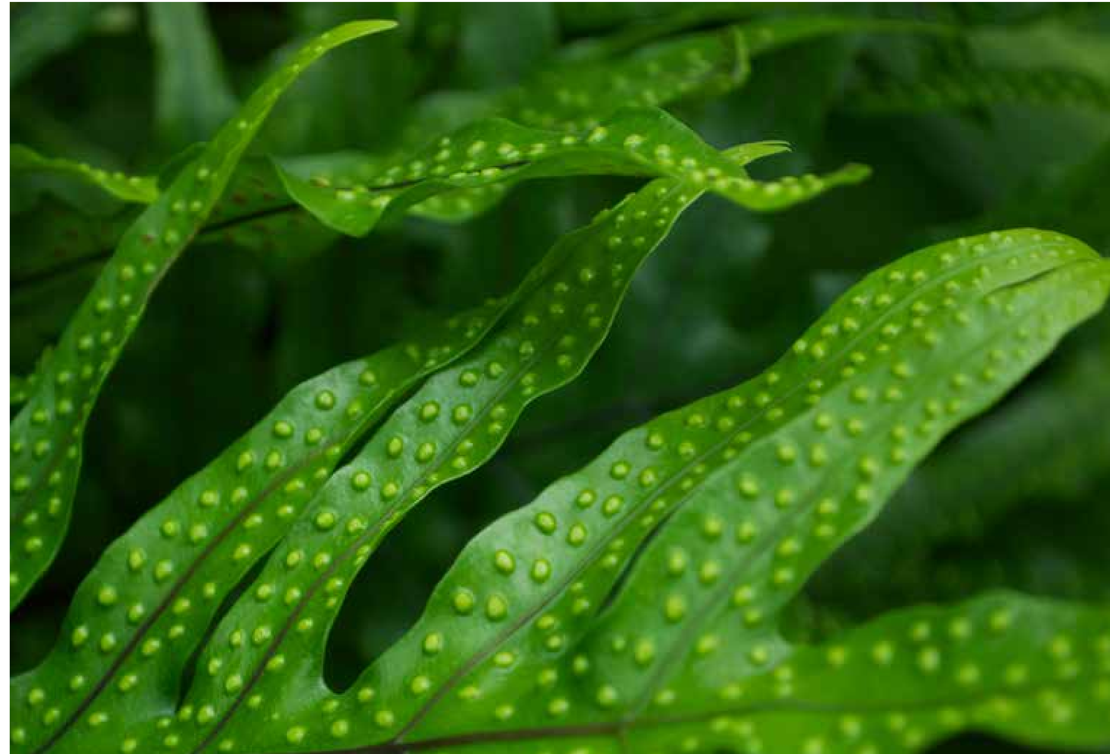
WART FERN - (3 GALLON)