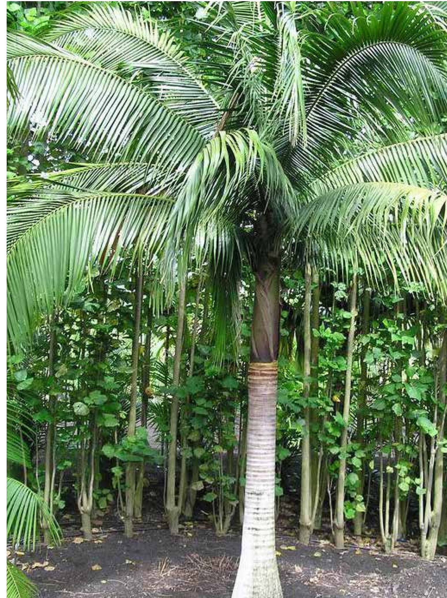
SALT PALM - (FG - 18')