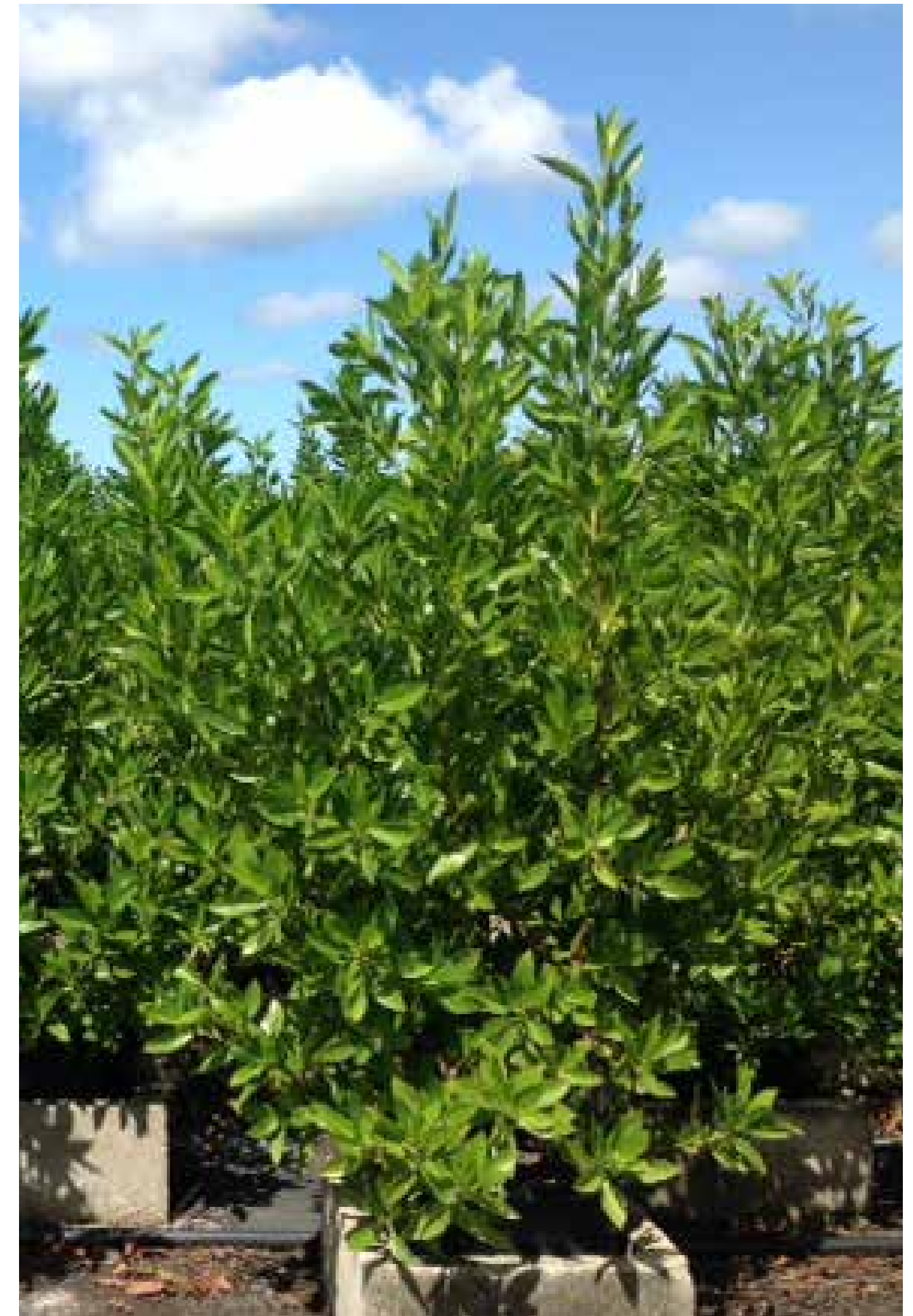
GREEN BUTTWOOD - (30 GALLON)