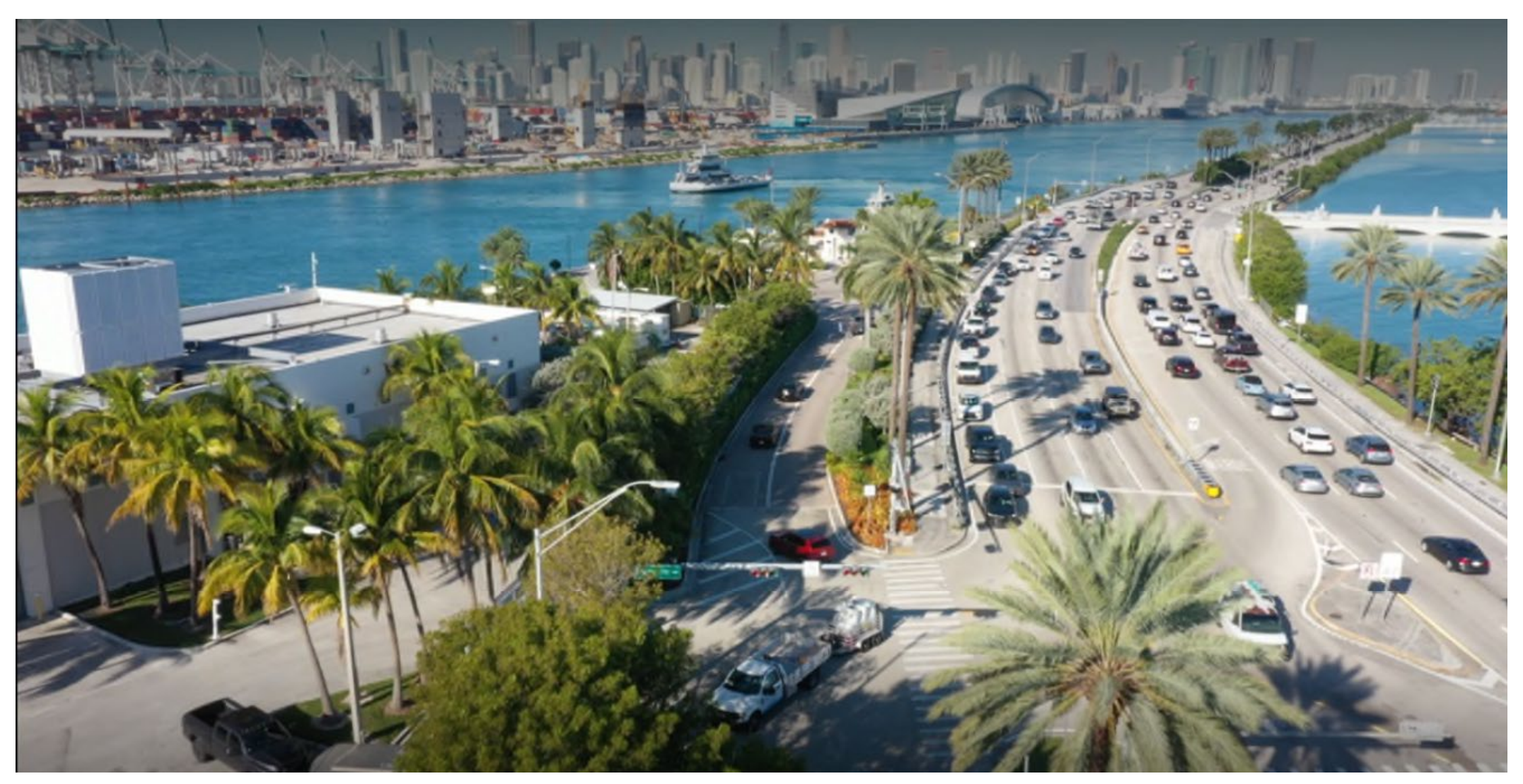
January 10, 2023