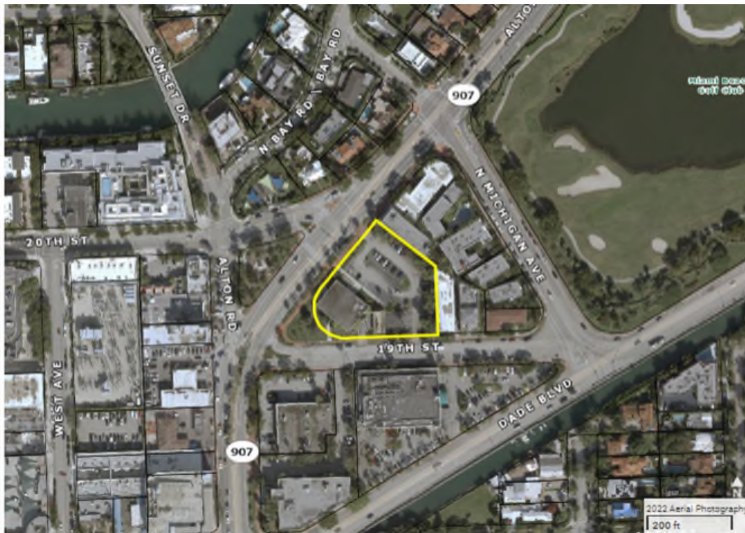
Figure 1, Aerial

the Property is zoned Commercial Low Intensity (CD-1) under the City's land development regulations.