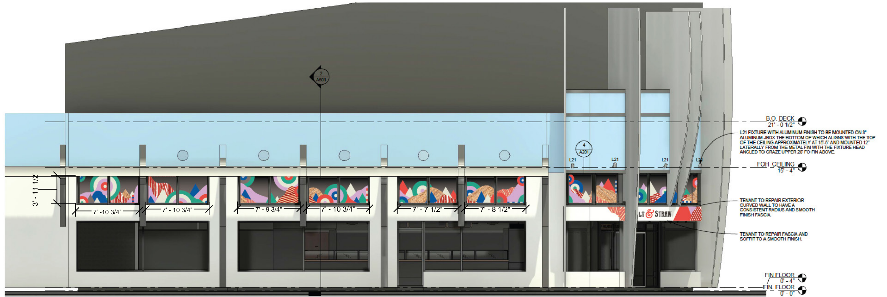
② EXTERIOR ELEVATION 1 1/4" = 1'-0"