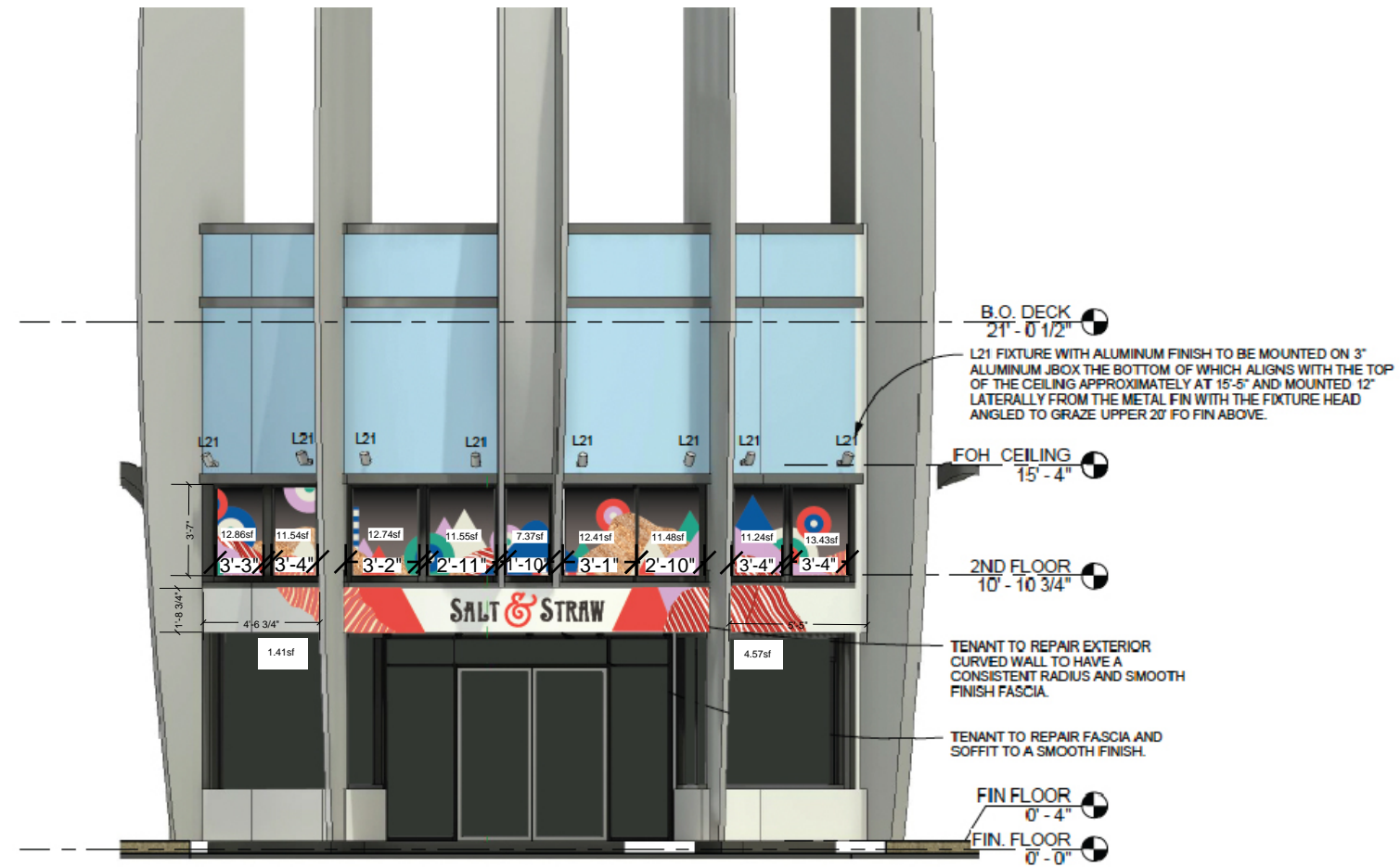
③ EXTERIOR ELEVATION 2 1/4" = 1'-0"

ELEMENTS WRAP DOWN THE FACADE TO CONNECT WITH THE CEILING ART