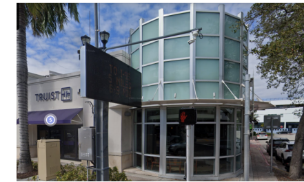
TRUIST BANK 1