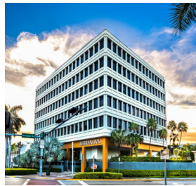
801 ARTHUR GODFREY S