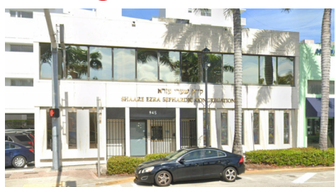
SEPHARDIC CONGREGATION 4