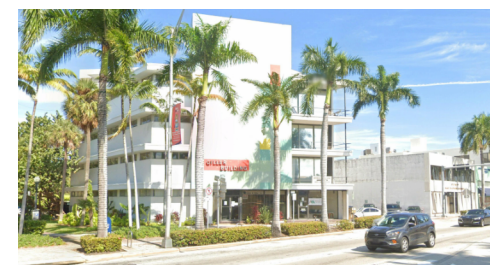
GILLER BUILDING 3