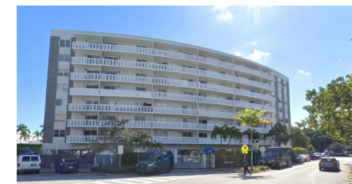
4141 APARTMENTS 2