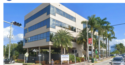
777 OFFICE BUILDING 6