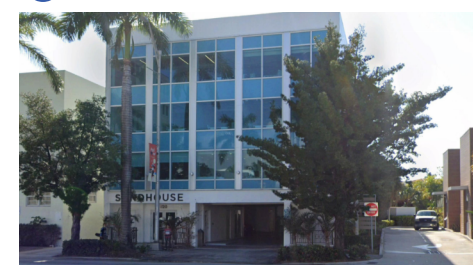
SAND HOUSE 5