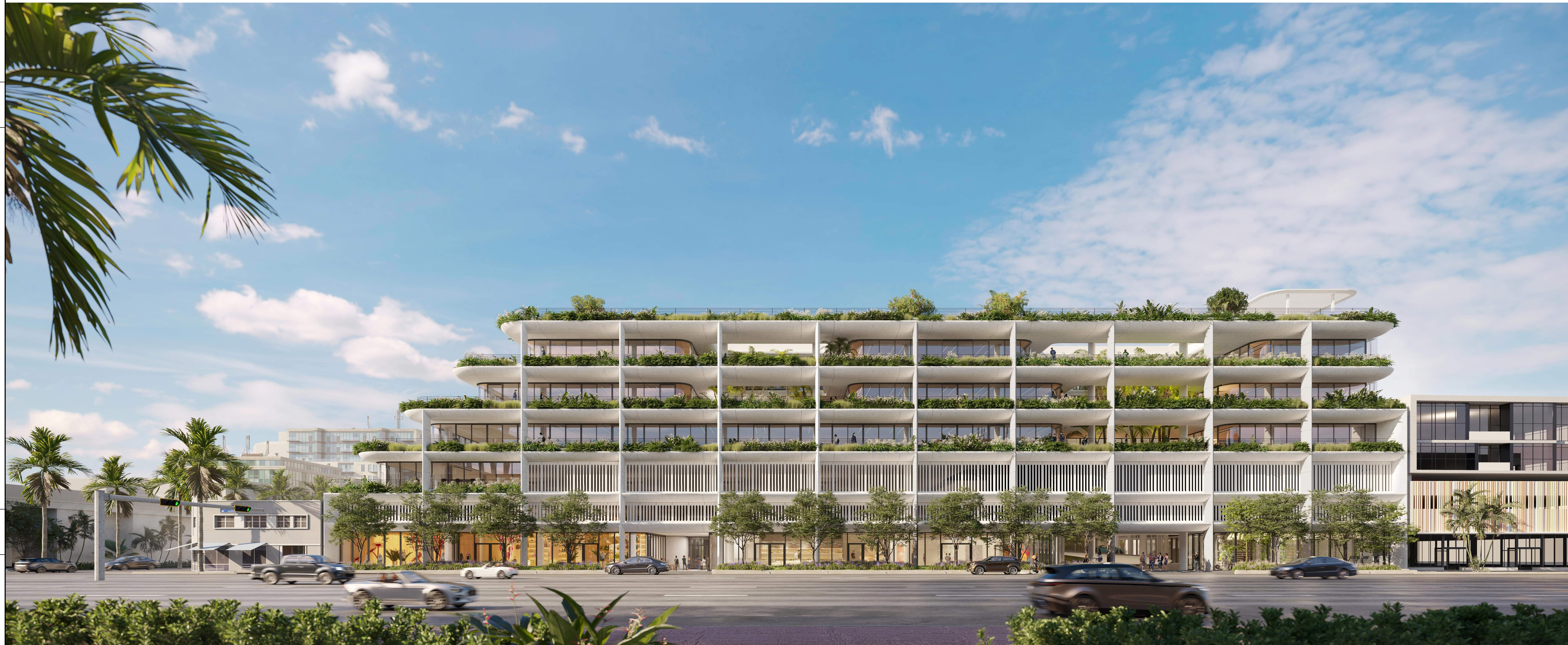
PROPOSED ELEVATION EAST - RENDERING