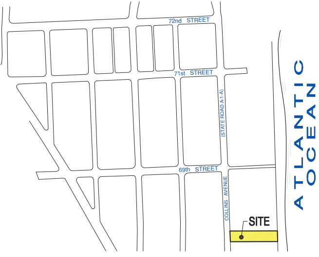
LOCATION SKETCH NOT TO SCALE