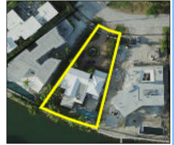
AERIAL PHOTOGRAPH (MAY NOT SHOW LATEST IMPROVEMENTS) (NOT-TO-SCALE)

BEARING REFERENCE: NONE. RECORD INFORMATION RELIANT UPON ANGULAR DATA ONLY. ALL ANGULAR DATA SHOWN HEREON REFERENCED THERETO.