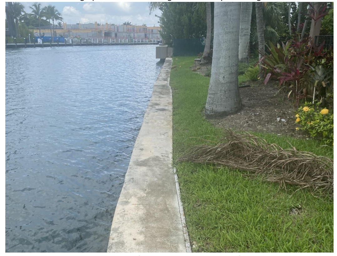
Photograph 2: View of existing seawall and yard facing west.