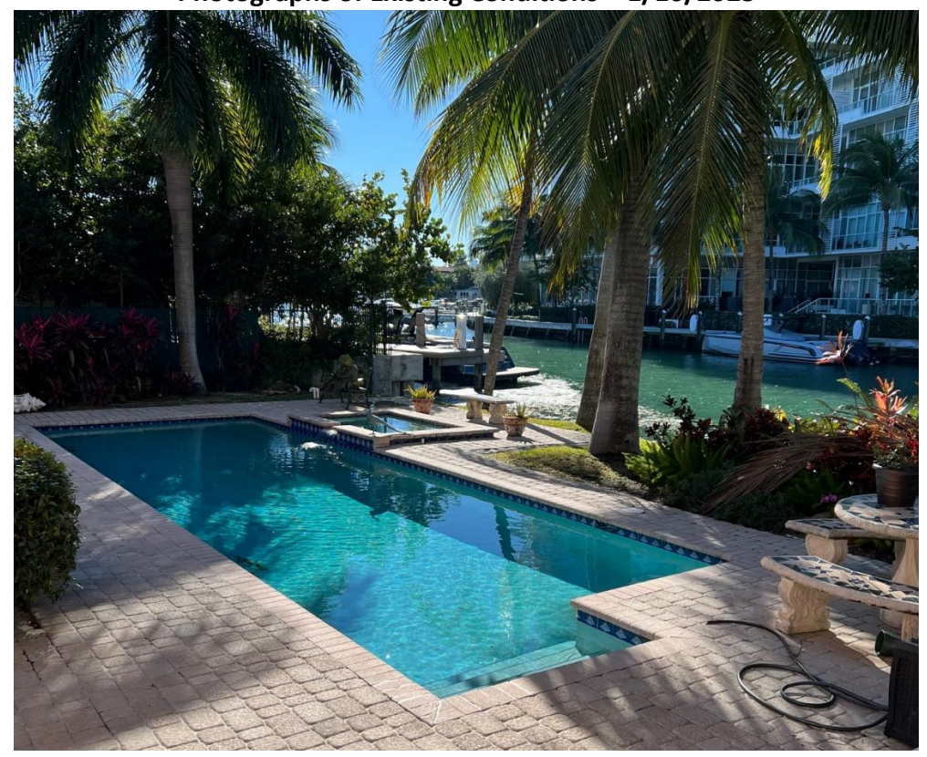
Photograph 7: View of existing pool and pool deck with unobstructed view of the canal.