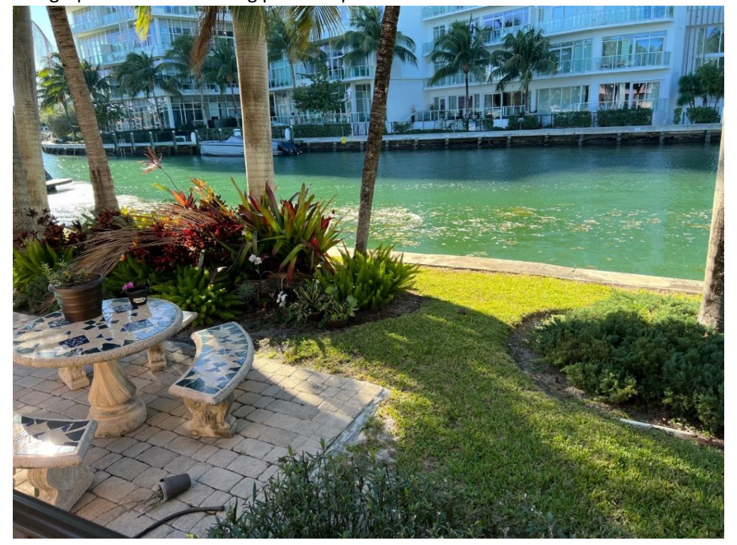
Photograph 8: View of canal facing south showing grading of the yard.