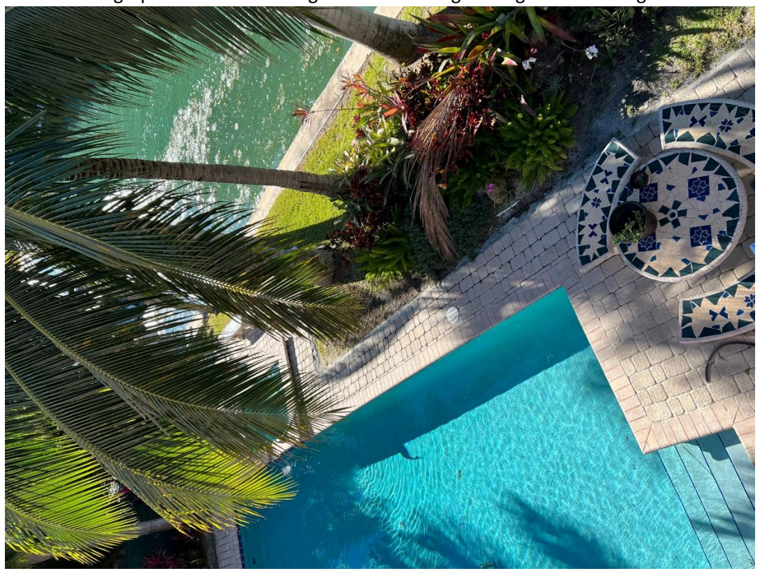
Photograph 6: View of existing pool and pool deck showing grading of the yard.