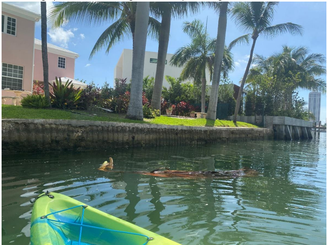
Photograph 4: View of existing seawall and structure and neighboring seawall from the canal facing northeast.

Photograph 3: View of existing seawall and yard facing the canal to the south.