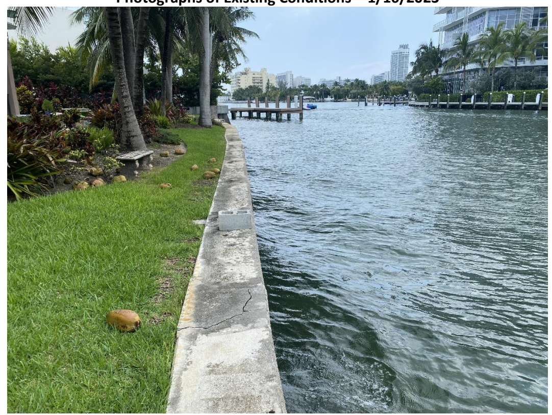
Photograph 1: View of existing seawall and yard facing east.