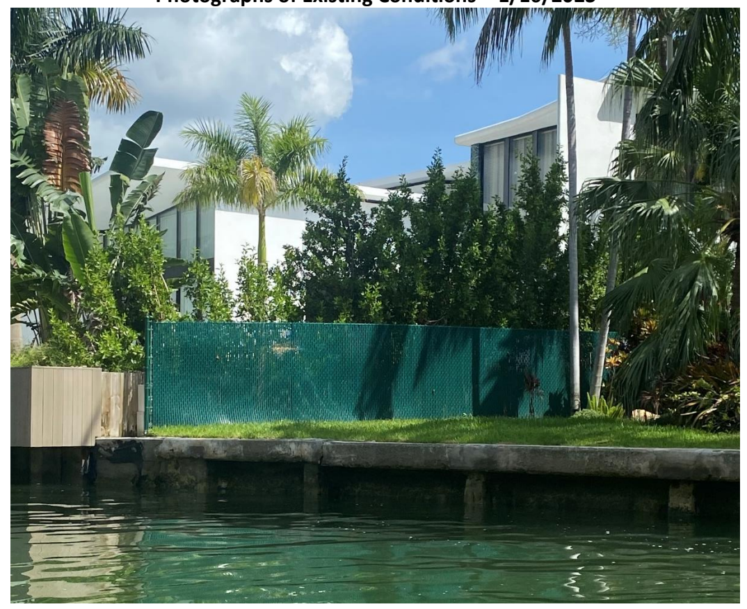
Photograph 5: View of existing seawall and neighboring seawall facing west.